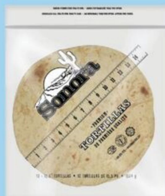
SONORA 13.5" FLOUR TORTILLAS 12'S 21532737_EA