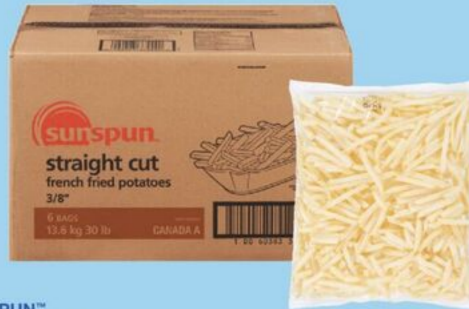
SUNSPUN™ STRAIGHT CUT 3/8 FRENCH FRIES FROZEN, 13.6 KG 20313990001_EA