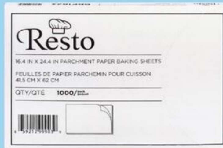
PARCHMENT PAPER SHEETS 16.4" X 24.4" 1000'S 21566297_C01