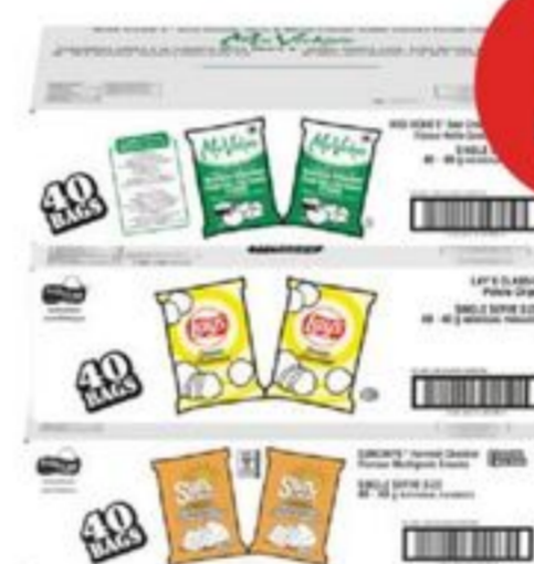
MISS VICKIE'S, LAY'S CLASSIC OR SUNCHIPS HARVEST CHEDDAR CHIPS 40 G X 40'S 21588060_C40 20067191001_EA 20076447001_EA