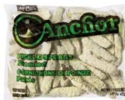
MCCAIN BATTERED PICKLES 1.81 KG 20993519_EA