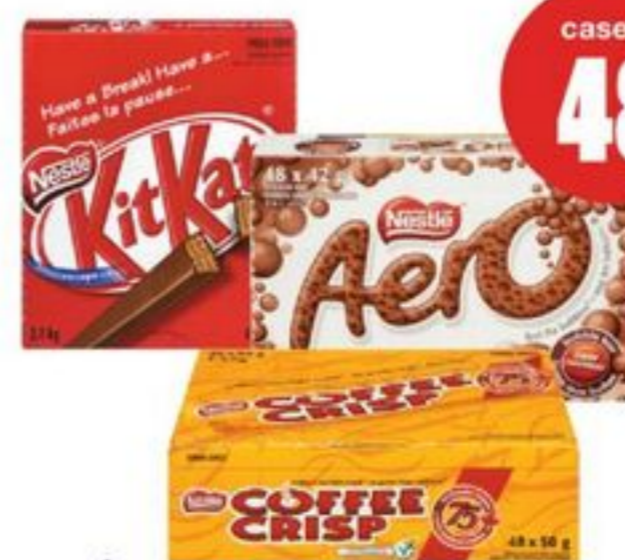
NESTLÉ COFFEE CRISP, KIT KAT OR AERO MILK CHOCOLATE SINGLE BARS 48'S 20019964_C48 20066954_C48 20306258_C48