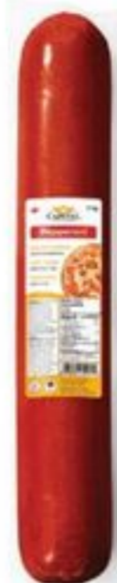
CAPITAL FINE MEATS PEPPERONI 3 KG 20000823_EA