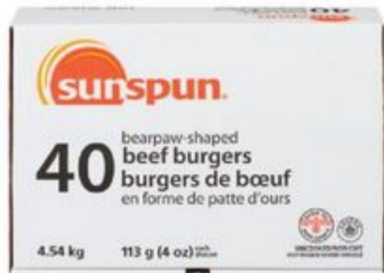
SUNSPUN™ BEEF BURGERS 4.54 KG 40 X 4 OZ. FROZEN 20150627_EA