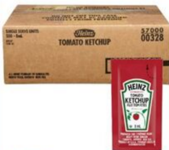
HEINZ KETCHUP PORTIONS 500'S 20000699_EA