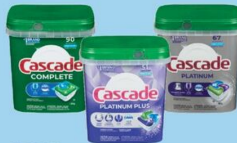
CASCADE PLATINUM DISHWASHER DETERGENT SELECTED VARIETIES 51'S-90'S 21012172_EA/21516545_EA 21518479_EA