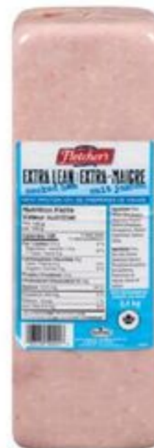
FLETCHER'S COOKED HAM EXTRA LEAN 3.4 KG 21418300_EA