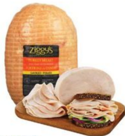
ZIGGY'S® SMOKED TURKEY BREAST EXTRA LEAN WHOLE PIECE VARIABLE WEIGHT 20324673_KG