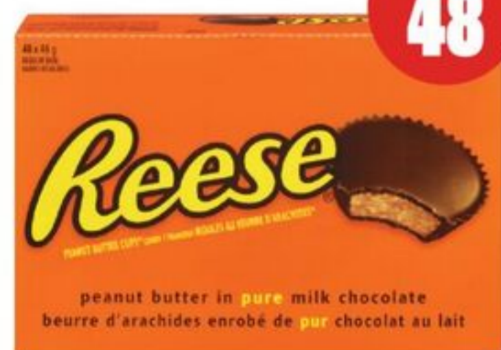
REESE'S PEANUT BUTTER CUPS SINGLE BARS 48'S 20582012_C48