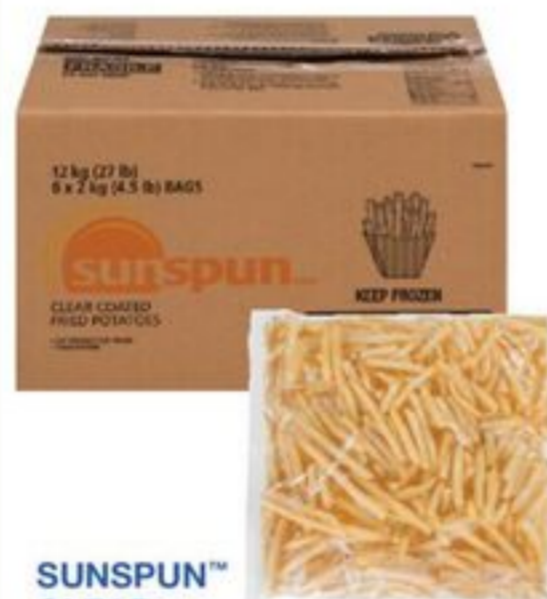
SUNSPUN™ CLEAR COATED FRIED POTATOES 12 KG 6 X 2 KG 20905111_EA