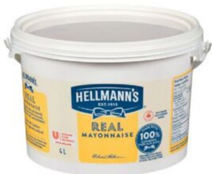
HELLMANN'S MAYONNAISE 4 L 20021711_EA