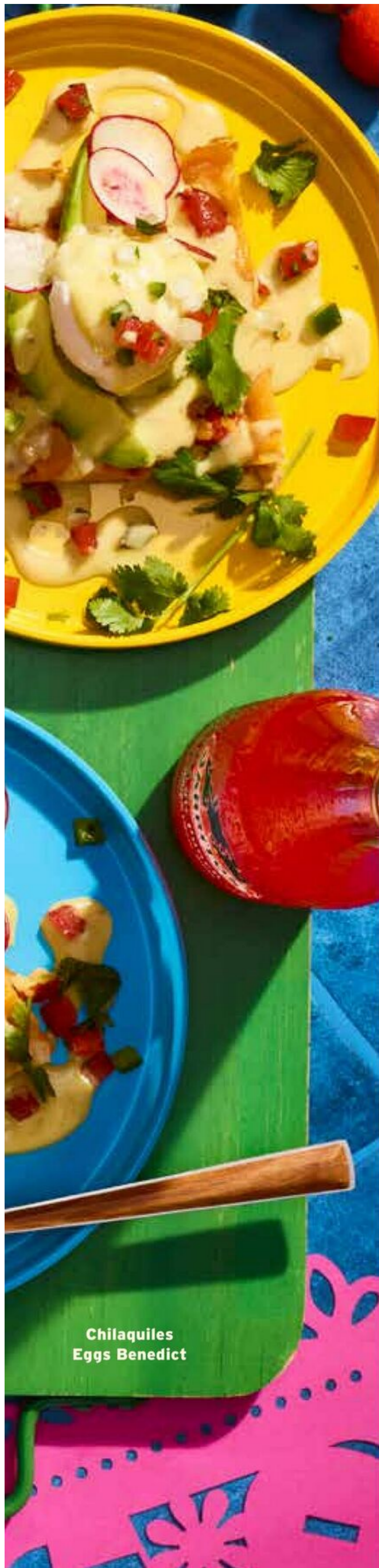
Chilaquiles Eggs Benedict