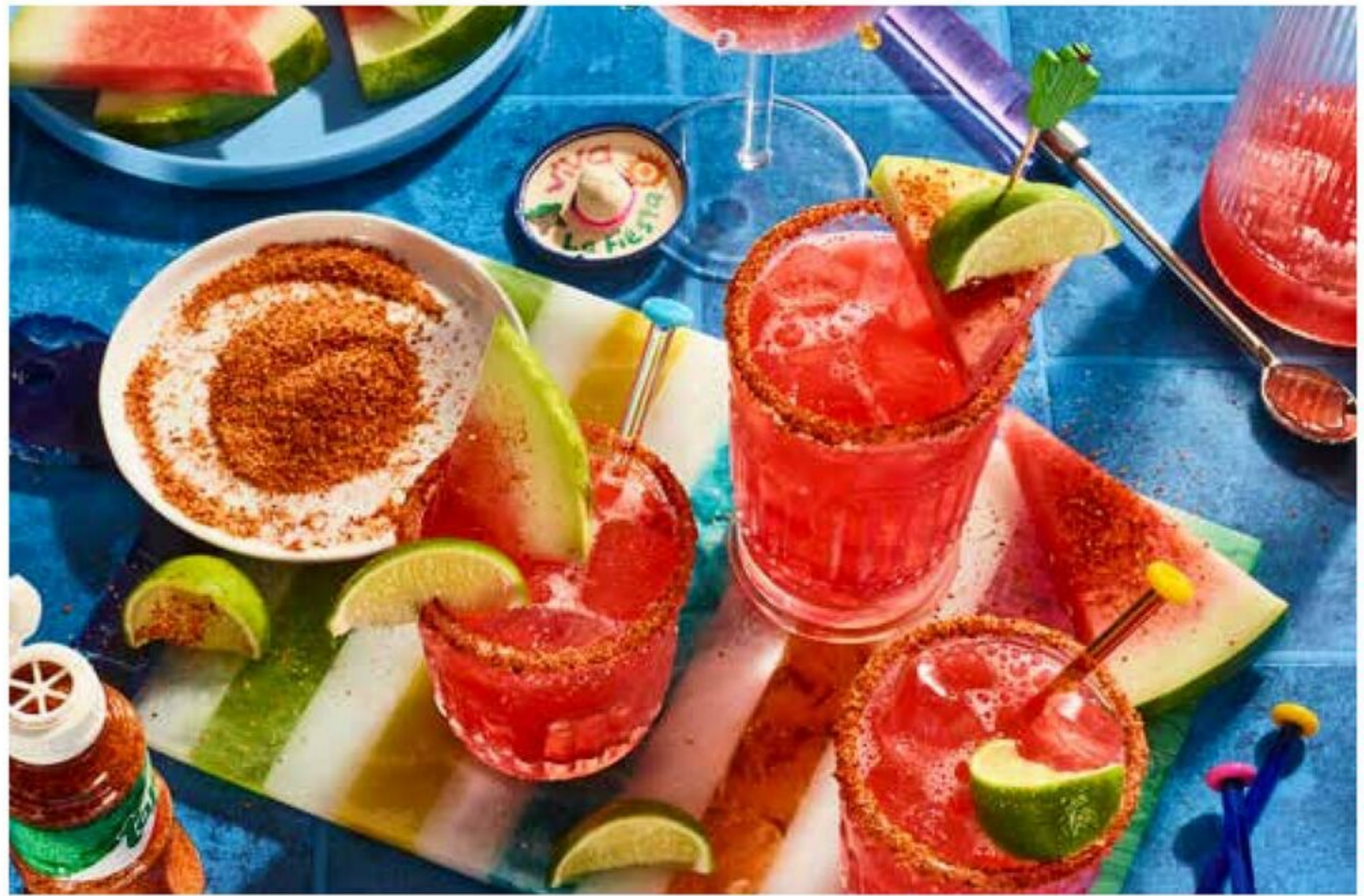
HAPPY HOUR HACK: SPIKE WITH TEQUILA OR WHITE RUM

Per Serving (12 oz): Calories: 150, Fat: 0 g (0 g Saturated Fat), Cholesterol: 0 mg, Sodium: 5 mg, Carbohydrates: 39 g, Fiber: 1 g, Protein: 2 g.