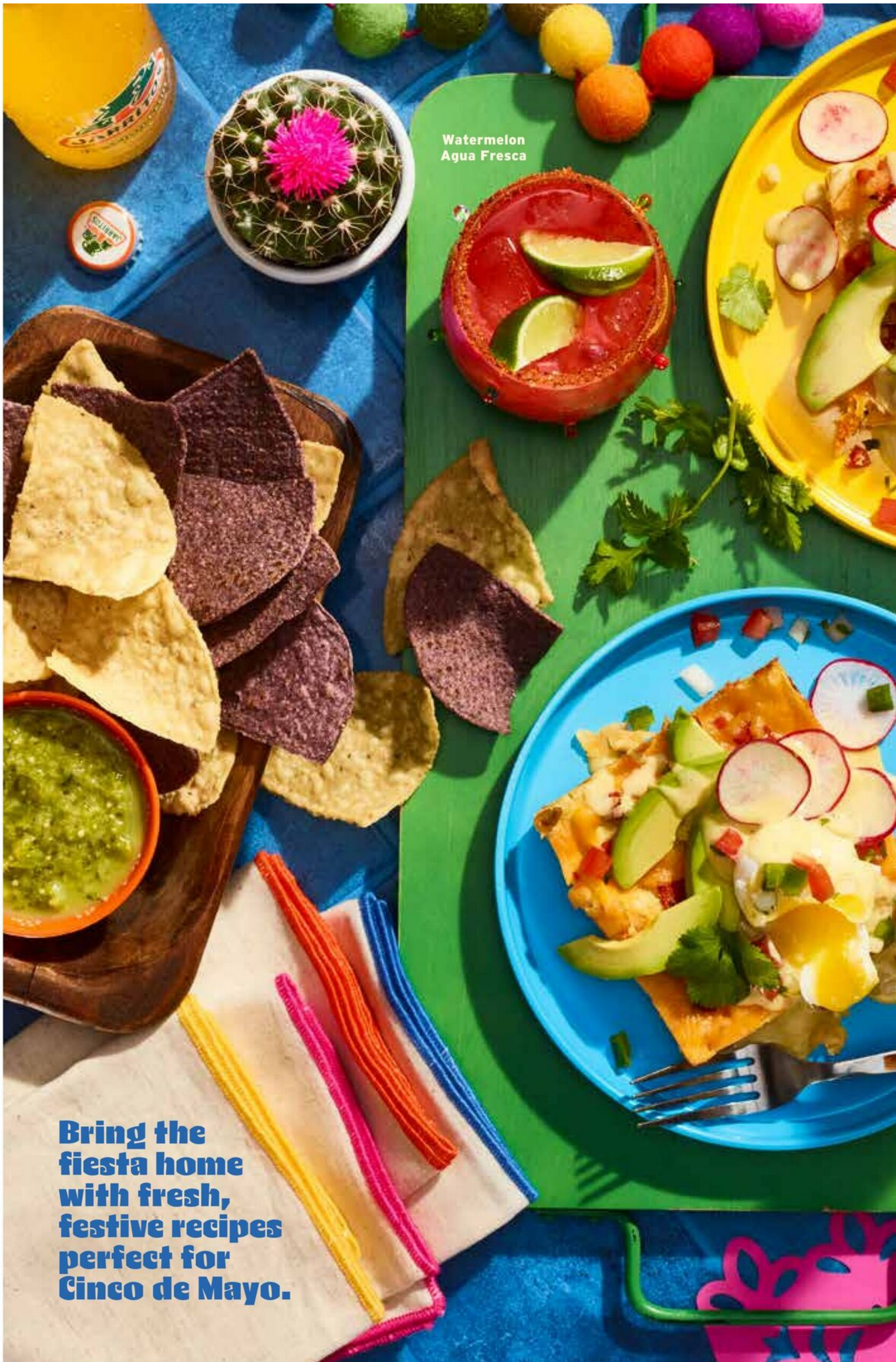
Watermelon Agua Fresca

Bring the fiesta home with fresh, festive recipes perfect for Cinco de Mayo.