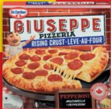
DR. OETKER THIN CRUST or RISING CRUST PIZZA selected varieties, frozen, 439-785 g pizza 21106361_EA