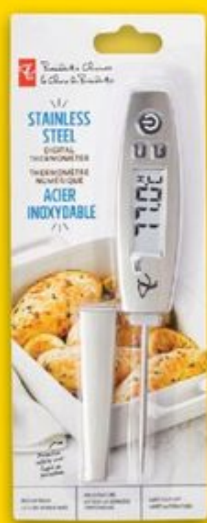
PC® INSTANT READ DIGITAL PEN THERMOMETER 21218258_EA