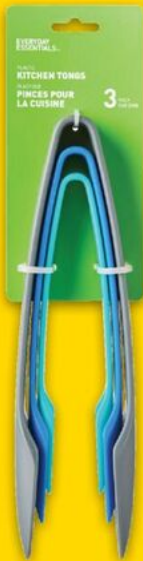
EVERYDAY ESSENTIALS™ NESTED TONGS 3 pack 21162313_EA