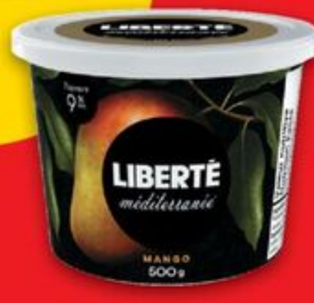
LIBERTÉ MÉDITERRANÉE 500 g, CRUNCH 2's or YOPLAIT PROTEIN 650 g YOGURT selected varieties yogourt 21547567_EA