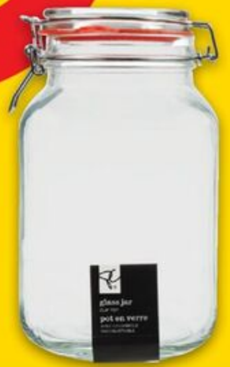
PC® SQUARE CLIP JAR 2.0 L 20774691_EA