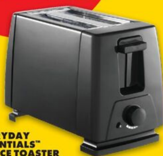
EVERYDAY ESSENTIALS™ 2 SLICE TOASTER 20219347002_EA