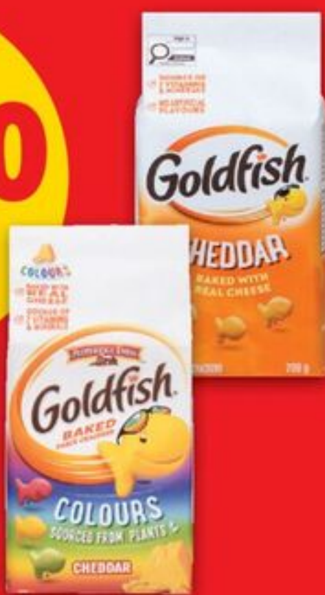
GOLDFISH CRACKERS selected varieties 167-227 g craquelins 20300320_EA/20306994003_EA