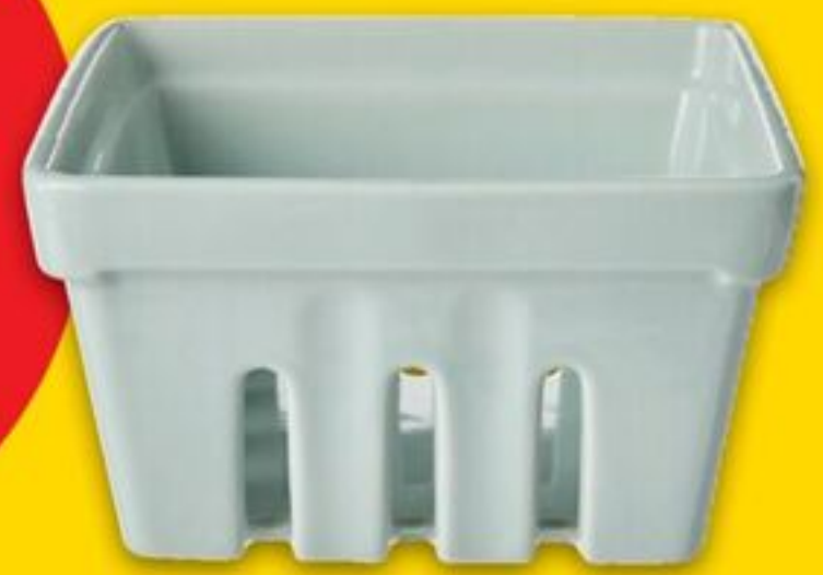
PC® CERAMIC BERRY PINT blue 21351929_EA