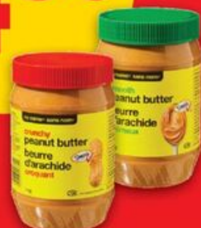
NO NAME® PEANUT BUTTER selected varieties, 1 kg beurre d'arachide 20296985001_EA/20296985002_EA