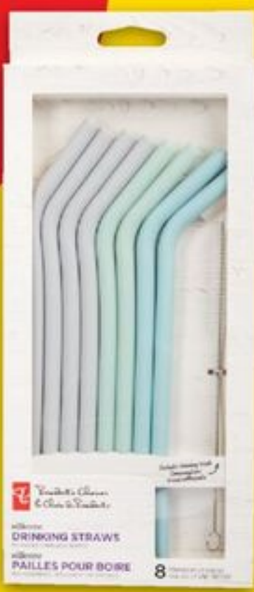
PC® SILICONE DRINKING STRAWS WITH BRUSH 21186435_EA