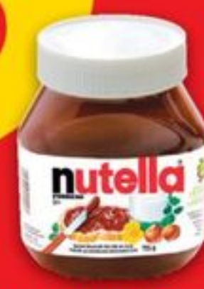
NUTELLA HAZELNUT SPREAD 725 g or NUTELLA & GO HAZELNUT SPREAD WITH BREADSTICKS 208 g tartina de noisettes ou tartina de noisettes avec bâtonnets 20436105_EA