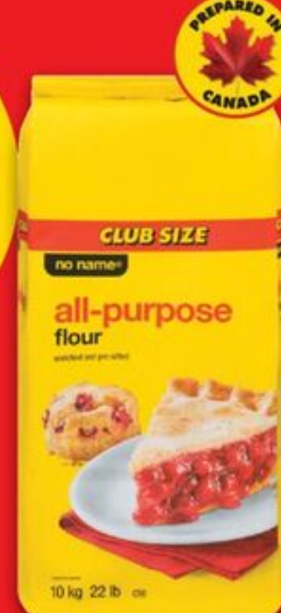
NO NAME® FLOUR Club Size, selected varieties 10 kg farine 20022248_EA