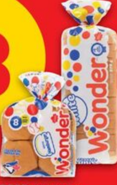
WONDER BREAD 570/675 g or BUNS 8's selected varieties pain ou petits pains 20297455_EA/20305674_EA