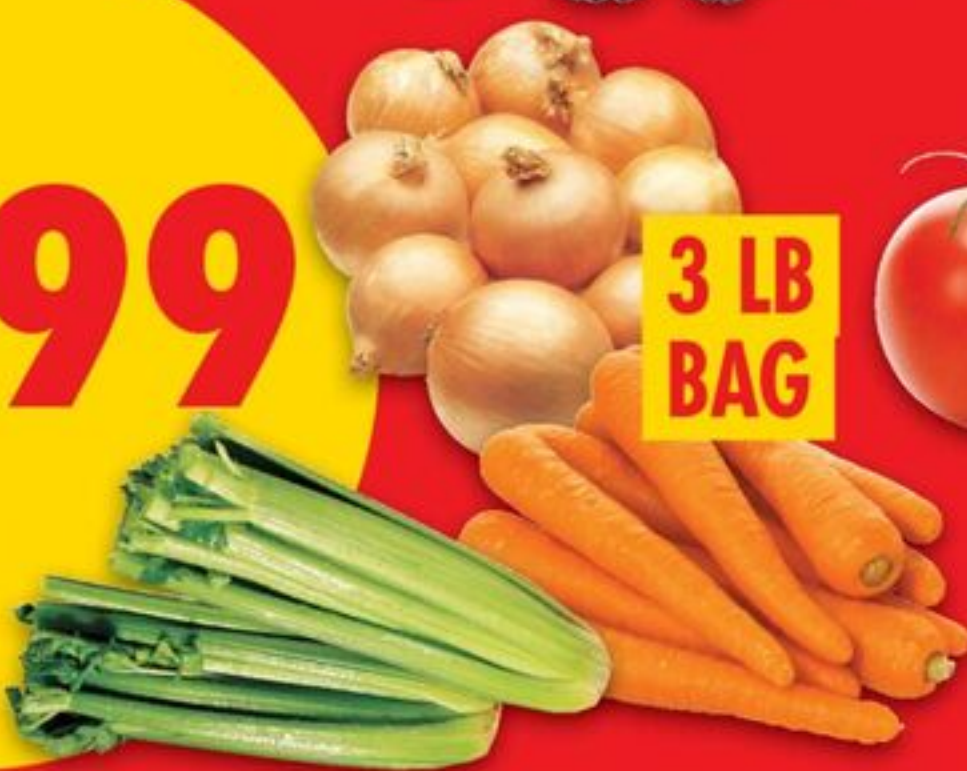
CELERY product of U.S.A., no. 1 grade or FARMER'S MARKET™ CARROTS or YELLOW ONIONS product of Canada, Canada no. 1 grade céleri, carottes ou oignons jaunes 20600927001_EA/20811994001_EA/20163119001_EA