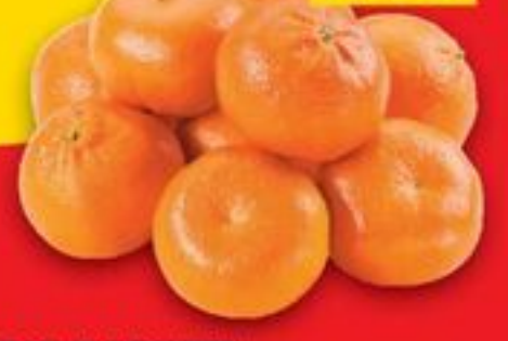
FARMER'S MARKET™ MANDARINS product of Morocco or Spain mandarines 20054025001_EA