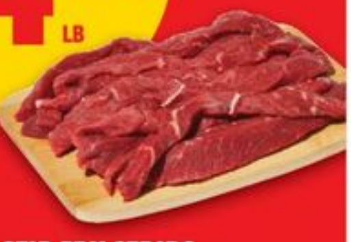
BEEF STIR FRY STRIPS fresh lanières de bœuf à sauter 31.97/kg 20328005_KG