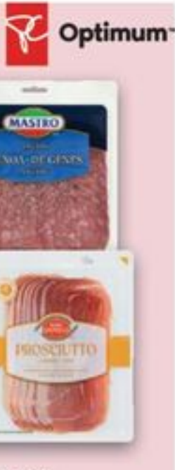
MASTRO SALAMI 150 g or SAN DANIELE PROSCIUTTO 100 g selected varieties salami ou prosciutto 20581660_EA/1061099_EA