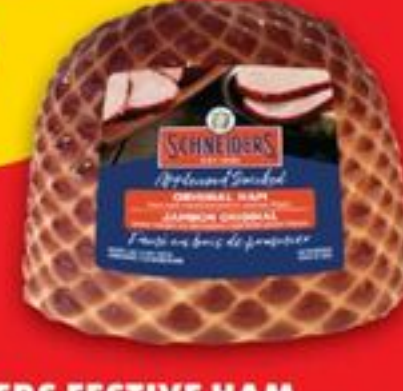
SCHNEIDERS FESTIVE HAM jambon 17.62/kg 21194338_KG