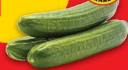
ENGLISH CUCUMBERS product of Canada, Canada no. 1 grade each concombres anglais 20070132001_EA