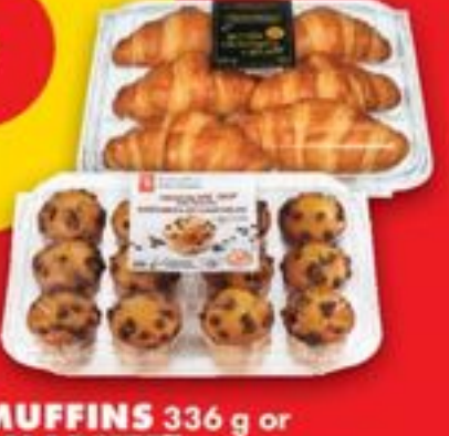
PC™ MINI MUFFINS 336 g or FARMER'S MARKET™ BUTTER CROISSANTS 260-336 g selected varieties mini-muffins ou croissants au beurre 20565382_EA/20975943_EA/21488839_EA