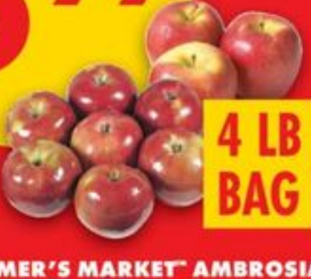
FARMER'S MARKET™ AMBROSIA or MCINTOSH APPLES product of Atlantic Provinces, Canada fancy grade pommes 21307212001_EA/20713211001_EA