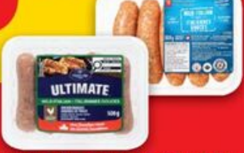
PC™ SAUSAGE or ULTIMATE DINNER or BREAKFAST CHICKEN SAUSAGES selected varieties 375/500 g saucisses 21378310_EA/21584342_EA