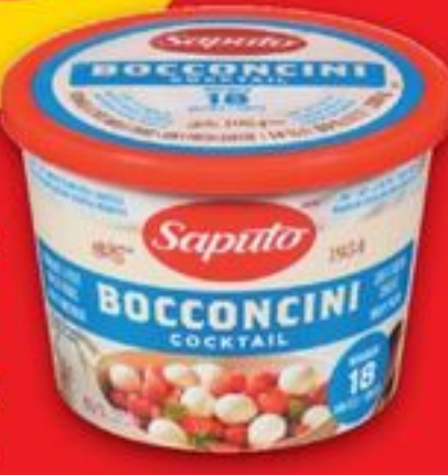
SAPUTO CHEESE selected varieties 125-200 g fromage 20708942_EA