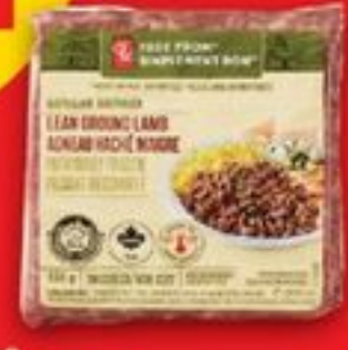
PC™ FREE FROM™ LEAN GROUND LAMB 454 g agneau haché maigre 21352008_EA