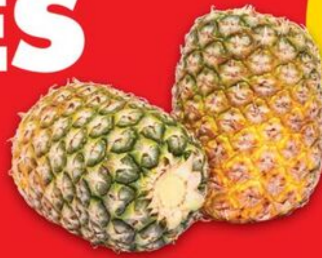
PINEAPPLE product of Costa Rica ananas 20119813001_EA