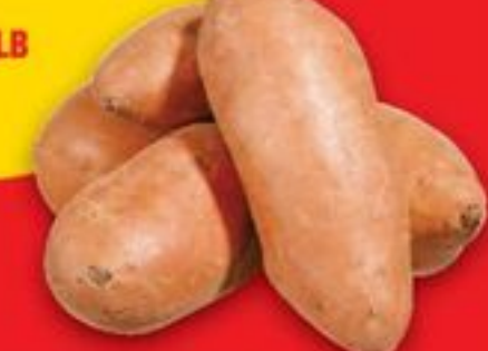
SWEET POTATOES product of Canada or U.S.A. patates douces 3.73/kg 20127708001_KG