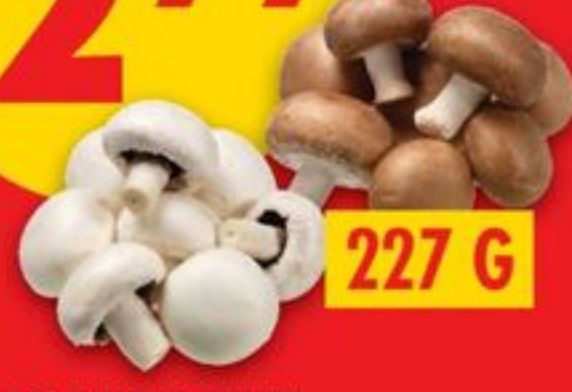
PC™ WHOLE WHITE or CREMINI MUSHROOMS product of Canada champignons 20775803_EA/20076239_EA