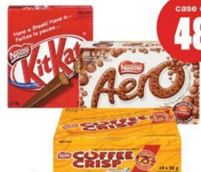
NESTLÉ COFFEE CRISP, KIT KAT OR AERO MILK CHOCOLATE SINGLE BARS 48'S 20019964_C48 20066954_C48 20306258_C48