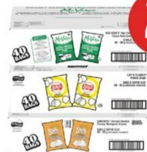
MISS VICKIE'S, LAY'S CLASSIC OR SUNCHIPS HARVEST CHEDDAR CHIPS 40 G X 40'S 21588060_C40 20067191001_EA 20076447001_EA