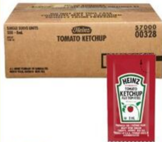
HEINZ KETCHUP PORTIONS 500'S 20000699_EA