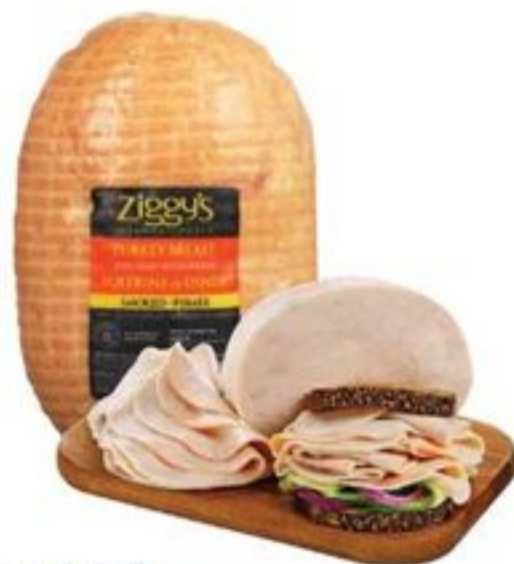
ZIGGY'S® SMOKED TURKEY BREAST EXTRA LEAN WHOLE PIECE VARIABLE WEIGHT 20324673_KG