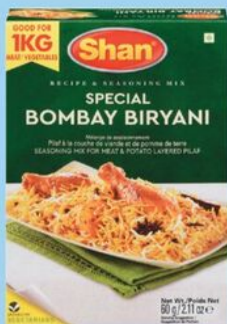
SHAN SPICE MIXES SELECTED VARIETIES 50-65 G 20323215002_EA