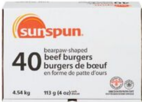
SUNSPUN™ BEEF BURGERS 4.54 KG 40 X 4 OZ. FROZEN 20150627_EA