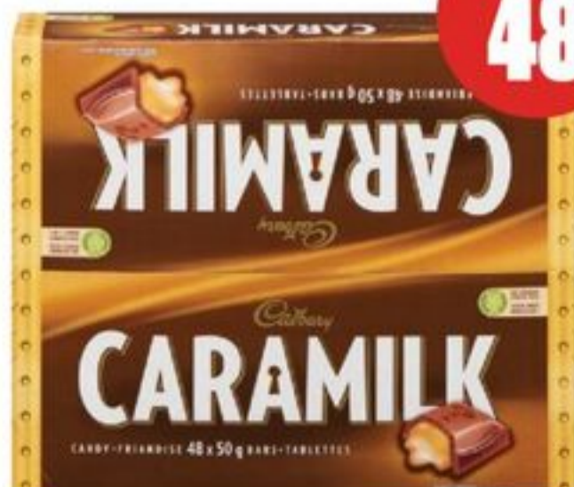
CARAMILK SINGLE BARS 48'S 20691851_C48