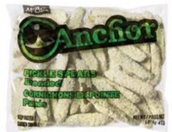
MCCAIN BATTERED PICKLES 1.81 KG 20993519_EA