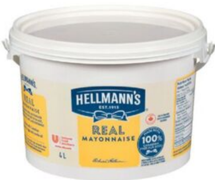
HELLMANN'S MAYONNAISE 4 L 20021711_EA