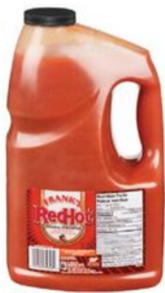
FRANK'S ORIGINAL RED HOT SAUCE 3.78 L 20130877_EA