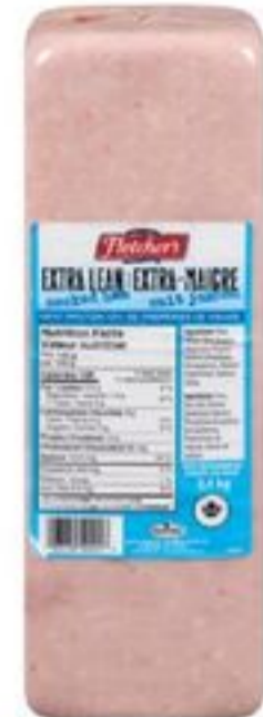
FLETCHER'S COOKED HAM EXTRA LEAN 3.4 KG 21418300_EA