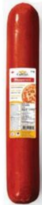
CAPITAL FINE MEATS PEPPERONI 3 KG 20000823_EA