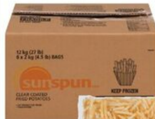
SUNSPUN™ CLEAR COATED FRIED POTATOES 12 KG 6 X 2 KG 20905111_EA