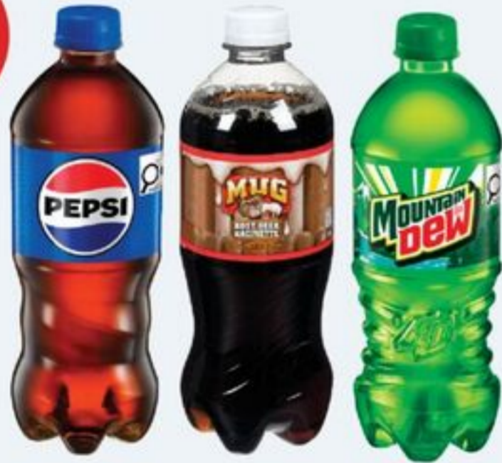
PEPSI SOFT DRINKS SELECTED VARIETIES 591 ML 20317326_EA