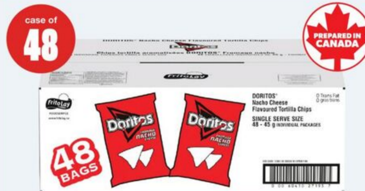
DORITOS CHIPS SELECTED VARIETIES 48'S 20298970001_EA