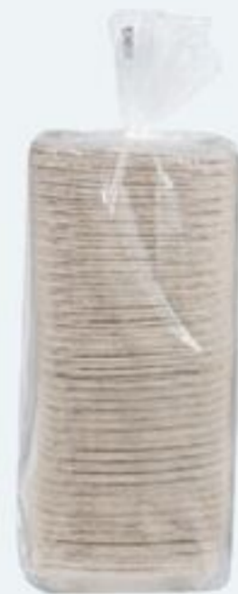
SAVADAY FOOD TRAY SELECTED VARIETIES 125'S 20693348_EA