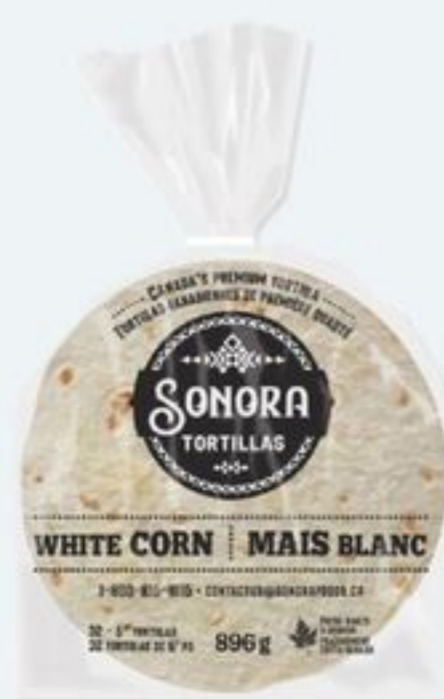
SONORA CORN TORTILLAS WHITE, 896 G 21611146_EA