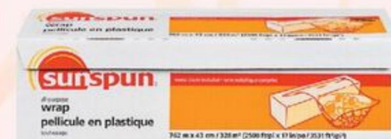
SUNSPUN™ ALL-PURPOSE WRAP 2500' X 17" 20077370_EA