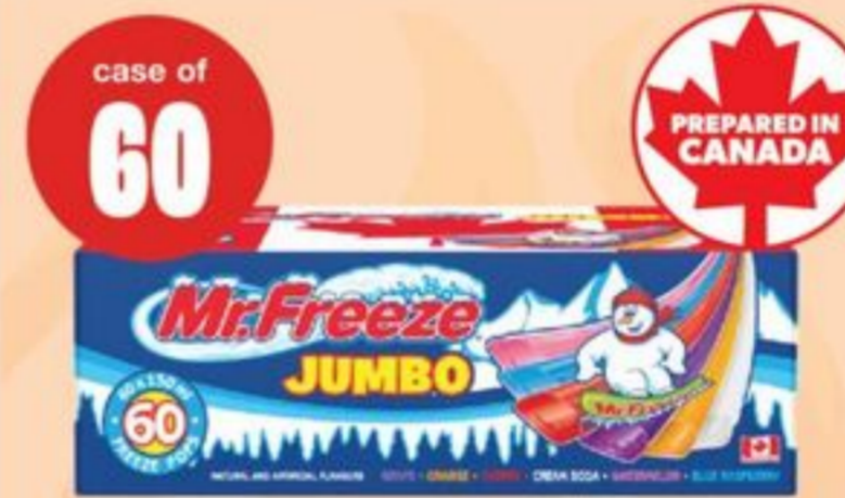
MR. FREEZE JUMBO 60'S 21023268_C60