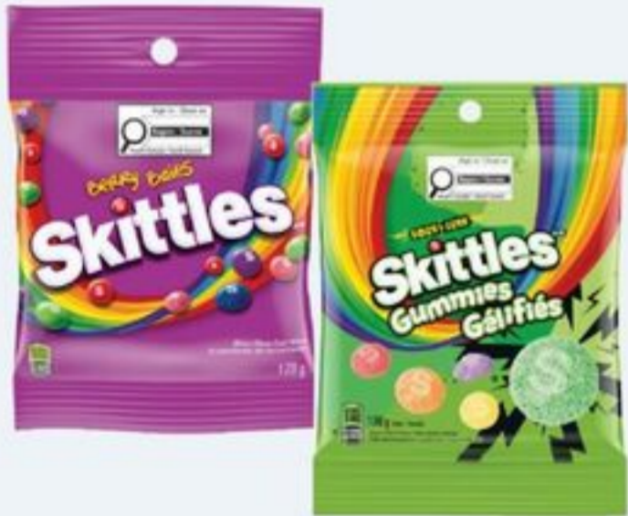
STARBURST OR SKITTLES SMALL BAGS SELECTED VARIETIES 130-170 G 21593995_EA/21646491_EA