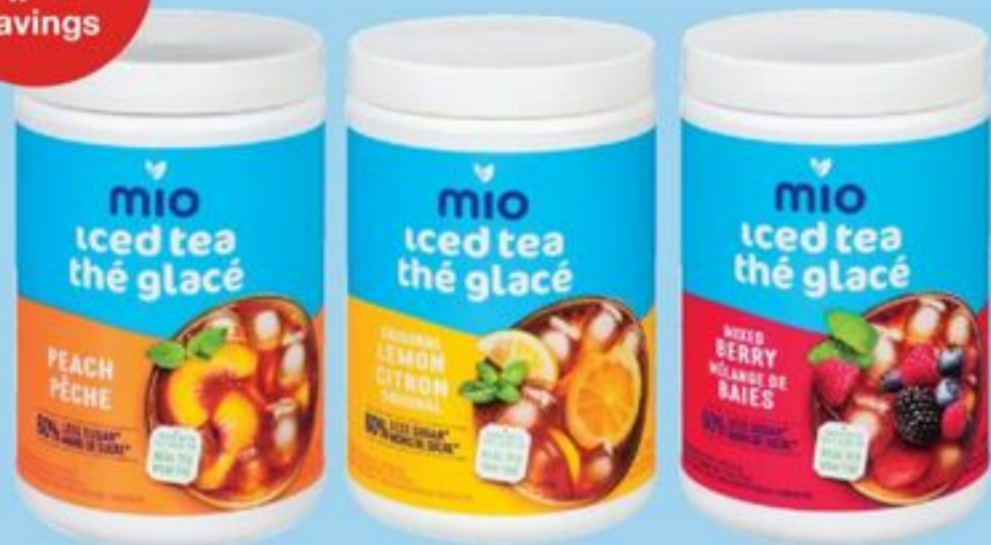
MIO ICED TEA SELECTED VARIETIES 540 G 21730486_EA