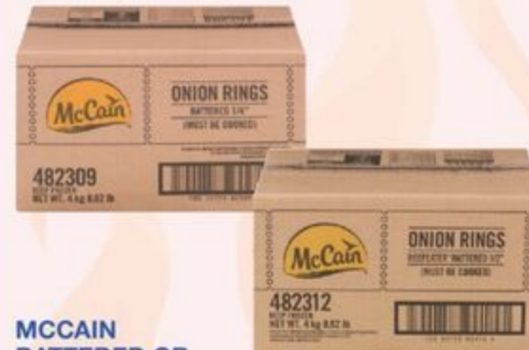
MCCAIN BATTERED OR BEEFEATER ONION RINGS FROZEN, 4 KG 20083180_EA/20779718_EA