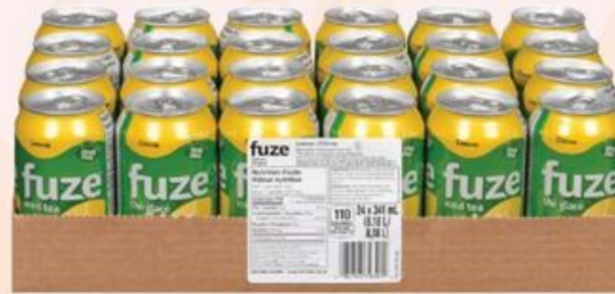
FUZE LEMON ICED TEA 24 X 341 ML 21656703_C24