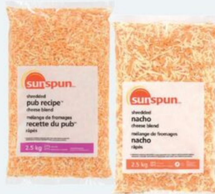
SUNSPUN™ SHREDDED CHEESE SELECTED VARIETIES 2.5 KG 21362802_EA/21362853_EA