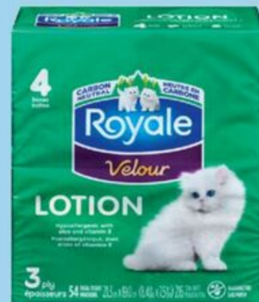
ROYALE FACIAL TISSUE 3 PLY, 216 SHEETS 21694004_EA