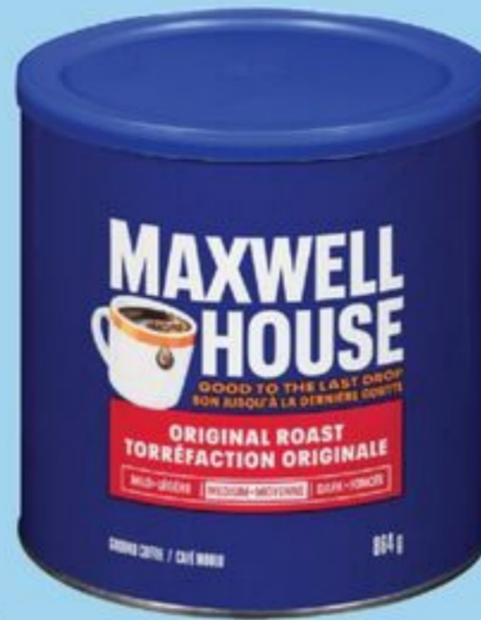
MAXWELL HOUSE ROAST AND GROUND COFFEE SELECTED VARIETIES 864-900 G 21606882_EA