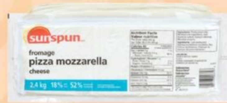
SUNSPUN™ PIZZA MOZZARELLA CHEESE 18% M.F., 2.4 KG 21383785_EA