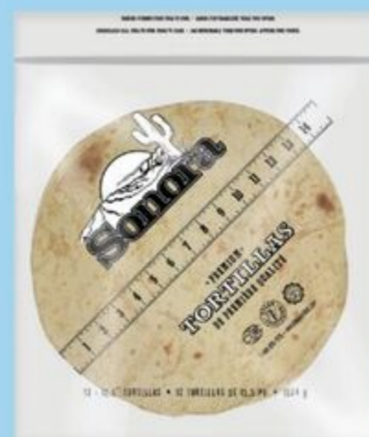
SONORA 13.5" FLOUR TORTILLAS 12'S 21532737_EA