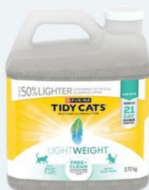
PURINA TIDY CATS LITTER SELECTED VARIETIES 2.72 KG 21206496_EA/21206503_EA