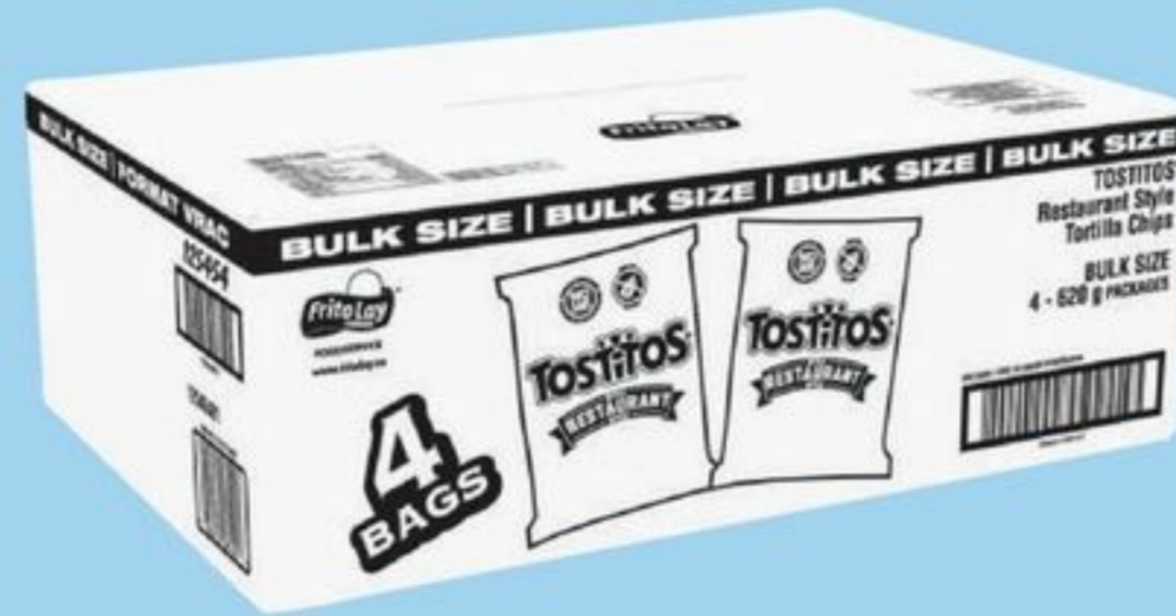
TOSTITOS RESTAURANT STYLE CHIPS 4 X 620 G 21722296_C04