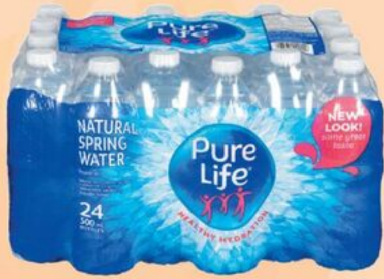
PURE LIFE NATURAL SPRING WATER 24 X 500 ML 20060696_C24