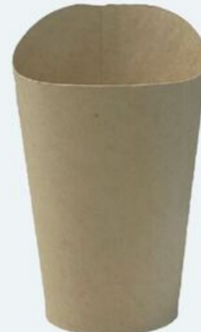
FRY CUPS 12 OZ, 100'S 21597070_EA