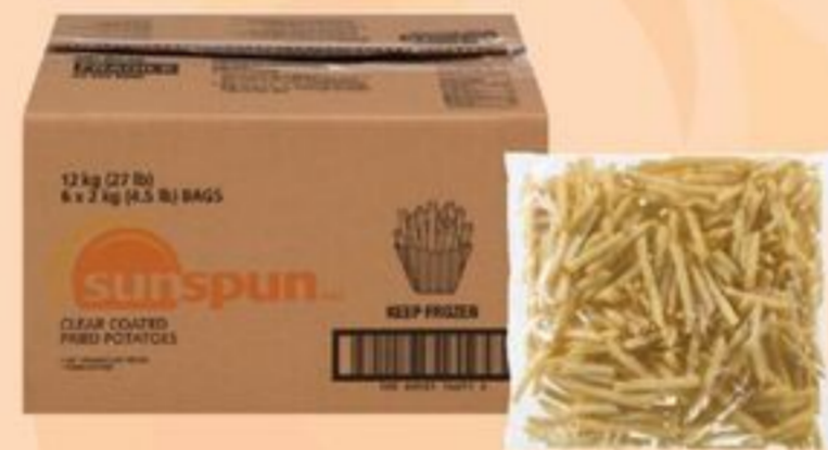
SUNSPUN™ CLEAR COATED FRIES FROZEN, 27 LB 20905111_EA