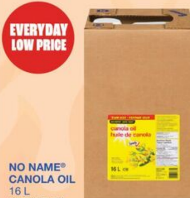
NO NAME® CANOLA OIL 16 L 20153670_EA