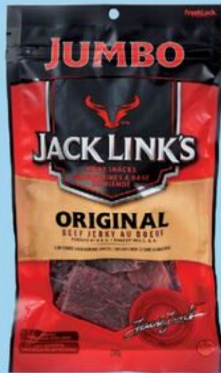
JACK LINKS JUMBO JERKY SELECTED VARIETIES 230 G 21001206_EA/21235491_EA