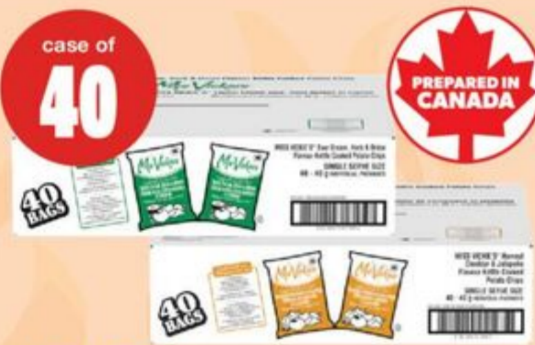
MISS VICKIE'S KETTLE COOKED POTATO CHIPS SELECTED VARIETIES, 40'S 21588060_C40/21677298_C40