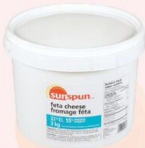
SUNSPUN™ FETA CHEESE 22% M.F., 3 KG 21279915_EA