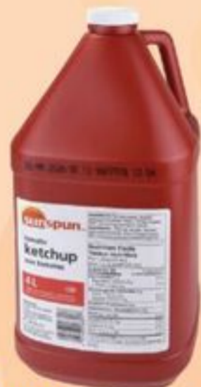
SUNSPUN™ KETCHUP PUMP 4 L 21202857_EA