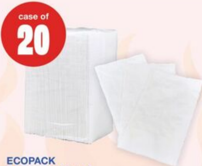
ECOPACK DINNER NAPKINS WHITE, 15 X 17" 20 SLEEVES X 150'S 21734370_C20