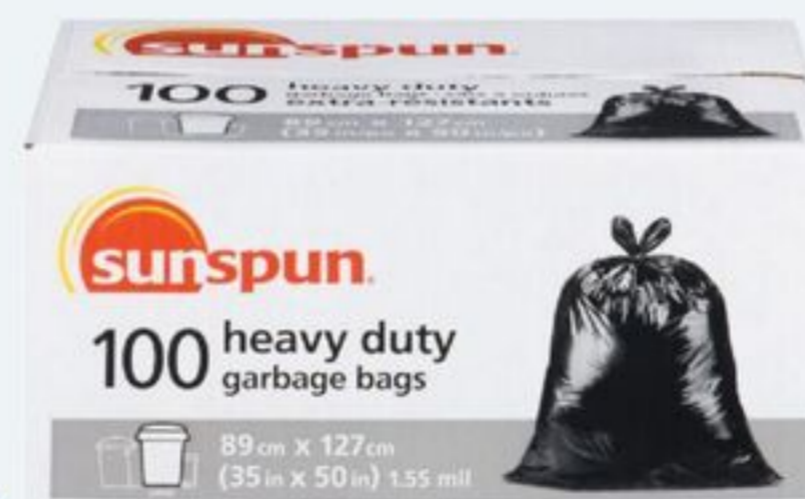
SUNSPUN™ HEAVY DUTY GARBAGE BAGS 35" X 50", 100'S 20027009_EA