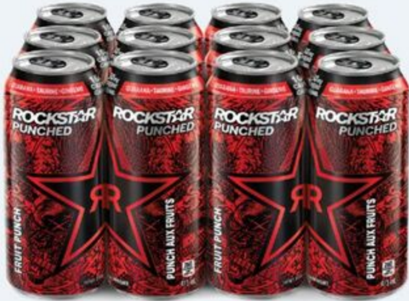
ROCKSTAR ENERGY DRINKS SELECTED VARIETIES 12 X 473 ML 20368415003_C12