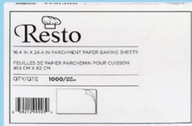
PARCHMENT PAPER SHEETS 16.4" X 24.4" 1000'S 21566297_C01