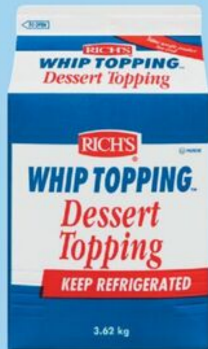
RICH'S WHIP TOPPING DESSERT TOPPING 3.62 KG 20024546_EA