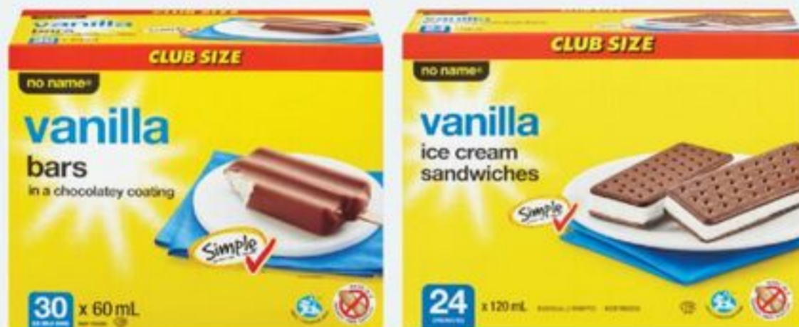
NO NAME® ICE CREAM BARS OR SANDWICHES CLUB SIZE, 24-30'S SELECTED VARIETIES, FROZEN 20347400001_EA/21013432_EA