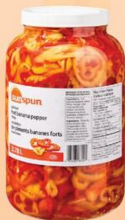
SUNSPUN™ HOT BANANA PEPPERS 3.78 L 21291232_EA