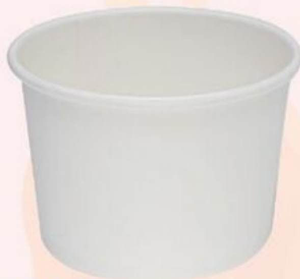
ECO-PACK COLD WHITE PAPER BOWL 8 OZ, 50'S 21468591_EA