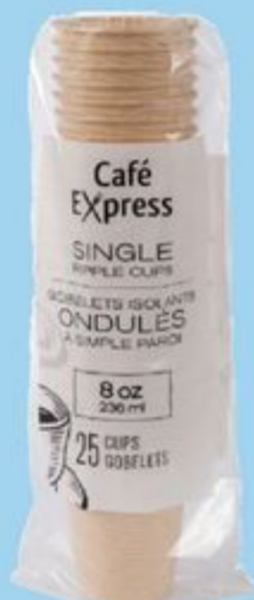
CAFÉ EXPRESS WAVE CUPS SELECTED VARIETIES 8 OZ, 25'S 21564767_EA