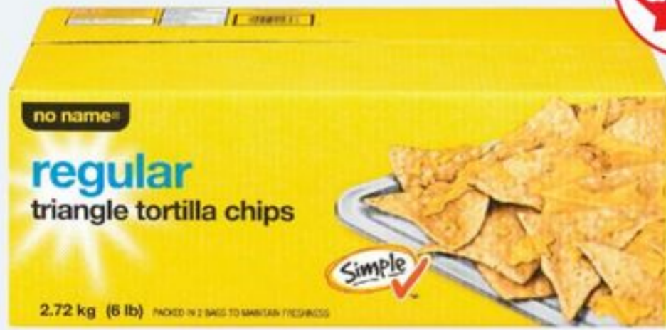
NO NAME® TORTILLA CHIPS 2.72 KG 21124423_EA