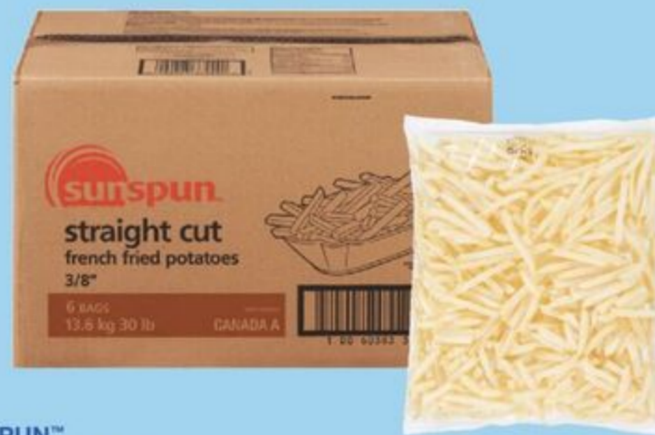
SUNSPUN™ STRAIGHT CUT 3/8 FRENCH FRIES FROZEN, 13.6 KG 20313990001_EA