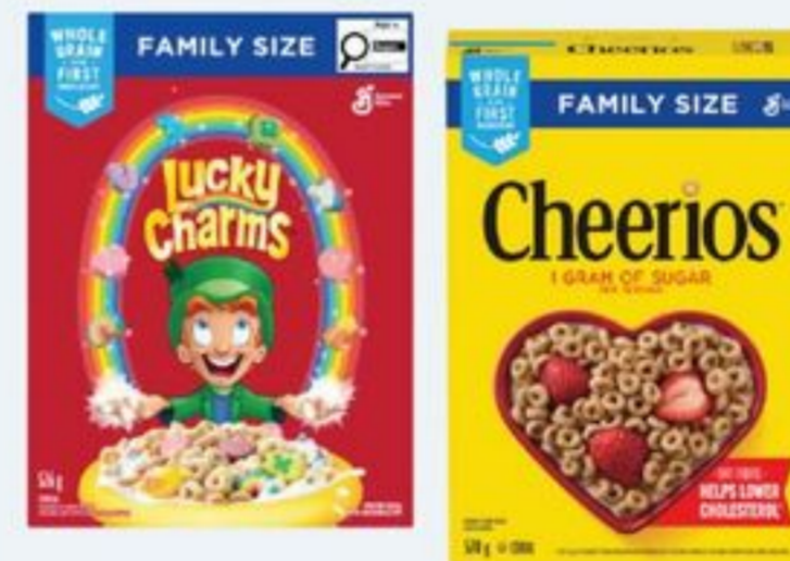
GENERAL MILLS FAMILY SIZE CEREAL SELECTED VARIETIES 455-725 G 21103499_EA/21103505_EA