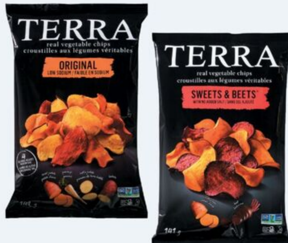
TERRA CHIPS SELECTED VARIETIES 141-170 G 21557876_EA/21557962_EA