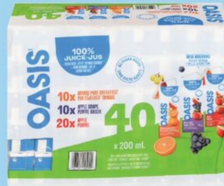
OASIS ASSORTED JUICE BOXES 40 X 200 ML 21030520_C01