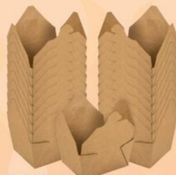
CAFÉ EXPRESS KRAFT PE BOX #1 EACH, 50'S 21423733_EA