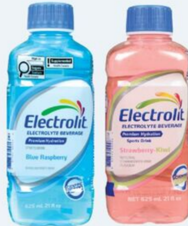
ELECTROLIT DRINKS SELECTED VARIETIES 475 ML 21596096_EA