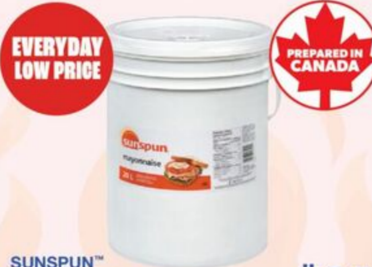
SUNSPUN™ MAYONNAISE 20 L 21123869_EA