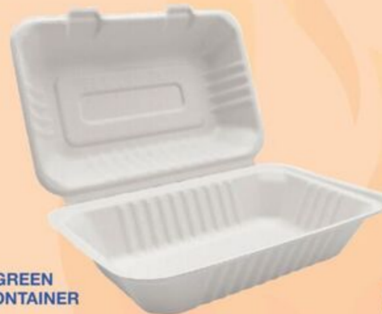
EMBRACEGREEN HINGED CONTAINER 9" X 6" X 3" 21672029_EA