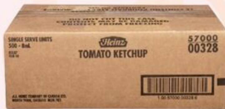
HEINZ KETCHUP PORTIONS 500'S 20000699_EA