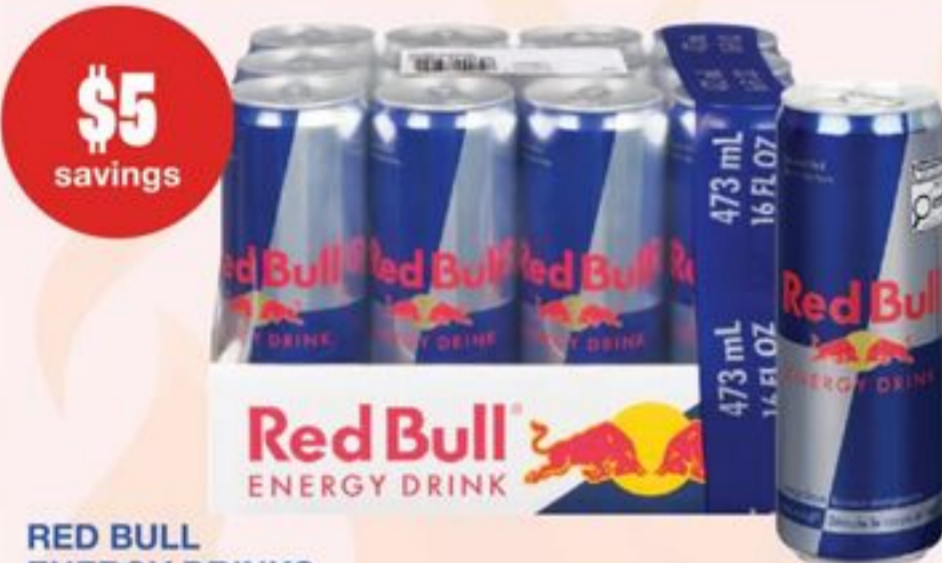
RED BULL ENERGY DRINKS SELECTED VARIETIES 12 X 473 ML 20370365001_C12