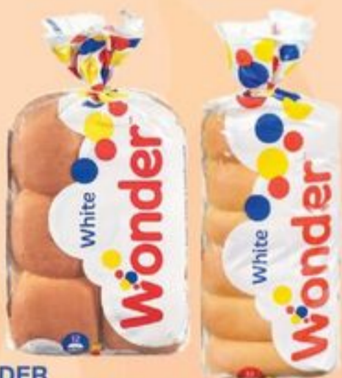
WONDER HOT DOG OR HAMBURGER ROLLS SELECTED VARIETIES, 12'S 20520827_EA/20520828_EA