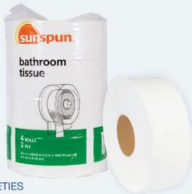
SUNSPUN™ BATH TISSUE SELECTED VARIETIES 1-4'S 21667510_EA