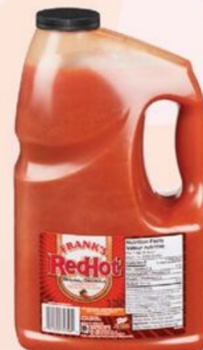
FRANK'S REDHOT SAUCE ORIGINAL 3.78 L 20130877_EA