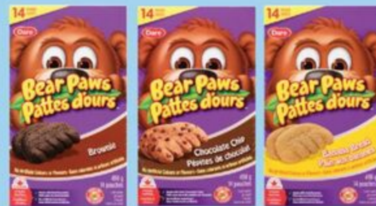
DARE BEAR PAWS SELECTED VARIETIES 392-490 G 21713488_EA/21713602_EA