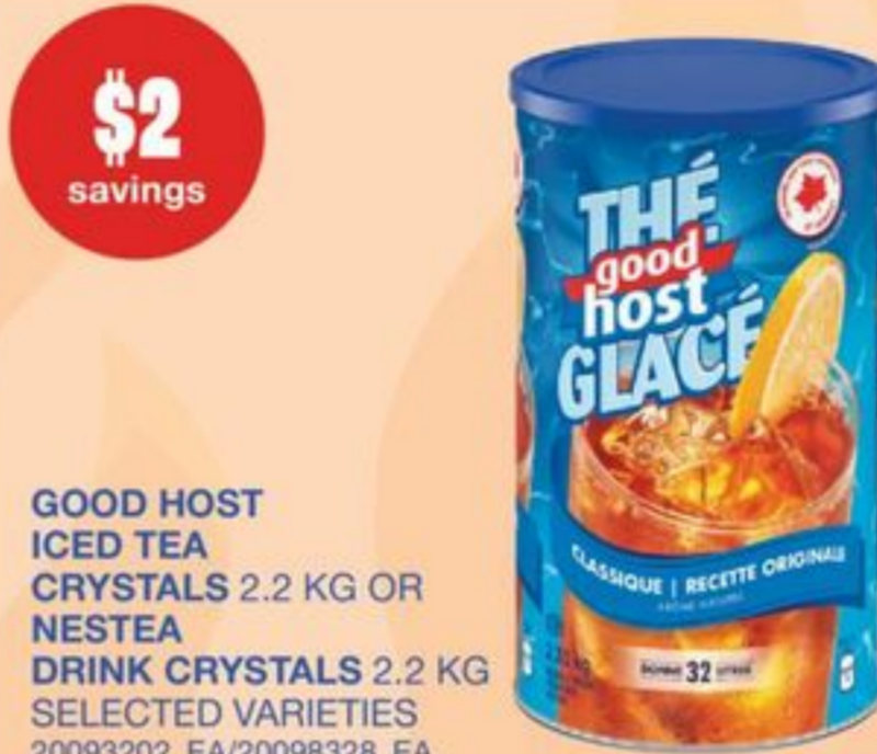
GOOD HOST ICED TEA CRYSTALS 2.2 KG OR NESTEA DRINK CRYSTALS 2.2 KG SELECTED VARIETIES 20093202_EA/20098328_EA