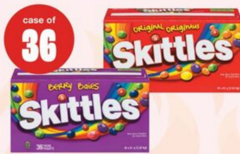
SKITTLES OR STARBUST CANDIES SELECTED VARIETIES 36'S 20686198001_C36/20707917_C36