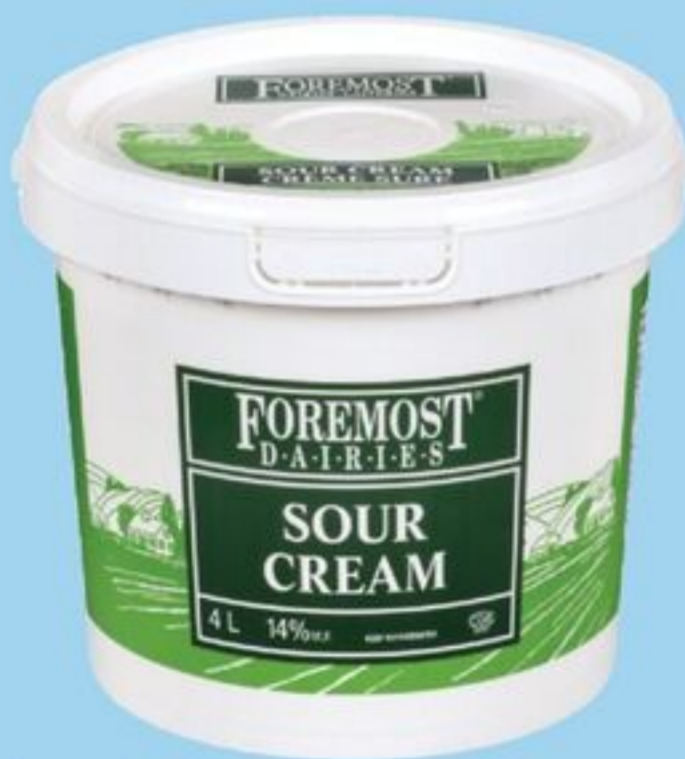
FOREMOST DAIRIES SOUR CREAM 14% M.F., 4 L 20068658_EA