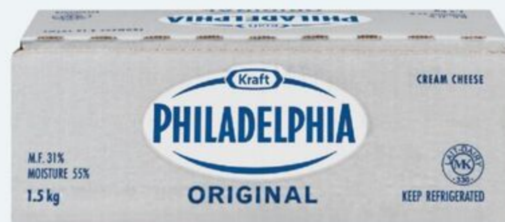
PHILADELPHIA CREAM CHEESE 1.5 KG 20017153002_EA