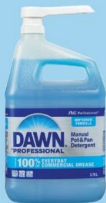
DAWN PROFESSIONAL DISH SOAP WITH PUMP 3.78 L 21609218_EA