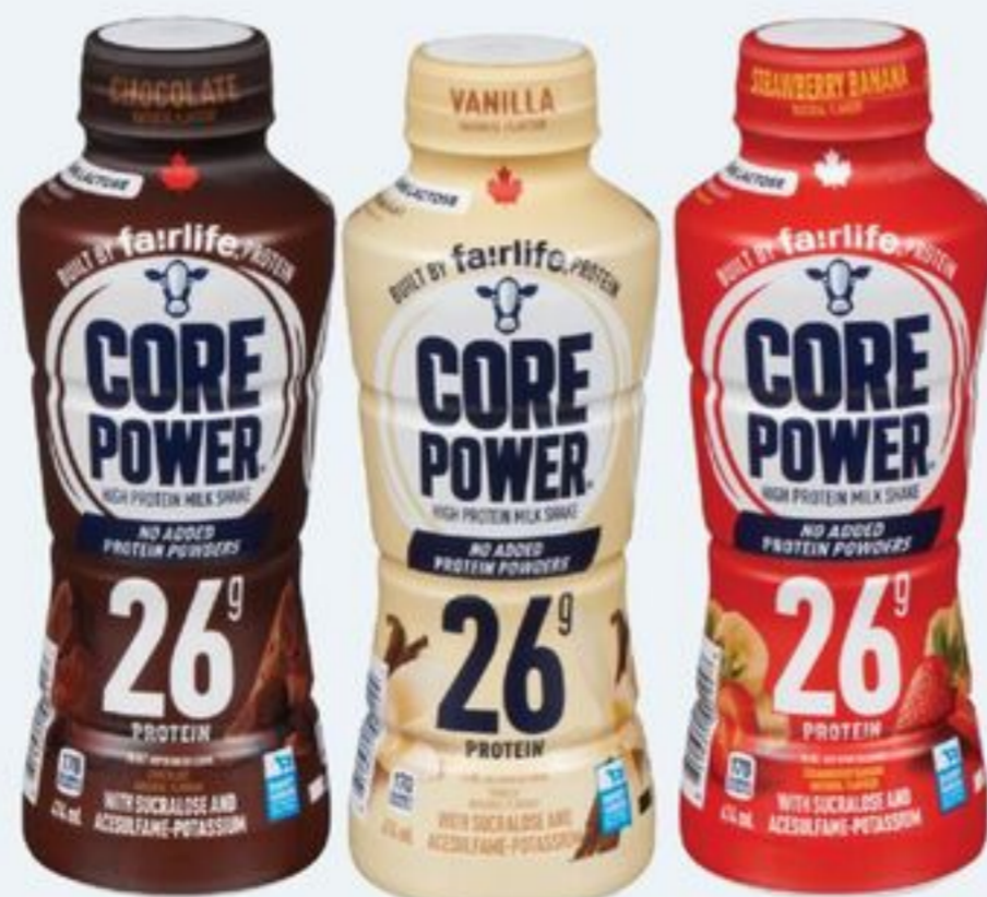
CORE POWER PROTEIN DRINK SELECTED VARIETIES 414 ML 21731701_EA