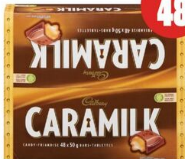
CARAMILK SINGLE BARS 48'S 20691851_C48