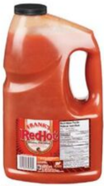
FRANK'S ORIGINAL RED HOT SAUCE 3.78 L 20130877_EA