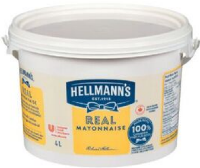
HELLMANN'S MAYONNAISE 4 L 20021711_EA