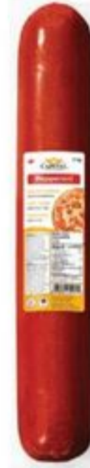
CAPITAL FINE MEATS PEPPERONI 3 KG 20000823_EA