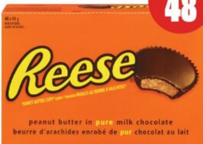
REESE'S PEANUT BUTTER CUPS SINGLE BARS 48'S 20582012_C48