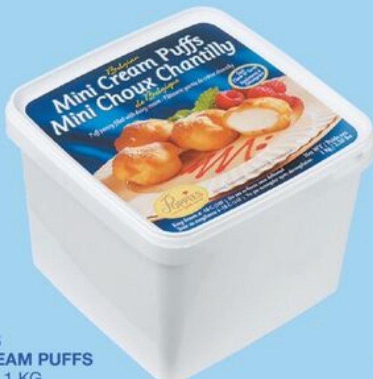
POPPIES MINI CREAM PUFFS FROZEN, 1 KG 20501307_EA