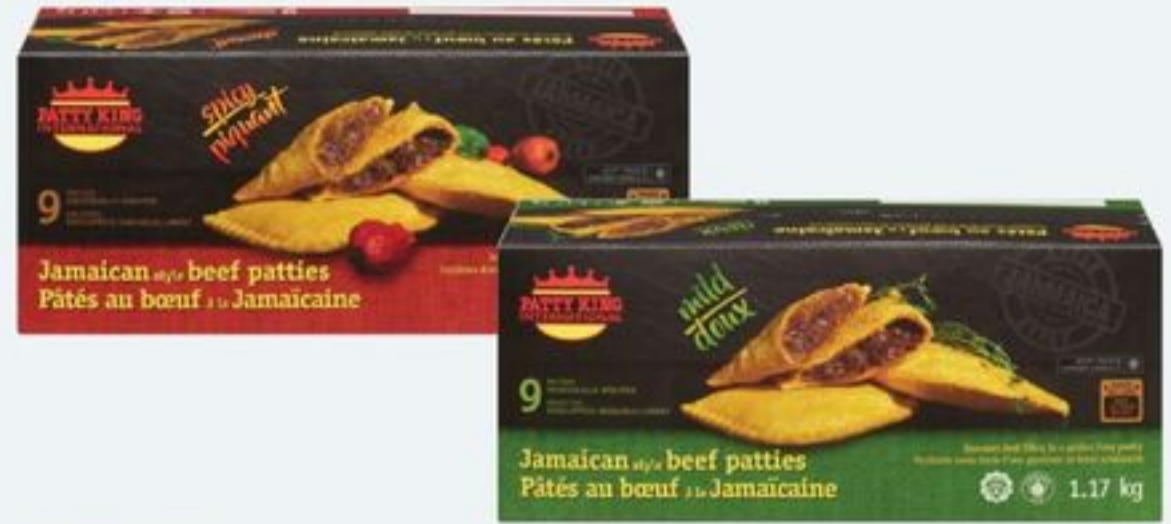
PATTY KING JAMAICAN STYLE BEEF PATTIES HOT OR MILD FROZEN, 1.17 KG 20313668001_EA 20313668002_EA