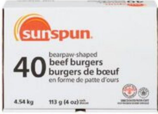
SUNSPUN™ BEEF BURGERS 4.54 KG 40 X 4 OZ. FROZEN 20150627_EA