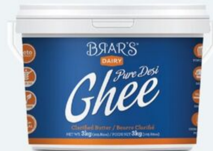
BRAR'S DESI GHEE 3 KG 21520900_EA