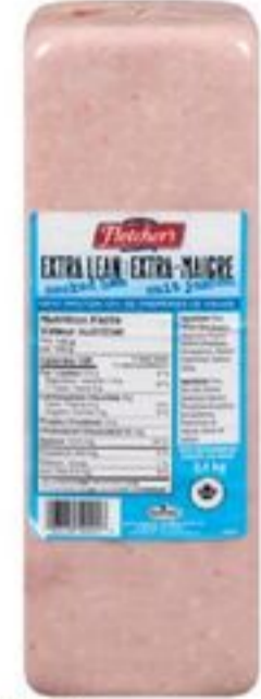
FLETCHER'S COOKED HAM EXTRA LEAN 3.4 KG 21418300_EA