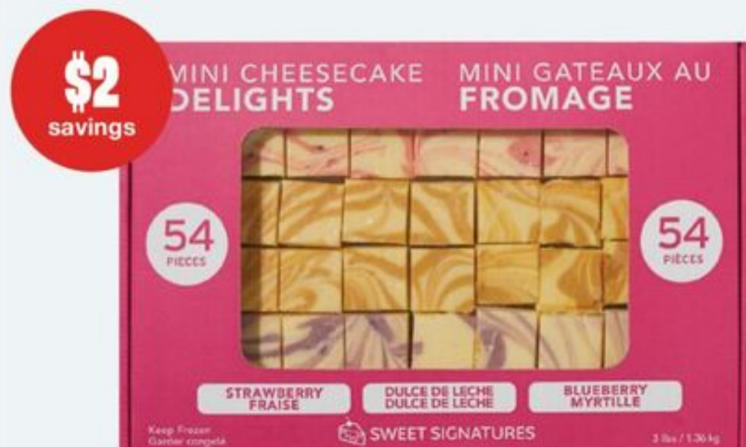
SWEET SIGNATURES MINI CHEESECAKE DELIGHTS 1.36 KG, FROZEN 21616523_EA