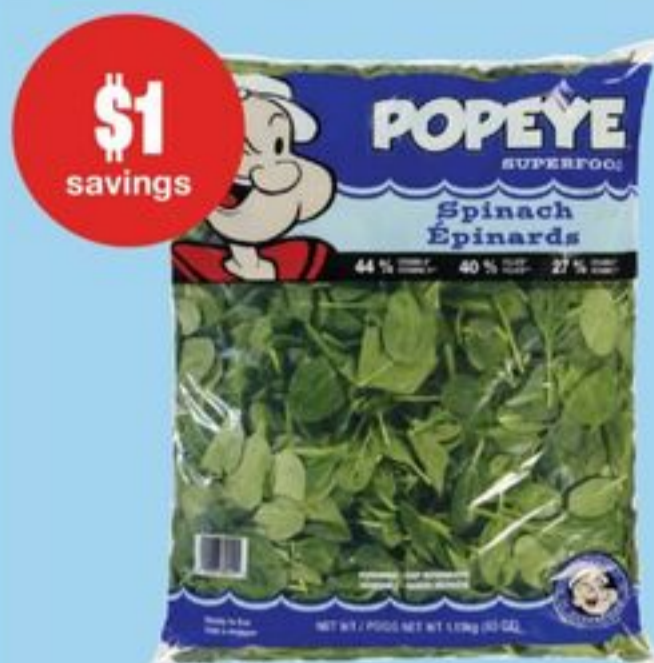
POPEYE SPINACH PRODUCT OF U.S.A. SELECTED VARIETIES 1.13 KG 20104062_EA