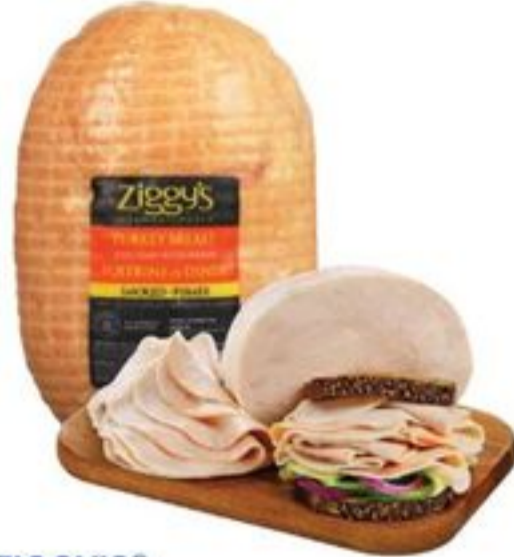
ZIGGY'S® SMOKED TURKEY BREAST EXTRA LEAN WHOLE PIECE VARIABLE WEIGHT 20324673_KG