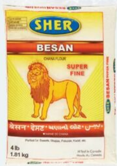
SHER BESAN CHANA FLOUR 1.81 KG 20869922_EA