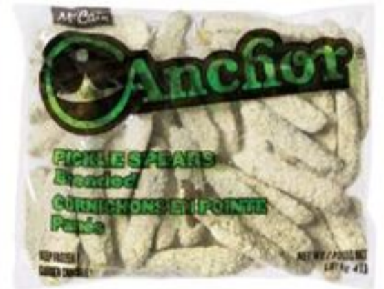
MCCAIN BATTERED PICKLES 1.81 KG 20993519_EA