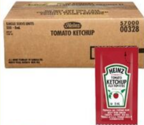
HEINZ KETCHUP PORTIONS 500'S 20000699_EA