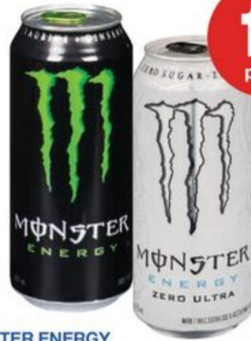
MONSTER ENERGY ORIGINAL OR ZERO ULTRA 12 X 473 ML 20938249_C12/20938521_C12