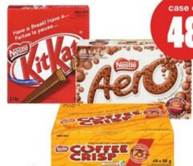
NESTLÉ COFFEE CRISP, KIT KAT OR AERO MILK CHOCOLATE SINGLE BARS 48'S 20019964_C48 20066954_C48 20306258_C48