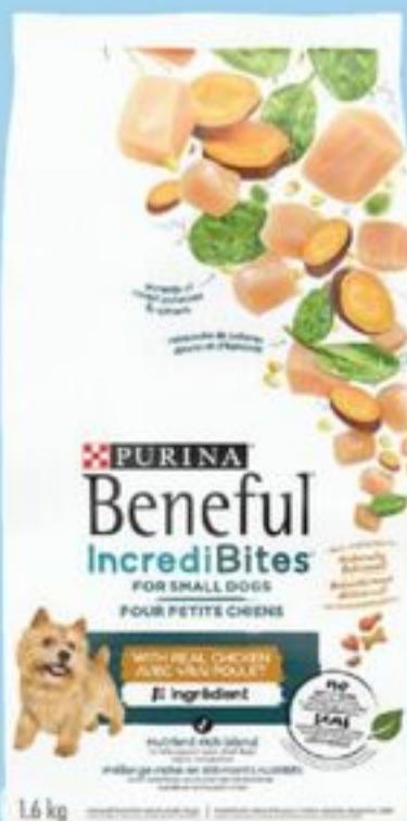
PURINA BENEFUL DRY DOG FOOD SELECTED VARIETIES 1.6 KG 20849862_EA