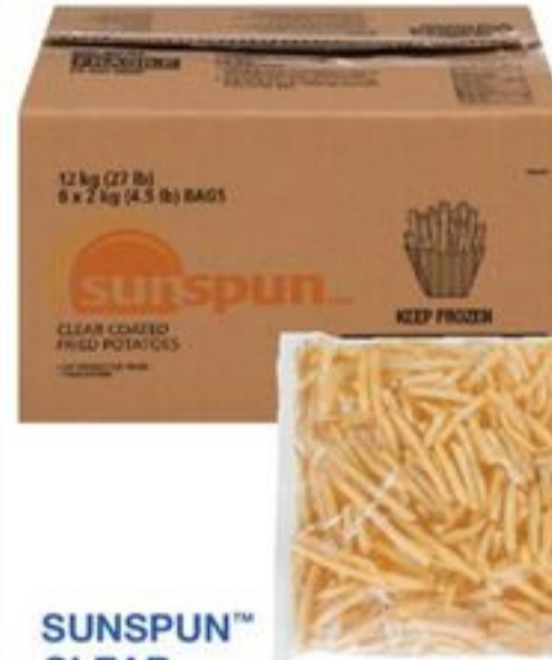
SUNSPUN™ CLEAR COATED FRIED POTATOES 12 KG 6 X 2 KG 20905111_EA