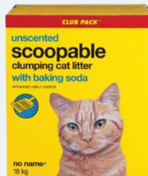
NO NAME® CAT LITTER SELECTED VARIETIES CLUB PACK®, 18 KG 20177169001_EA/20177169002_EA