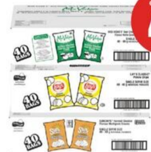
MISS VICKIE'S, LAY'S CLASSIC OR SUNCHIPS HARVEST CHEDDAR CHIPS 40 G X 40'S 21588060_C40 20067191001_EA 20076447001_EA