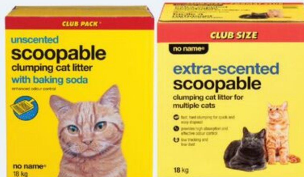
NO NAME® CAT LITTER SELECTED VARIETIES CLUB PACK®, 18 KG 20177169001_EA/20177169002_EA