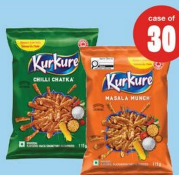
KURKURE FLAVOURED SNACKS SELECTED VARIETIES 30 X 115 G 20659742_C30/21361077_C30