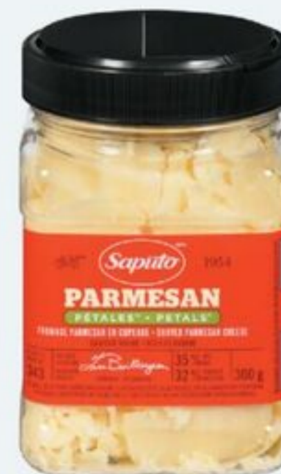
SAPUTO PARMESAN PETALS 300 G 20600090_EA