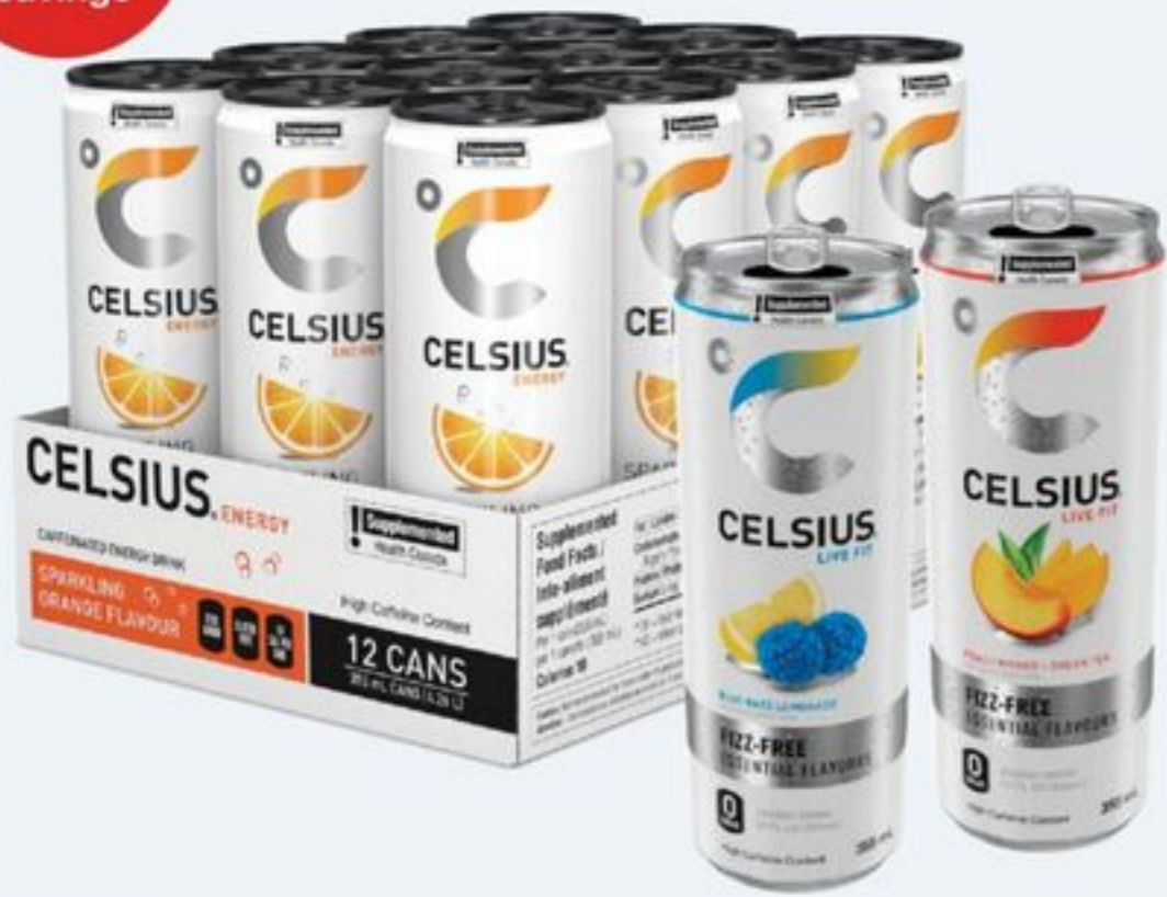
CELSIUS ENERGY DRINKS SELECTED VARIETIES 12 X 355 ML 21576466_C12