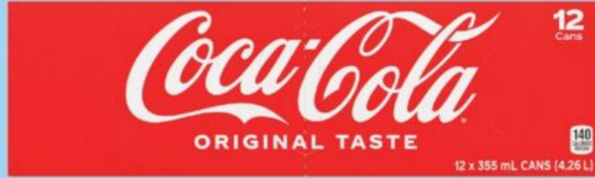
COCA-COLA SOFT DRINKS SELECTED VARIETIES 12 X 355 ML 20318694002_C12