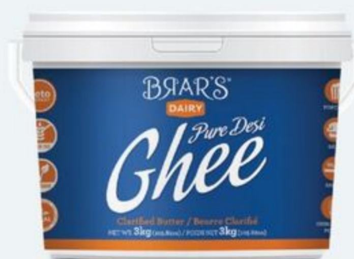
BRAR'S DESI GHEE 3 KG 21520900_EA