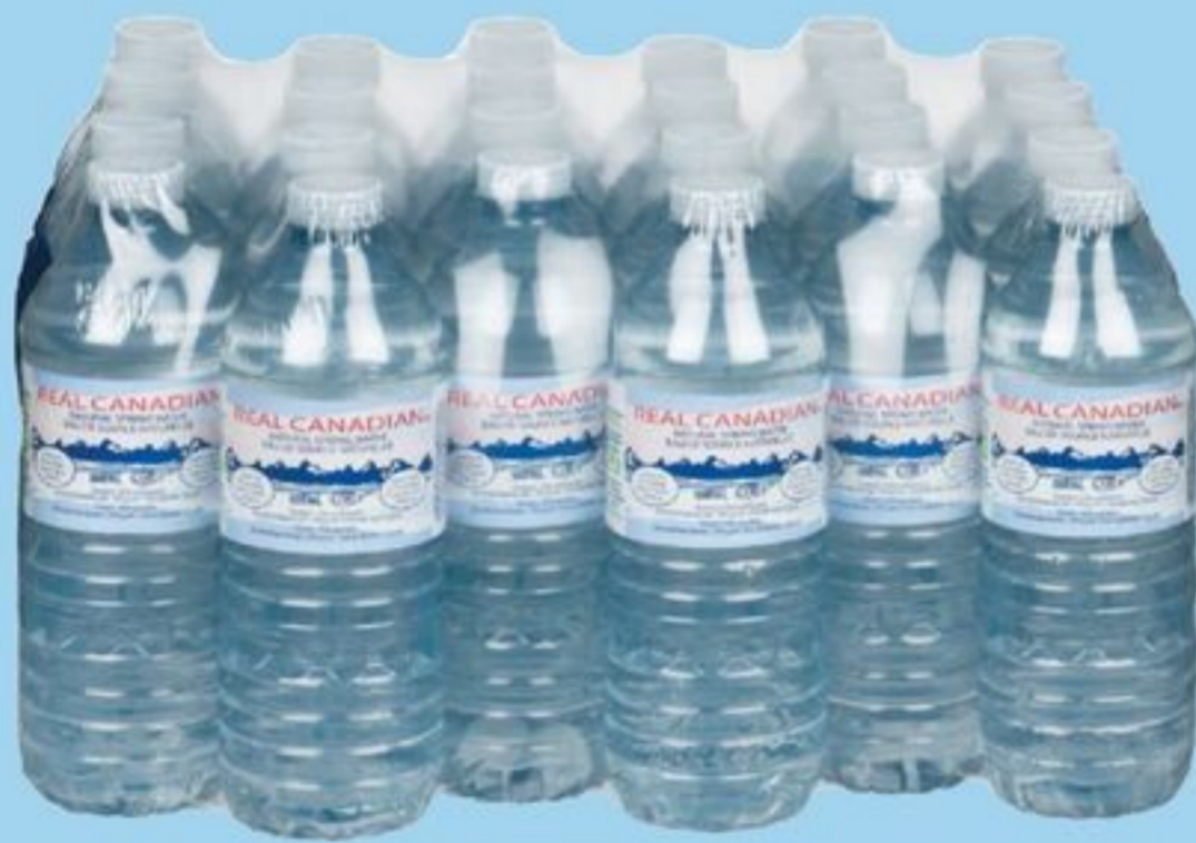
REAL CANADIAN NATURAL SPRING WATER SELECTED VARIETIES 24 X 500 ML 20154975_C24