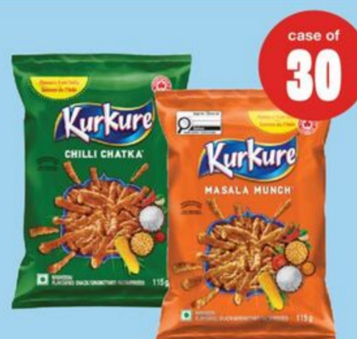
KURKURE FLAVOURED SNACKS SELECTED VARIETIES 30 X 115 G 20659742_C30/21361077_C30