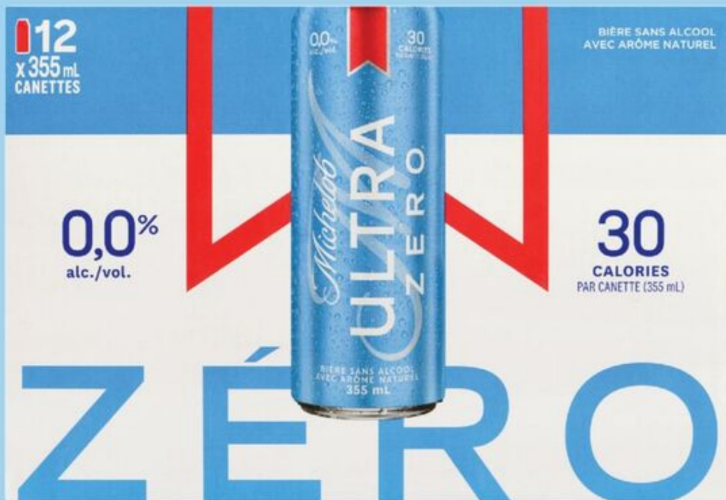
MICHELOB ULTRA ZERO ALCOHOL 12 X 355 ML 21706777_C12