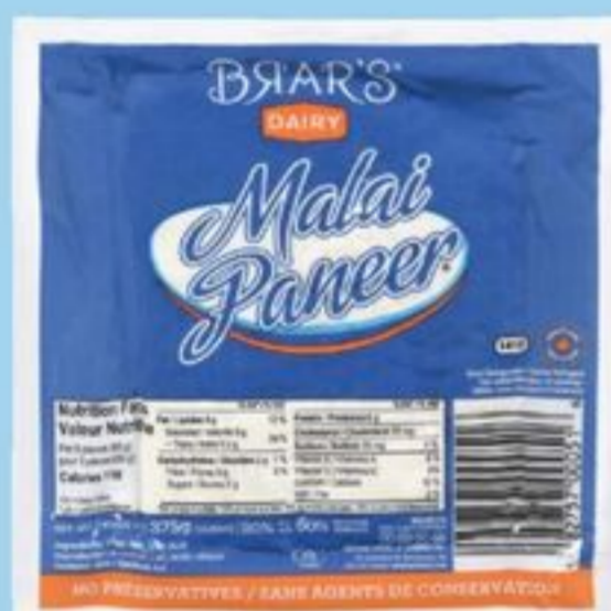
BRAR'S MALAI PANEER 20% M.F., 375 G 20283164_EA