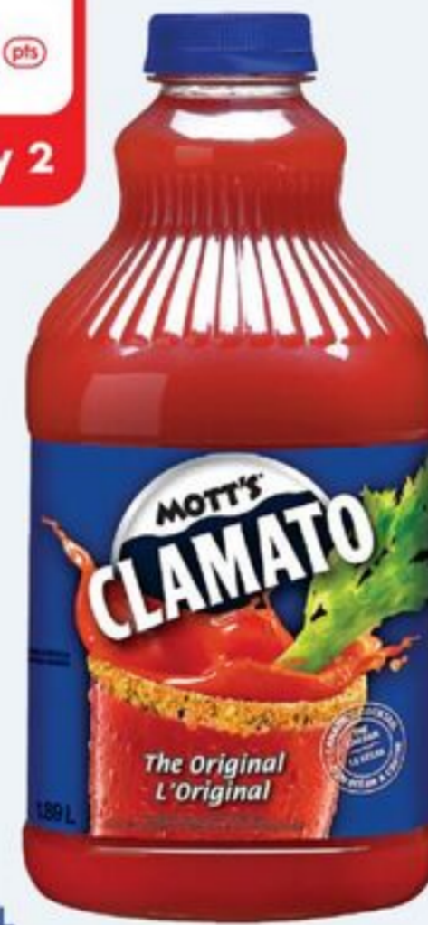
MOTT'S CLAMATO COCKTAIL SELECTED VARIETIES 1.89 L 20318955002_EA