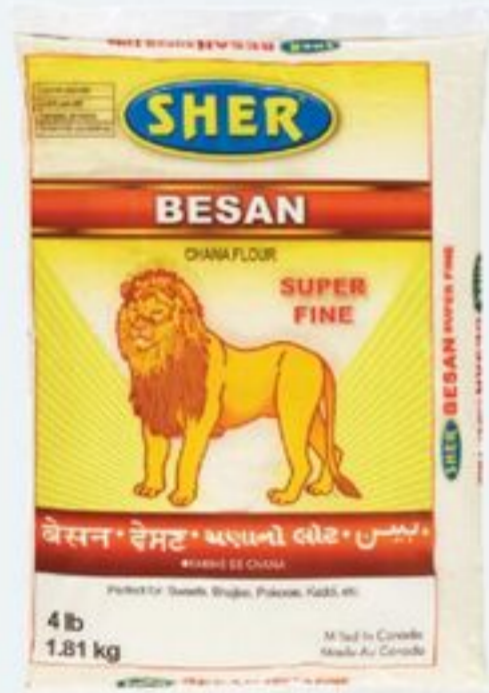
SHER BESAN CHANA FLOUR 1.81 KG 20869922_EA