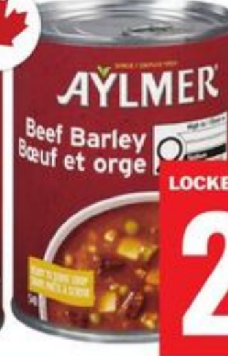
AYLMER READY TO SERVE SOUP 540 ML SELECTED VARIETIES