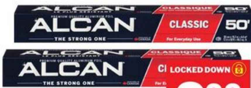
ALCAN ALUMINUM FOIL EACH SELECTED VARIETIES