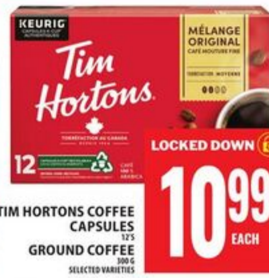
TIM HORTONS COFFEE CAPSULES 12'S GROUND COFFEE 300 G SELECTED VARIETIES