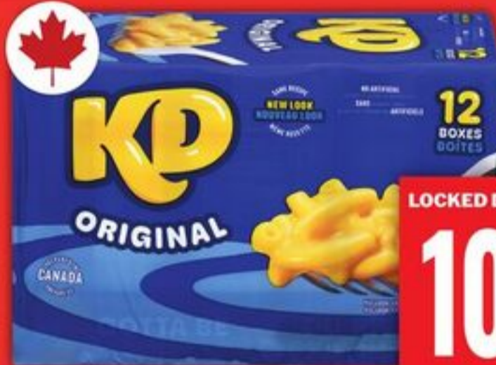
KRAFT DINNER NOODLE MEAL 12 X 200 G