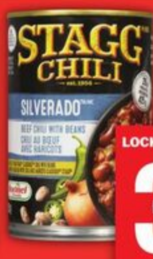
STAGG CHILI 425 ML SELECTED VARIETIES