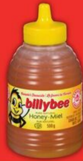
BILLY BEE HONEY 500 G