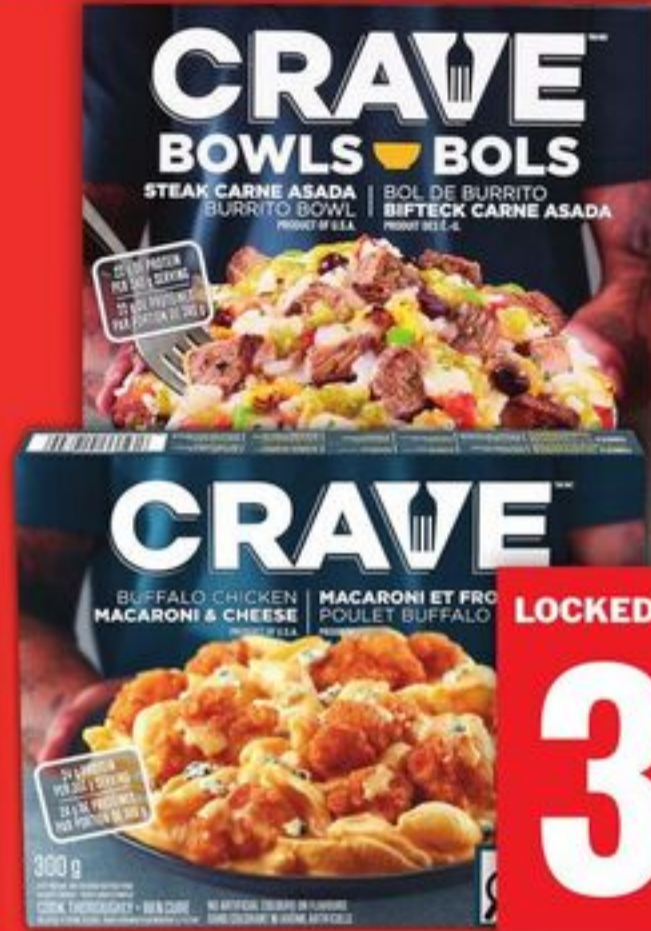
CRAVE DINNER MEALS 200 - 340 G FROZEN SELECTED VARIETIES