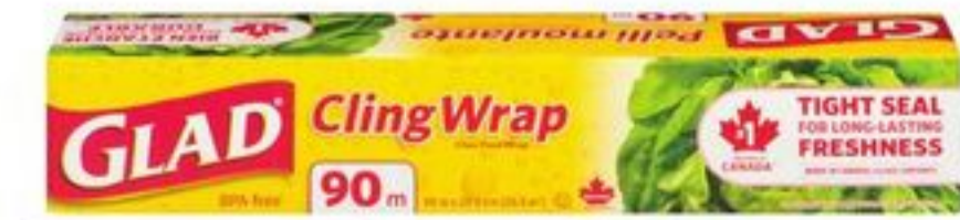
GLAD CLING WRAP 90 M SELECTED VARIETIES