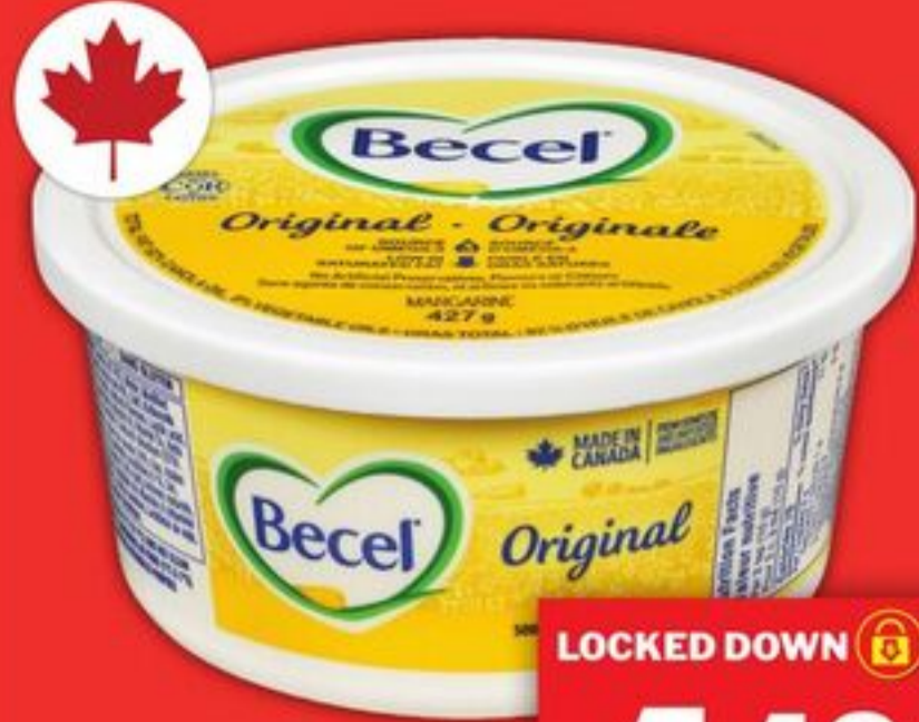
BECEL MARGARINE 427 G SELECTED VARIETIES