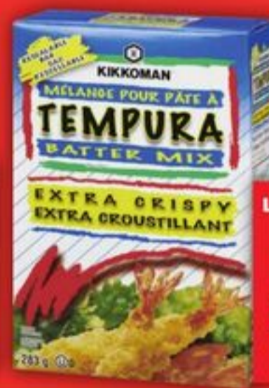
KIKKOMAN SOY OR TERIYAKI SAUCE, TEMPURA MIX 295 - 296 ML 283 G SELECTED VARIETIES