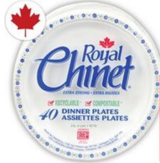
ROYAL CHINET DINNER PLATES 40'S SELECTED VARIETIES