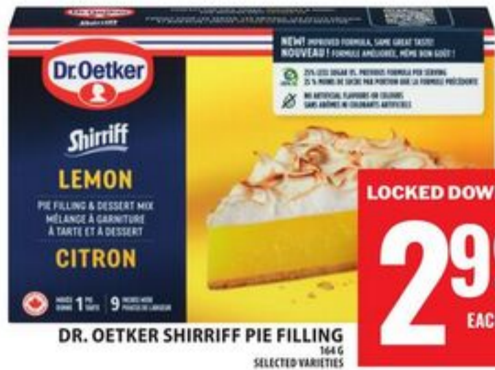
DR. OETKER SHIRRIFF PIE FILLING 164 G SELECTED VARIETIES