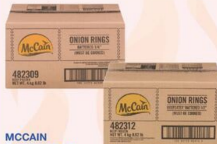
MCCAIN BATTERED OR BEEFEATER ONION RINGS FROZEN, 4 KG 20083180_EA/20779718_EA