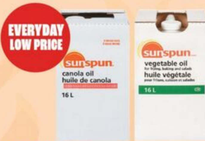
SUNSPUN™ CANOLA OR VEGETABLE OIL SELECTED VARIETIES, 16 L 20024719_EA/20126146_EA