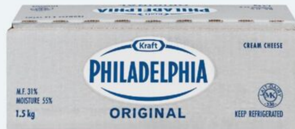
PHILADELPHIA CREAM CHEESE 1.5 KG 20017153002_EA