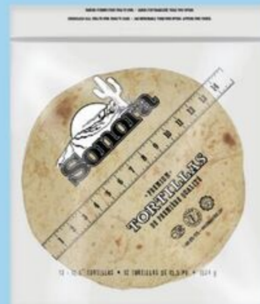
SONORA 13.5" FLOUR TORTILLAS 12'S 21532737_EA