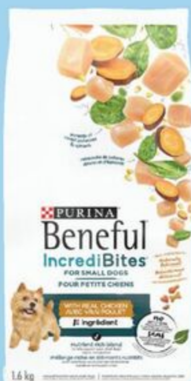
PURINA BENEFUL DRY DOG FOOD SELECTED VARIETIES 1.6 KG 20849862_EA