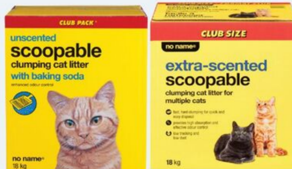
NO NAME® CAT LITTER SELECTED VARIETIES CLUB PACK®, 18 KG 20177169001_EA/20177169002_EA