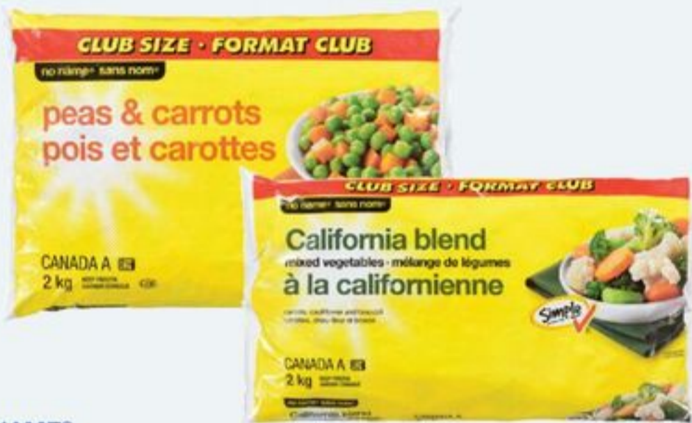
NO NAME® VEGETABLES SELECTED VARIETIES FROZEN, 2 KG 20161396_EA/20185642_EA