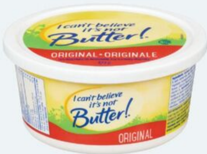
I CAN'T BELIEVE IT'S NOT BUTTER! MARGARINE 427 G 20061949001_EA