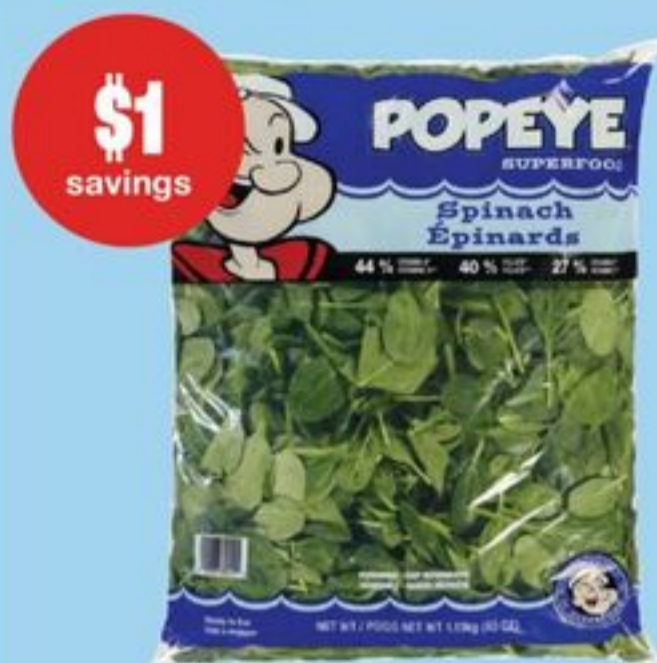
POPEYE SPINACH PRODUCT OF U.S.A. SELECTED VARIETIES 1.13 KG 20104062_EA