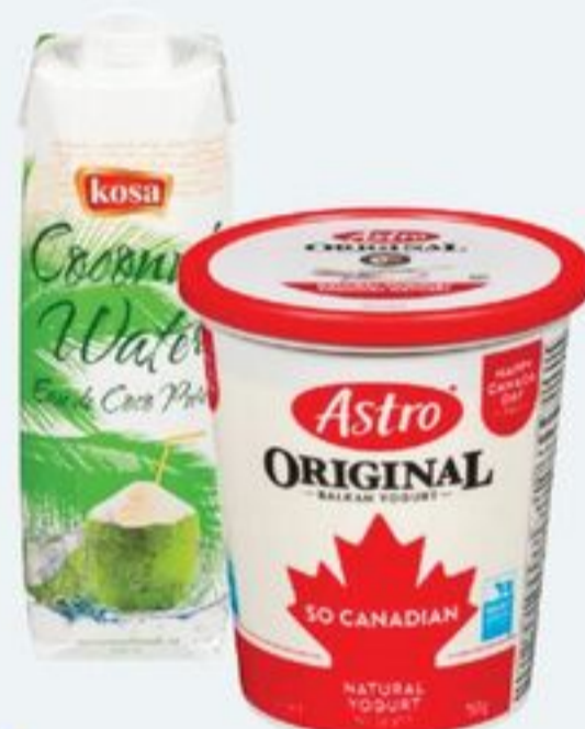
ASTRO YOGURT TUBS 750 G OR KOSA COCONUT WATER 1 L SELECTED VARIETIES 20165226001_EA/20165226001_EA 21176899_EA