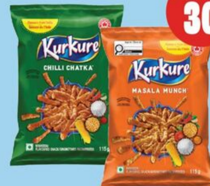
KURKURE FLAVOURED SNACKS SELECTED VARIETIES 30 X 115 G 20659742_C30/21361077_C30