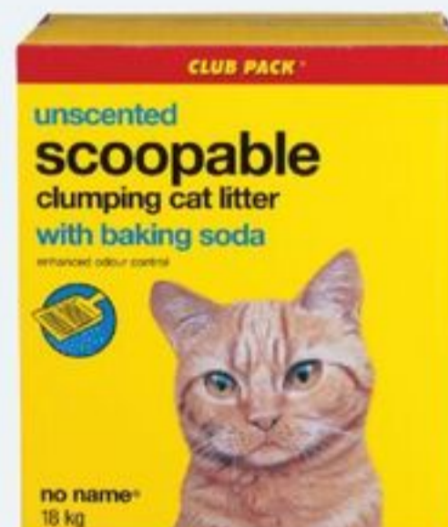
NO NAME® CAT LITTER SELECTED VARIETIES CLUB PACK®, 18 KG 20177169001_EA/20177169002_EA