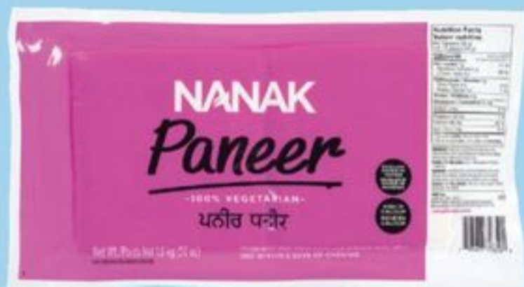
NANAK PANEER 1.6 KG 21167336_EA