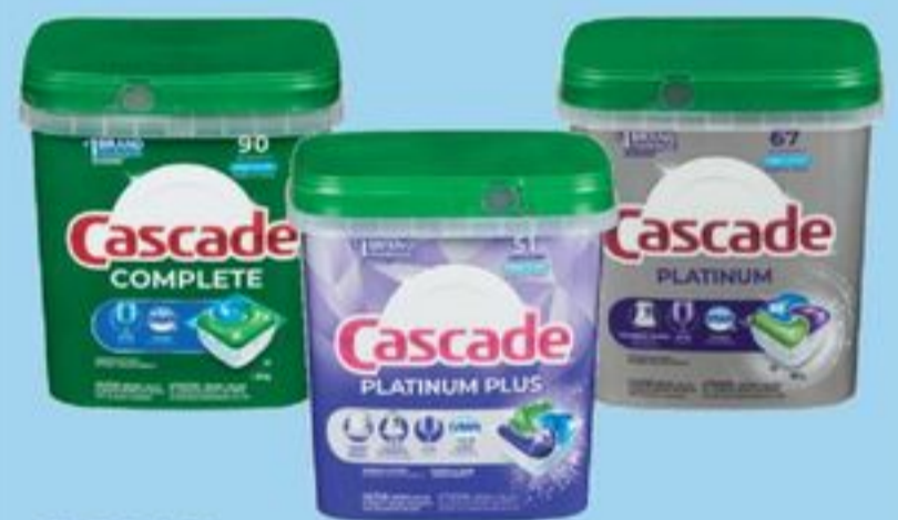
CASCADE PLATINUM DISHWASHER DETERGENT SELECTED VARIETIES 51'S-90'S 21012172_EA/21516545_EA 21518479_EA