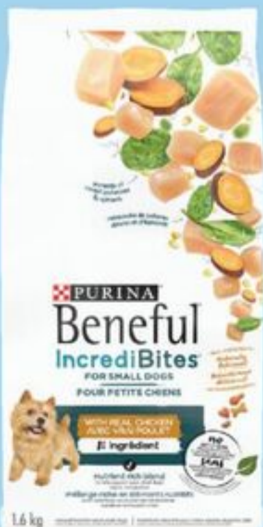
PURINA BENEFUL DRY DOG FOOD SELECTED VARIETIES 1.6 KG 20849862_EA