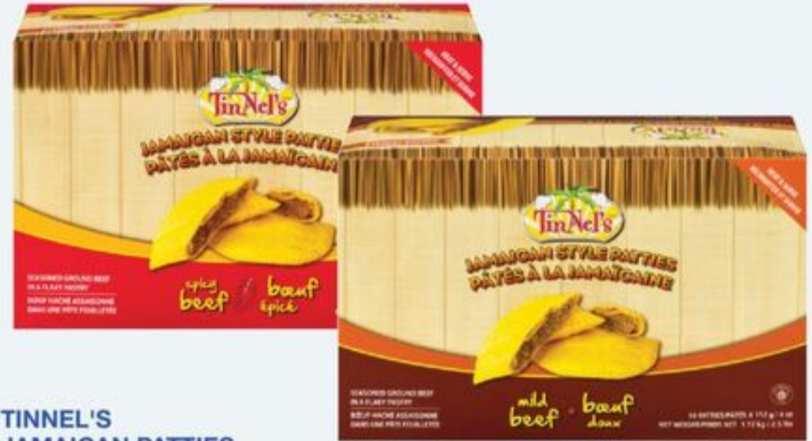
TINNEL'S JAMAICAN PATTIES SELECTED VARIETIES FROZEN, 1.12 KG 20562244001_EA 20562244002_EA