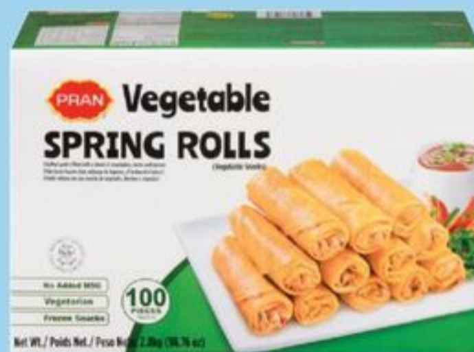
PRAN SPRING ROLLS 2.8 KG 21615971_EA