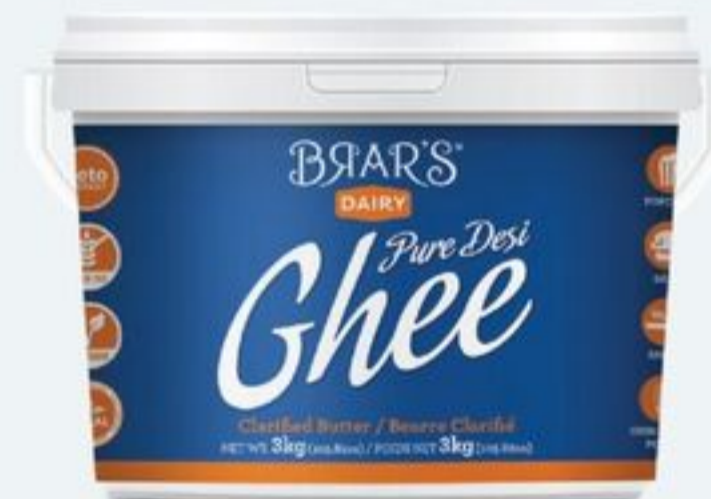
BRAR'S DESI GHEE 3 KG 21520900_EA