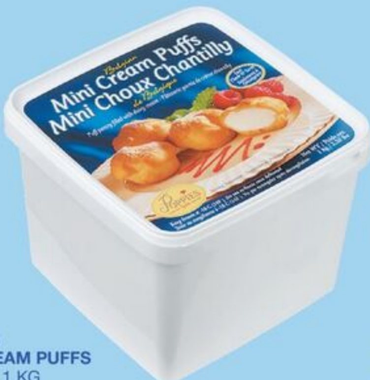
POPPIES MINI CREAM PUFFS FROZEN, 1 KG 20501307_EA