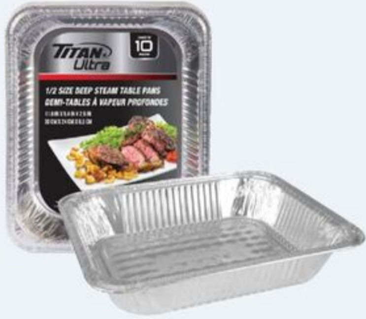
FULL SIZE DEEP TABLE PAN 5'S OR TITAN HALF STEAM DEEP PAN 10'S 11.8" X 9.4" X 2.5" 21667077_EA