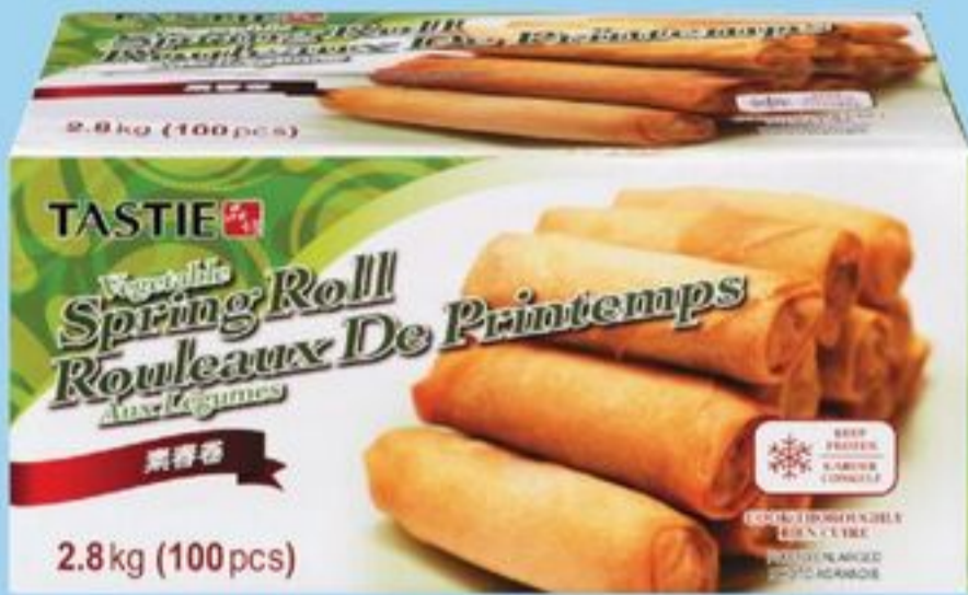
TASTIE VEGETABLE SPRING ROLLS FROZEN, 100'S 21207713_EA