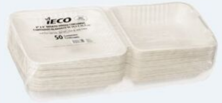
IECO BAGASSE CONTAINERS 50'S 21520500_EA