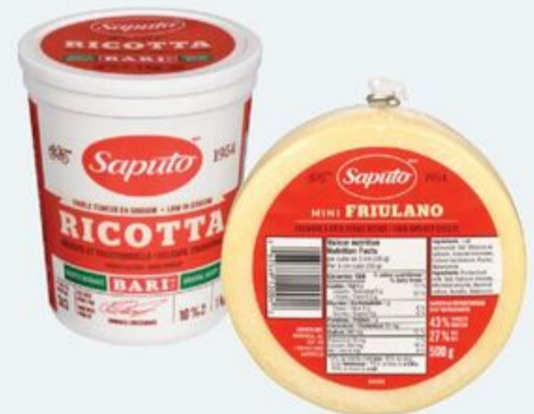
BARI RICOTTA 1 KG OR SAPUTO MINI FRIULANO CHEESE 500 G 20136427_EA/20708981_EA