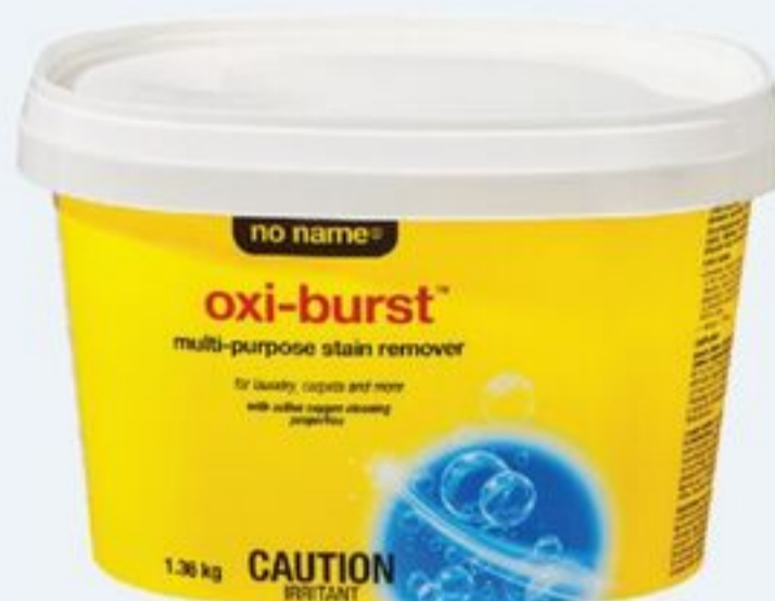
NO NAME® OXI-BURST STAIN REMOVER 1.36 KG 21358883_EA