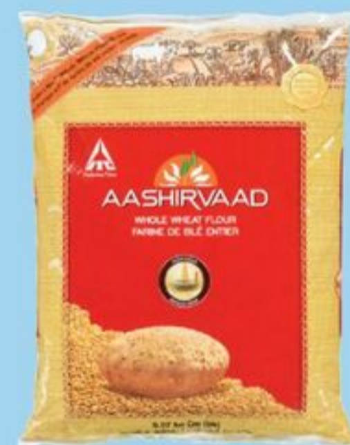
AASHIRVAAD WHOLE WHEAT FLOUR 9.07 KG 21359688_EA