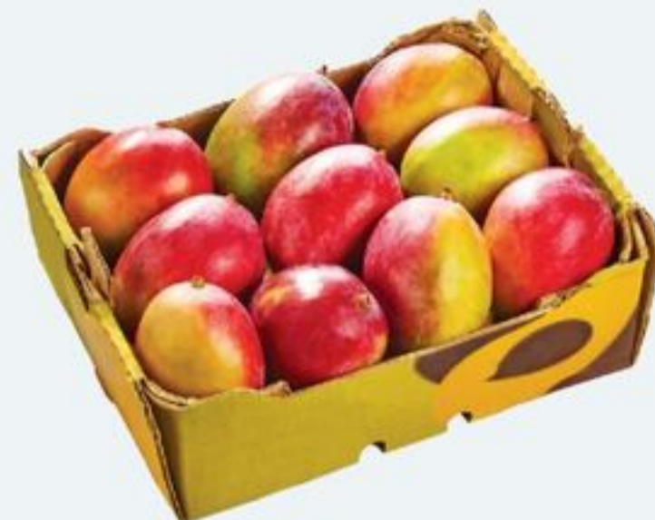
RED MANGOS PRODUCT OF U.S.A. 3.75 KG 21047849_C01