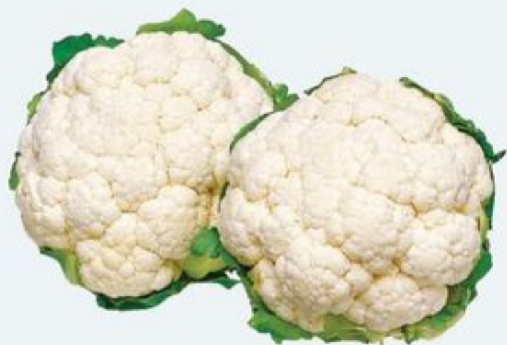
CAULIFLOWER PRODUCT OF U.S.A. EACH 20135377001_EA