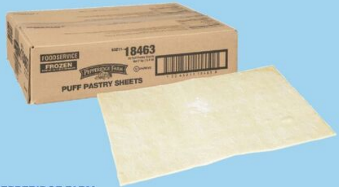
PEPPERIDGE FARM PUFF PASTRY SHEETS FROZEN, 20 X 311 G 20089133_EA