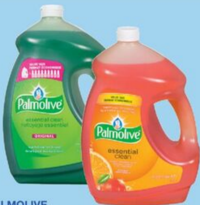
PALMOLIVE DISHWASHING LIQUID SELECTED VARIETIES 4.27 L 21516689_EA/21516691_EA