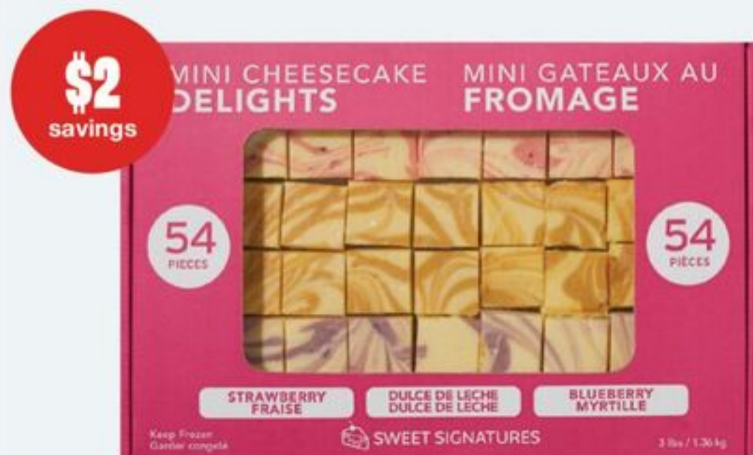
SWEET SIGNATURES MINI CHEESECAKE DELIGHTS 1.36 KG, FROZEN 21616523_EA