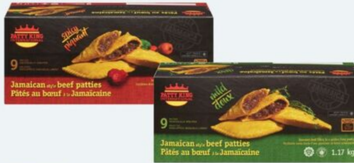
PATTY KING JAMAICAN STYLE BEEF PATTIES HOT OR MILD FROZEN, 1.17 KG 20313668001_EA 20313668002_EA