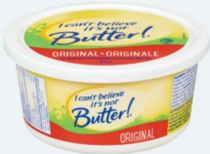
I CAN'T BELIEVE IT'S NOT BUTTER! MARGARINE 427 G 20061949001_EA