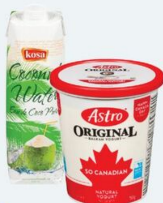
ASTRO YOGURT TUBS 750 G OR KOSA COCONUT WATER 1 L SELECTED VARIETIES 20165226001_EA/20165226001_EA 21176899_EA