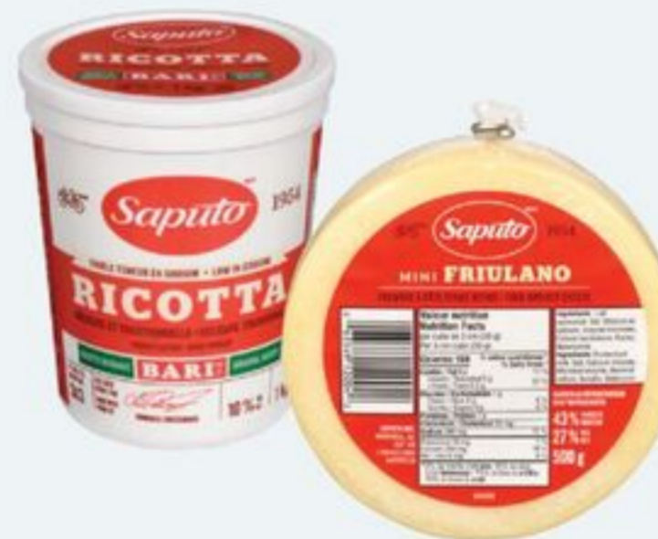
BARI RICOTTA 1 KG OR SAPUTO MINI FRIULANO CHEESE 500 G 20136427_EA/20708981_EA