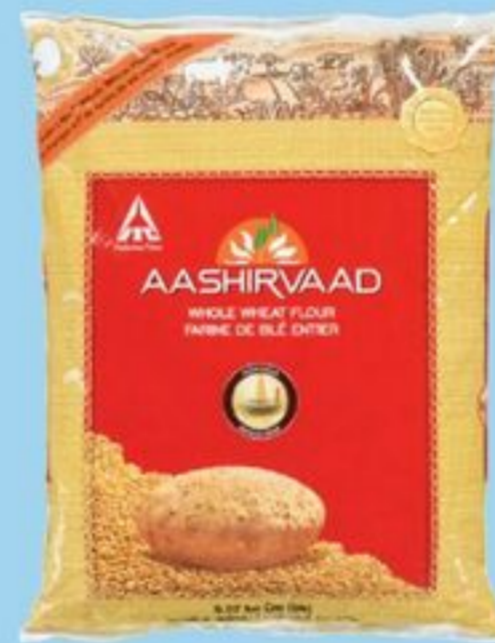
AASHIRVAAD WHOLE WHEAT FLOUR 9.07 KG 21359688_EA