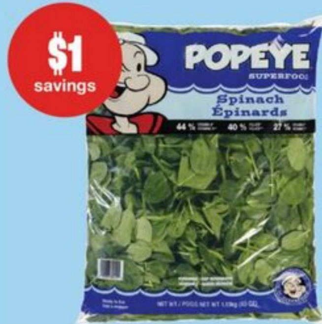
POPEYE SPINACH PRODUCT OF U.S.A. SELECTED VARIETIES 1.13 KG 20104062_EA