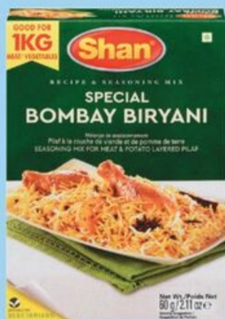
SHAN SPICE MIXES SELECTED VARIETIES 50-65 G 20323215002_EA