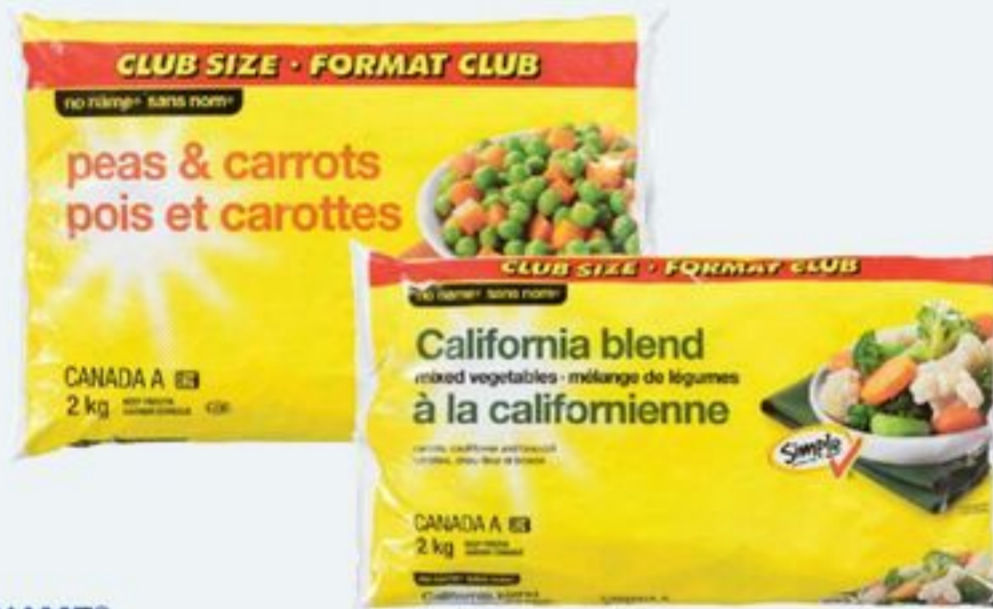
NO NAME® VEGETABLES SELECTED VARIETIES FROZEN, 2 KG 20161396_EA/20185642_EA