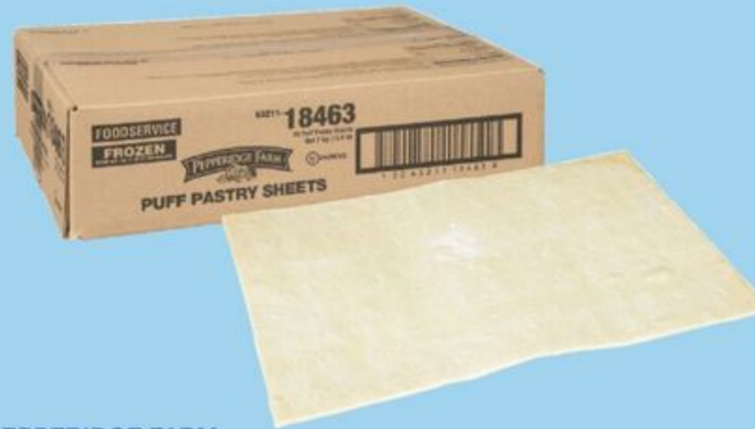
PEPPERIDGE FARM PUFF PASTRY SHEETS FROZEN, 20 X 311 G 20089133_EA