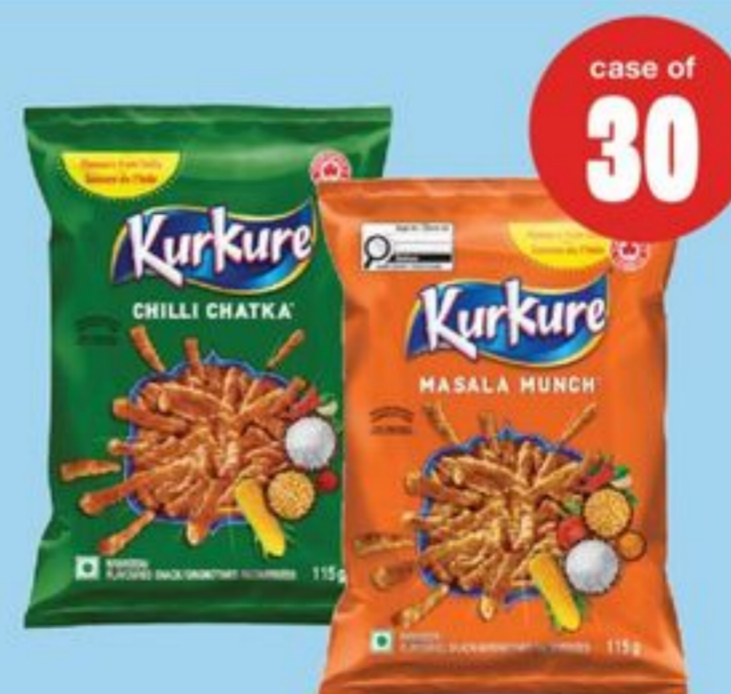
KURKURE FLAVOURED SNACKS SELECTED VARIETIES 30 X 115 G 20659742_C30/21361077_C30