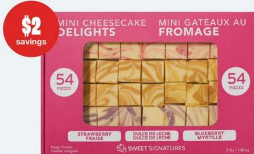
SWEET SIGNATURES MINI CHEESECAKE DELIGHTS 1.36 KG, FROZEN 21616523_EA