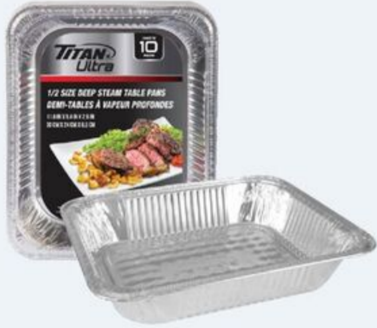
FULL SIZE DEEP TABLE PAN 5'S OR TITAN HALF STEAM DEEP PAN 10'S 11.8" X 9.4" X 2.5" 21667077_EA