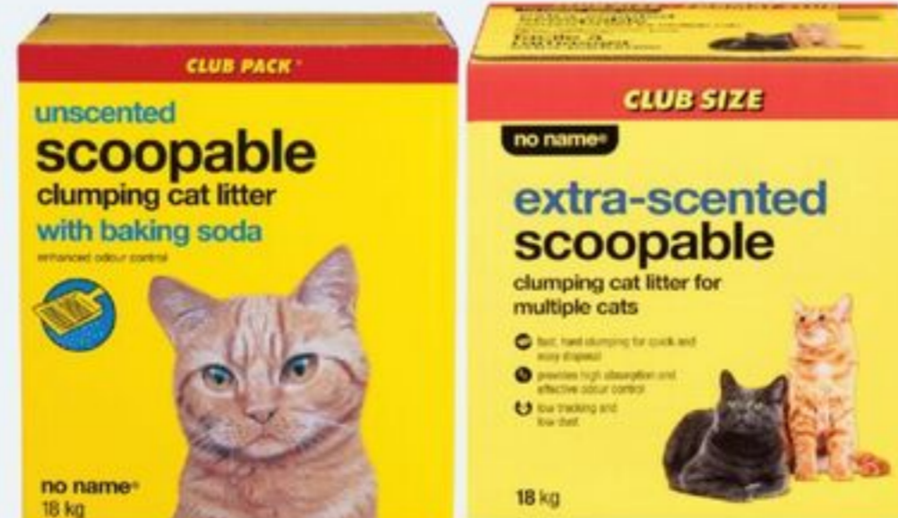
NO NAME® CAT LITTER SELECTED VARIETIES CLUB PACK®, 18 KG 20177169001_EA/20177169002_EA