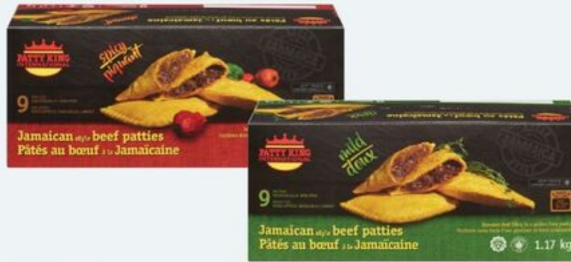
PATTY KING JAMAICAN STYLE BEEF PATTIES SELECTED VARIETIES FROZEN, 1.17 KG 20313668001_EA 20313668002_EA