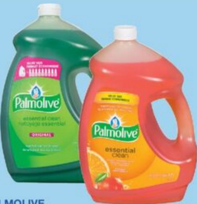
PALMOLIVE DISHWASHING LIQUID SELECTED VARIETIES 4.27 L 21516689_EA/21516691_EA