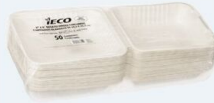
IECO BAGASSE CONTAINERS 50'S 21520500_EA