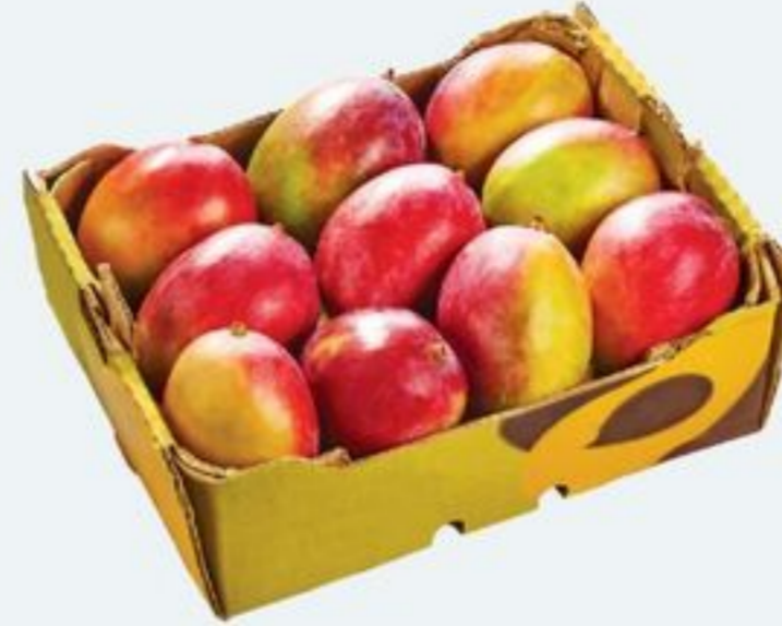
RED MANGOS PRODUCT OF U.S.A. 3.75 KG 21047849_C01