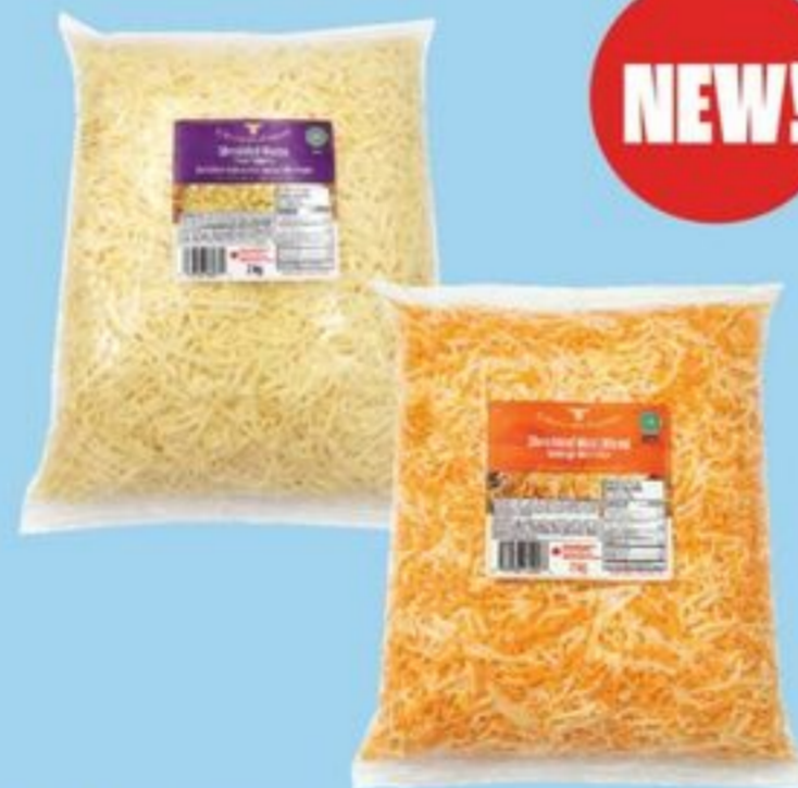
COUNTRY FARMS SHREDDED CHEESE 2 KG 21721226_EA 21721247_EA