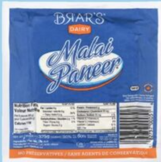
BRAR'S MALAI PANEER 20% M.F., 375 G 20283164_EA