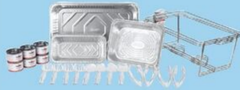
CATERING SET 31'S 21481993_C31