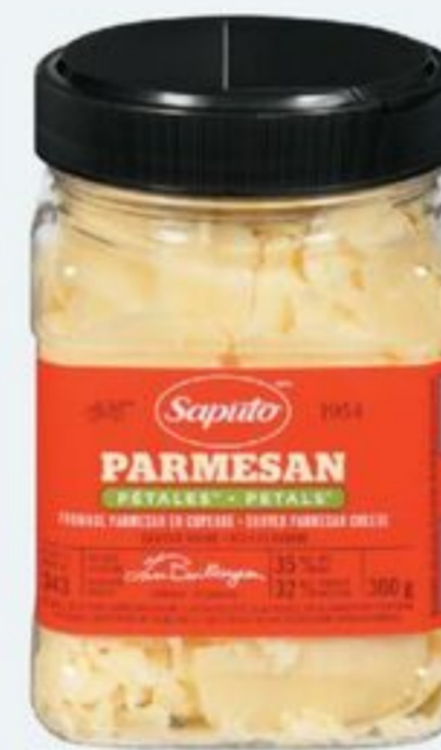
SAPUTO PARMESAN PETALS 300 G 20600090_EA