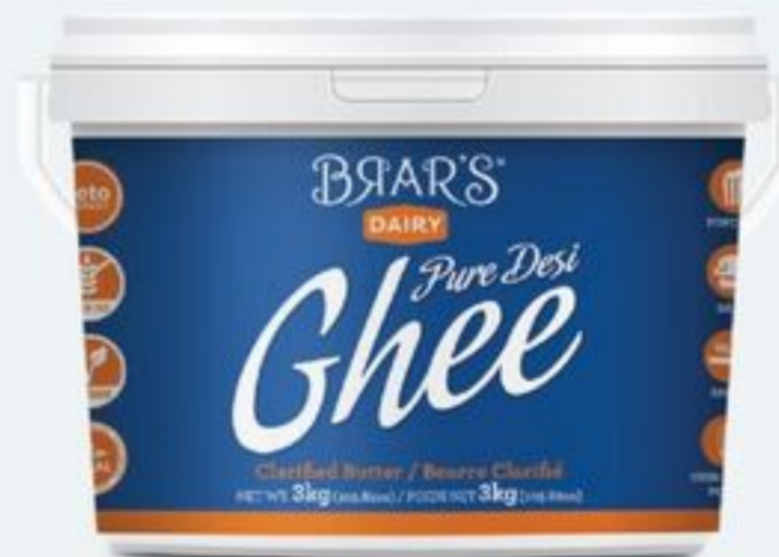
BRAR'S DESI GHEE 3 KG 21520900_EA