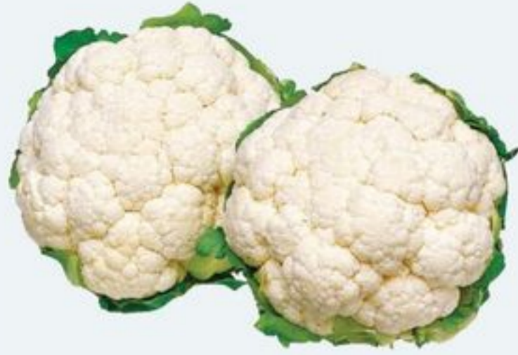
CAULIFLOWER PRODUCT OF U.S.A. EACH 20135377001_EA