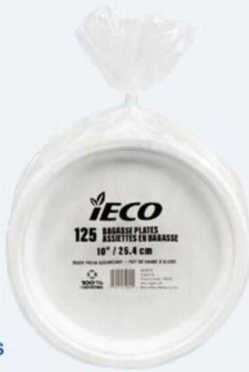
IECO BAGASSE PLATES 10", 125'S 21529156_EA