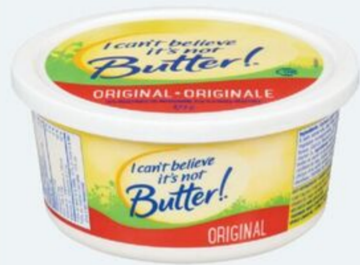
I CAN'T BELIEVE IT'S NOT BUTTER! MARGARINE 427 G 20061949001_EA