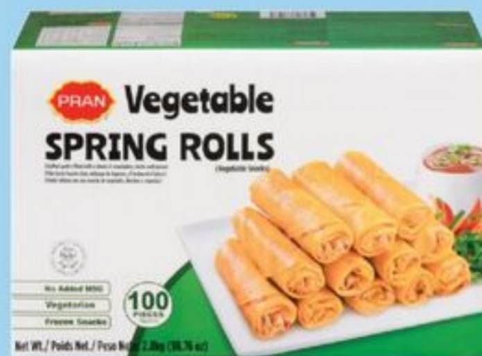
PRAN SPRING ROLLS 2.8 KG 21615971_EA