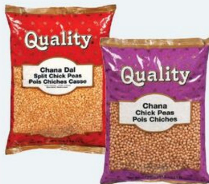
QUALITY CHANA DAL OR CHICK PEAS 4.99 KG 20617490_EA/20617921_EA