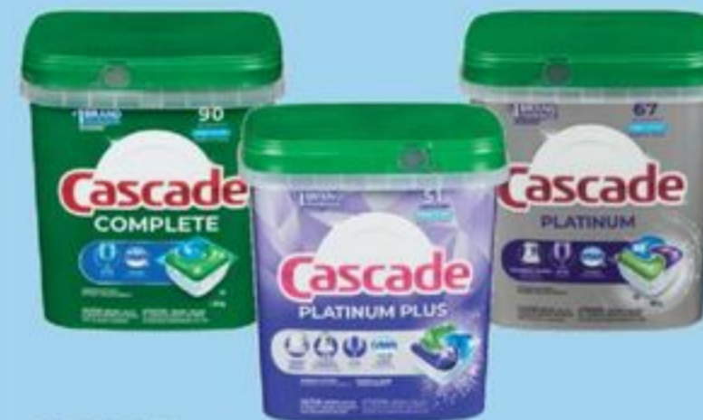
CASCADE PLATINUM DISHWASHER DETERGENT SELECTED VARIETIES 51'S-90'S 21012172_EA/21516545_EA 21518479_EA