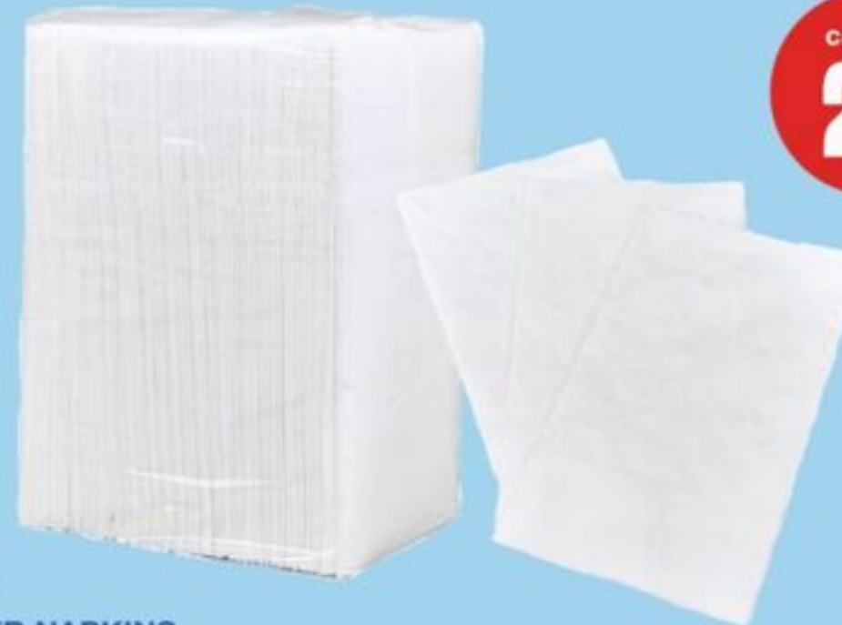
ECPK DINNER NAPKINS WHITE 20 SLEEVES X 150'S 21734370_C20