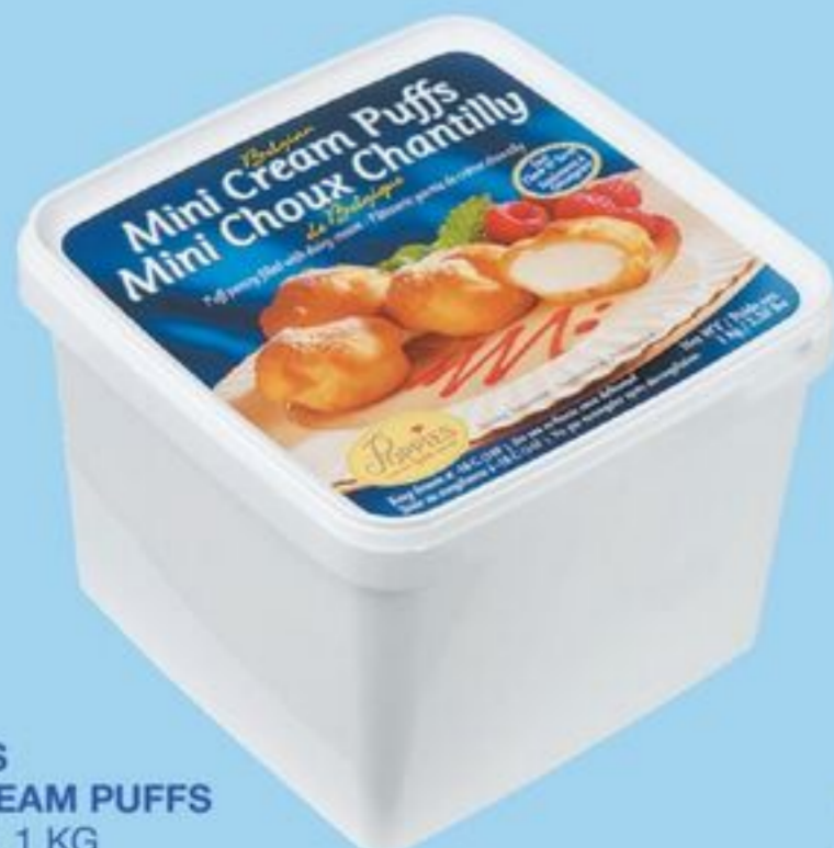
POPPIES MINI CREAM PUFFS FROZEN, 1 KG 20501307_EA