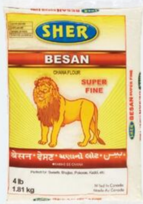
SHER BESAN CHANA FLOUR 1.81 KG 20869922_EA