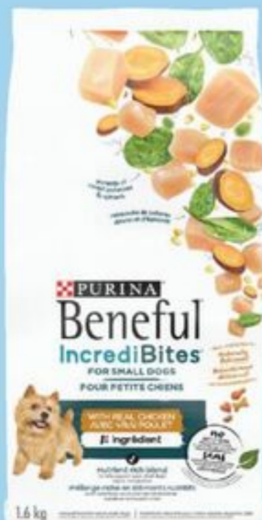
PURINA BENEFUL DRY DOG FOOD SELECTED VARIETIES 1.6 KG 20849862_EA