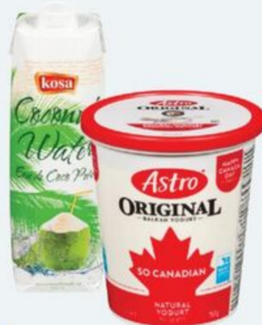
ASTRO YOGURT TUBS 750 G OR KOSA COCONUT WATER 1 L SELECTED VARIETIES 20165226001_EA/20165226001_EA 21176899_EA