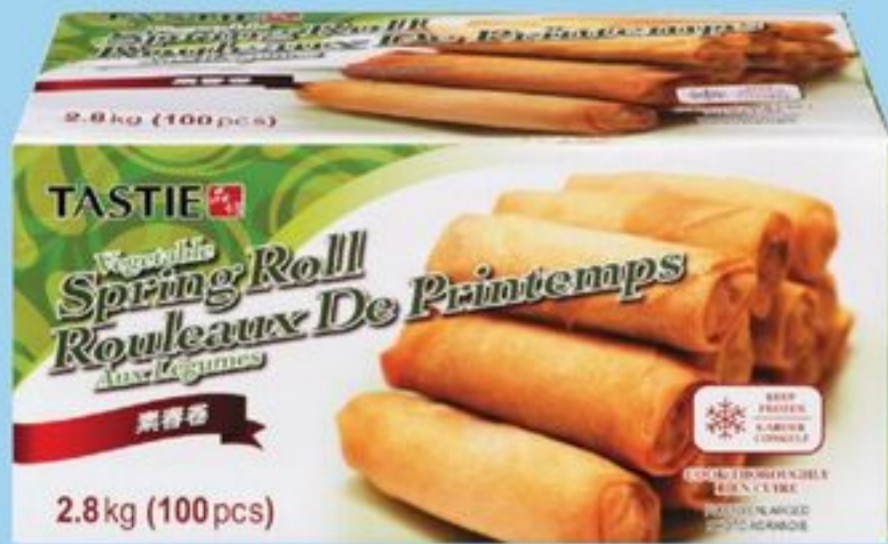
TASTIE VEGETABLE SPRING ROLLS FROZEN, 100'S 21207713_EA