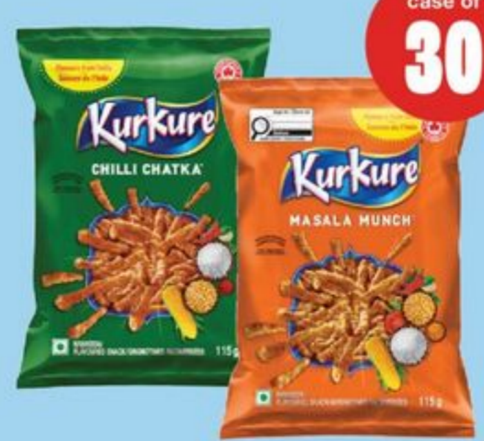
KURKURE FLAVOURED SNACKS SELECTED VARIETIES 30 X 115 G 20659742_C30/21361077_C30