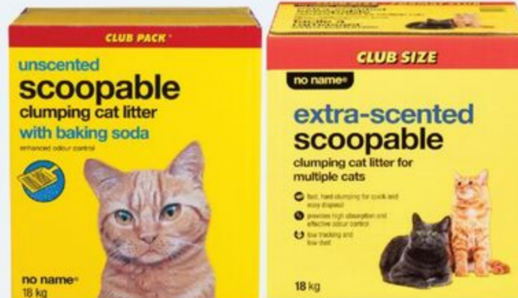
NO NAME® CAT LITTER SELECTED VARIETIES CLUB PACK®, 18 KG 20177169001_EA/20177169002_EA