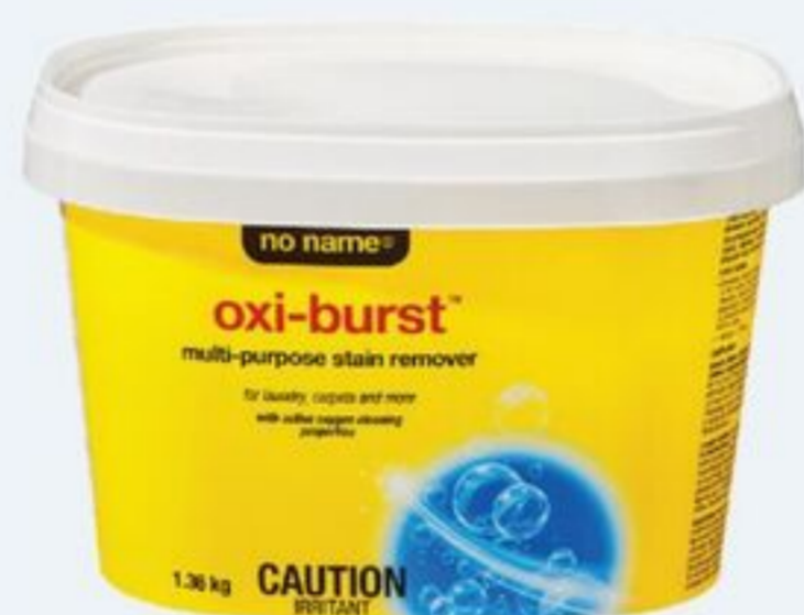
NO NAME® OXY-BURST STAIN REMOVER 1.36 KG 21358883_EA