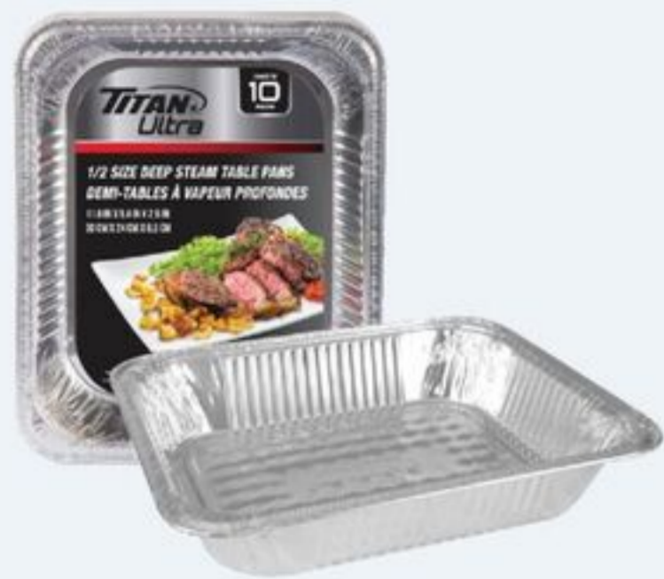
FULL SIZE DEEP TABLE PAN 5'S OR TITAN HALF STEAM DEEP PAN 10'S 11.8" X 9.4" X 2.5" 21667077_EA