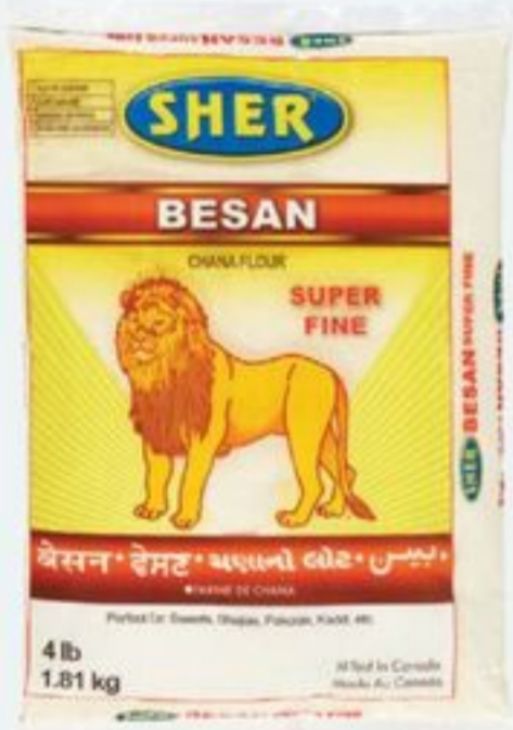
SHER BESAN CHANA FLOUR 1.81 KG 20869922_EA