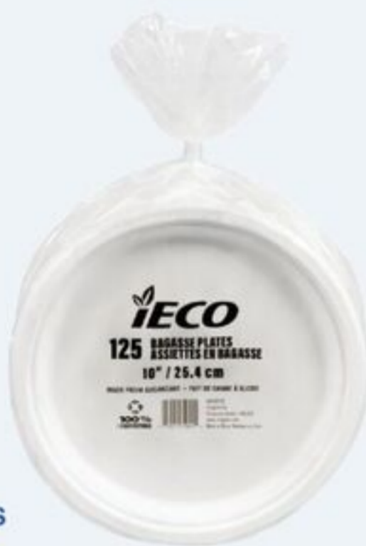
IECO BAGASSE PLATES 10", 125'S 21529156_EA