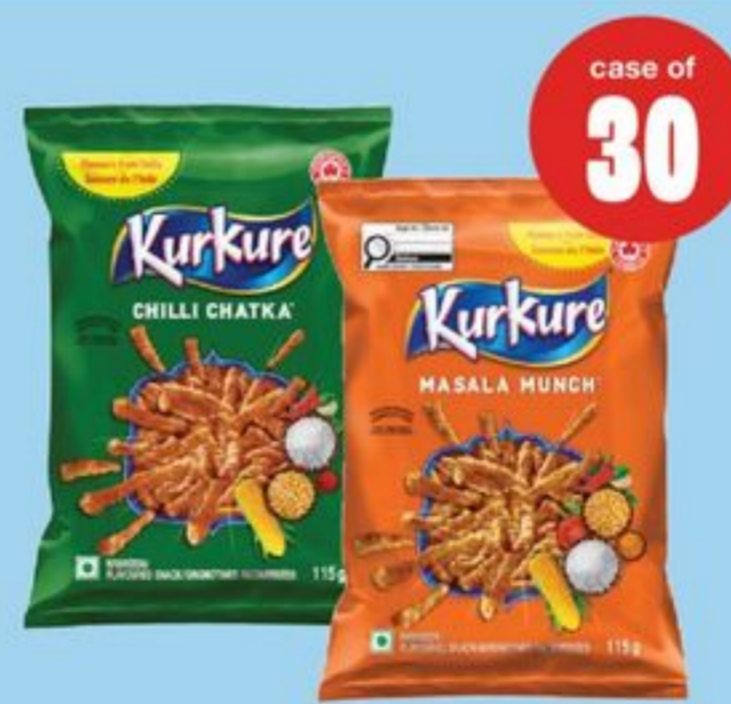
KURKURE FLAVOURED SNACKS SELECTED VARIETIES 30 X 115 G 20659742_C30/21361077_C30