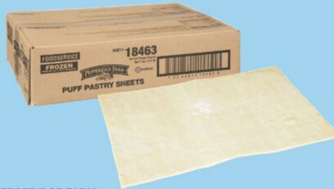
PEPPERIDGE FARM PUFF PASTRY SHEETS FROZEN, 20 X 311 G 20089133_EA