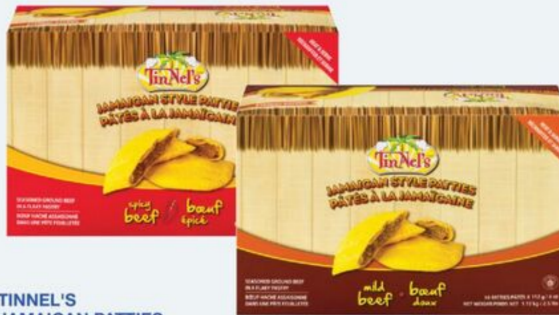
TINNEL'S JAMAICAN PATTIES SELECTED VARIETIES FROZEN, 1.12 KG 20562244001_EA 20562244002_EA