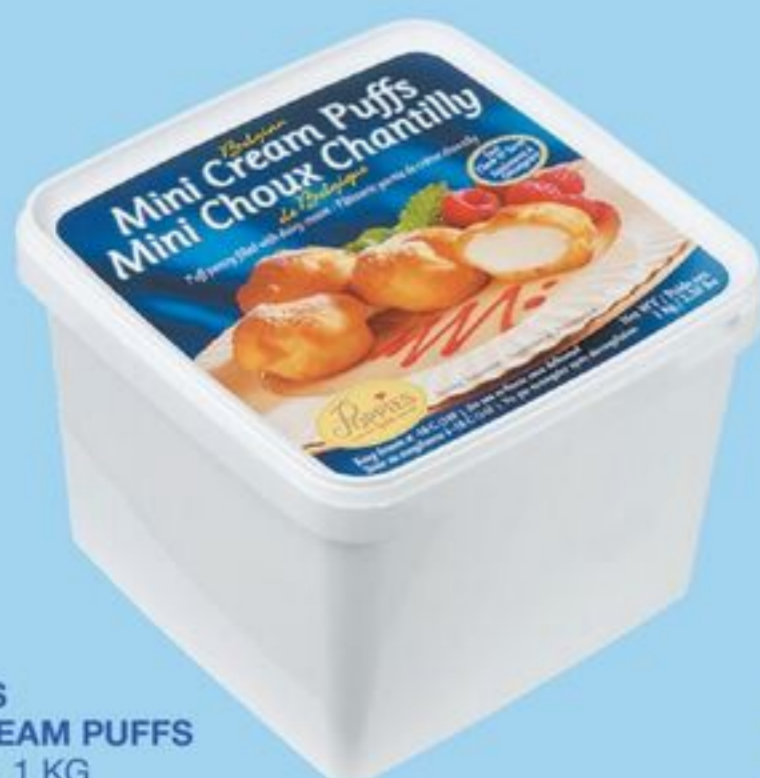
POPPIES MINI CREAM PUFFS FROZEN, 1 KG 20501307_EA