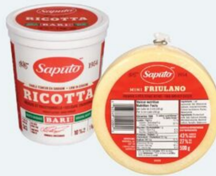
BARI RICOTTA 1 KG OR SAPUTO MINI FRIULANO CHEESE 500 G 20136427_EA/20708981_EA