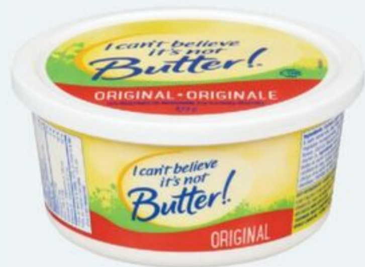
I CAN'T BELIEVE IT'S NOT BUTTER! MARGARINE 427 G 20061949001_EA