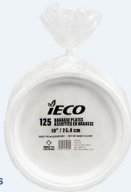
IECO BAGASSE PLATES 10", 125'S 21529156_EA