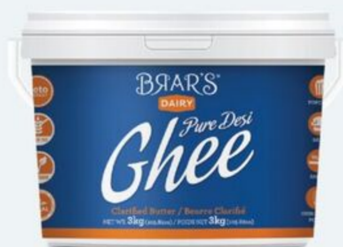
BRAR'S DESI GHEE 3 KG 21520900_EA