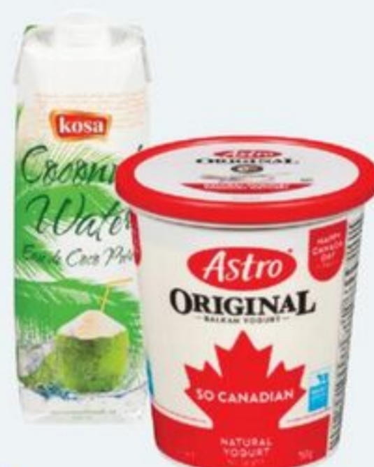
ASTRO YOGURT TUBS 750 G OR KOSA COCONUT WATER 1 L SELECTED VARIETIES 20165226001_EA/20165226001_EA 21176899_EA