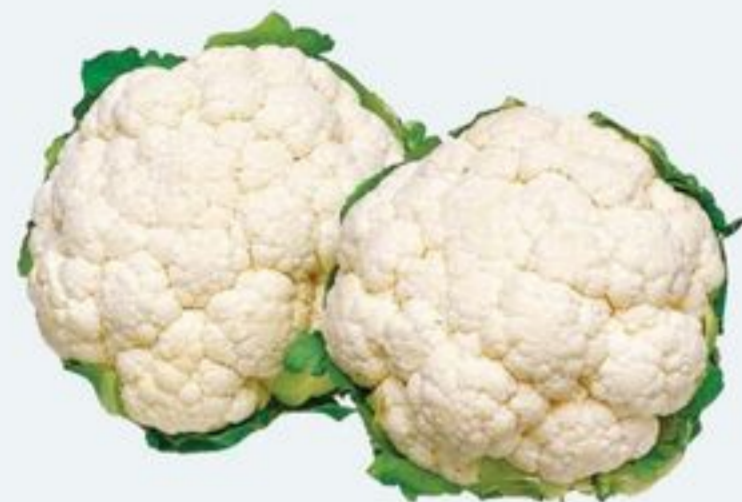
CAULIFLOWER PRODUCT OF U.S.A. EACH 20135377001_EA