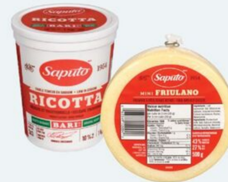
BARI RICOTTA 1 KG OR SAPUTO MINI FRIULANO CHEESE 500 G 20136427_EA/20708981_EA