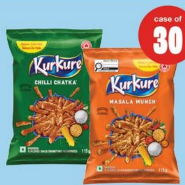
KURKURE FLAVOURED SNACKS SELECTED VARIETIES 30 X 115 G 20659742_C30/21361077_C30