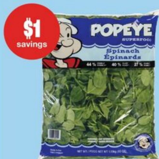
POPEYE SPINACH PRODUCT OF U.S.A. SELECTED VARIETIES 1.13 KG 20104062_EA