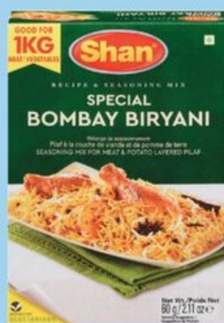
SHAN SPICE MIXES SELECTED VARIETIES 50-65 G 20323215002_EA