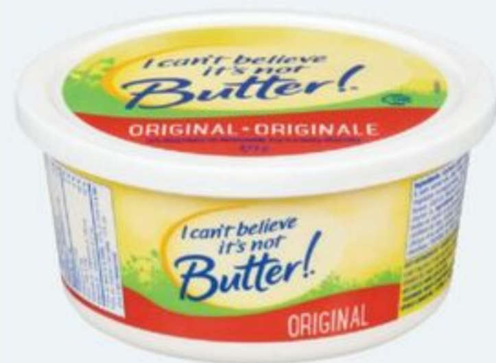
I CAN'T BELIEVE IT'S NOT BUTTER! MARGARINE 427 G 20061949001_EA