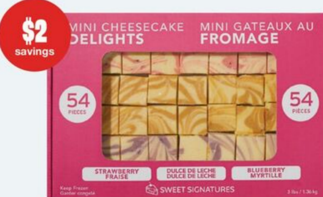
SWEET SIGNATURES MINI CHEESECAKE DELIGHTS 1.36 KG, FROZEN 21616523_EA