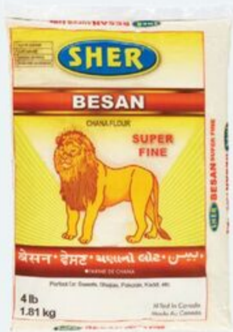
SHER BESAN CHANA FLOUR 1.81 KG 20869922_EA