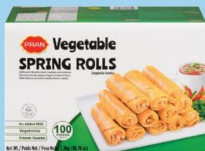
PRAN SPRING ROLLS 2.8 KG 21615971_EA