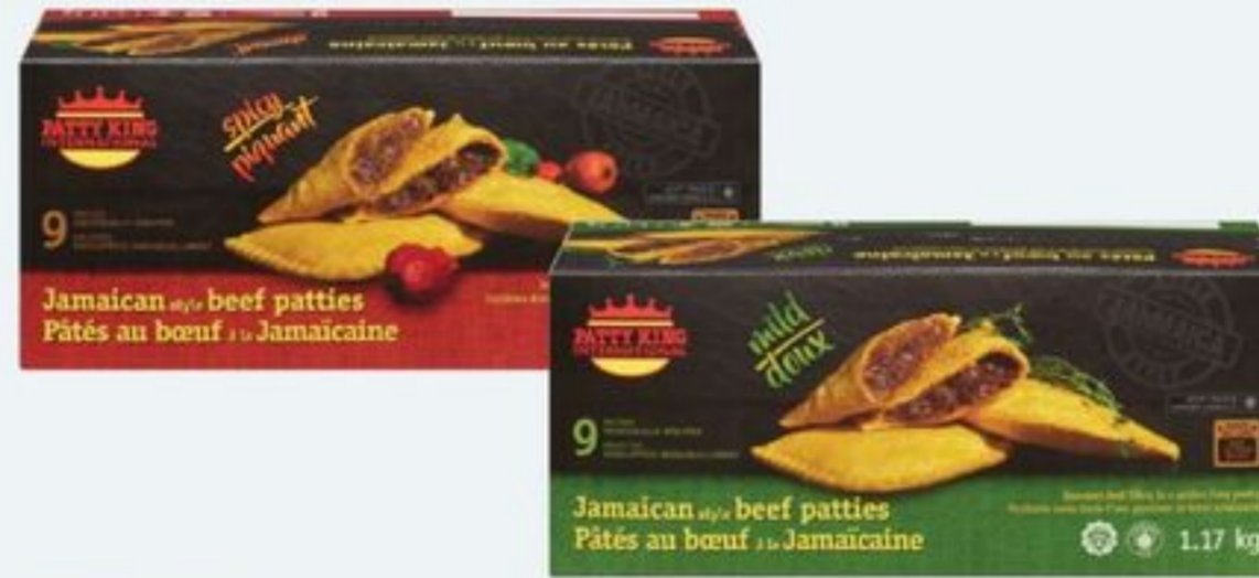
PATTY KING JAMAICAN STYLE BEEF PATTIES HOT OR MILD FROZEN, 1.17 KG 20313668001_EA 20313668002_EA