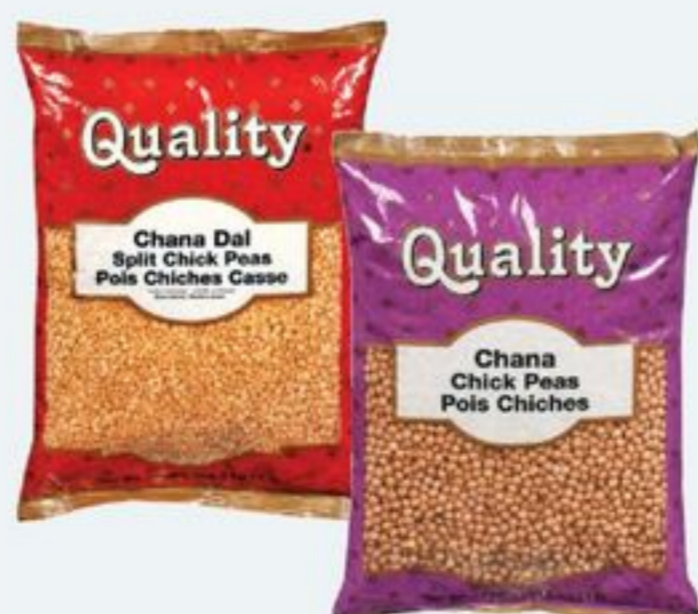
QUALITY CHANA DAL OR CHICK PEAS 4.99 KG 20617490_EA/20617921_EA