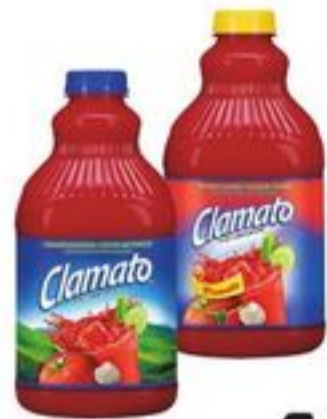
Mott's Clamato 64-oz. Selected varieties.