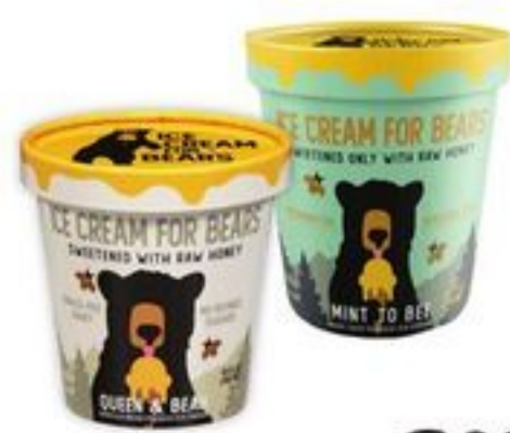
Ice Cream For Bears 14-oz. Selected varieties.