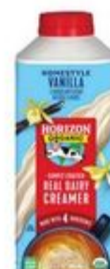
Horizon Organic Creamer 24-oz. Selected varieties.