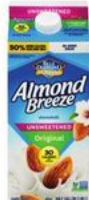
Blue Diamond Almond Breeze Almondmilk 52 to 64-oz. Selected varieties. Member Price: $3.50 ea.