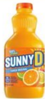
Sunny D 64-oz.