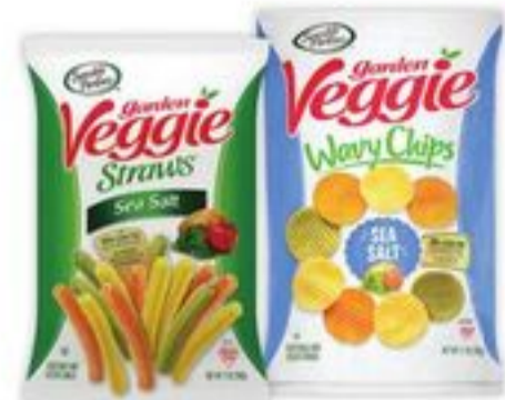
Sensible Portions Veggie Straws or Chips 4.25 to 7-oz. Selected varieties. Member Price: $3.50 ea.