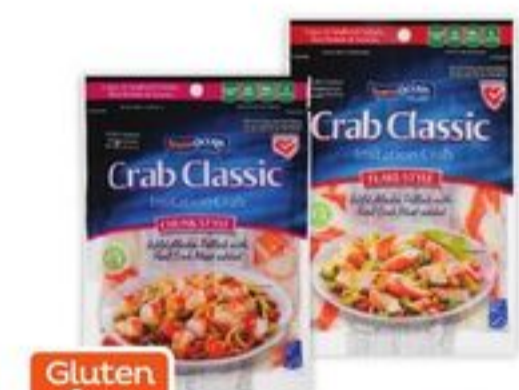
Gluten free Trans-Ocean Crab Classic 8-oz. Flake or Chunk Style. Member Price: $2.50 ea.