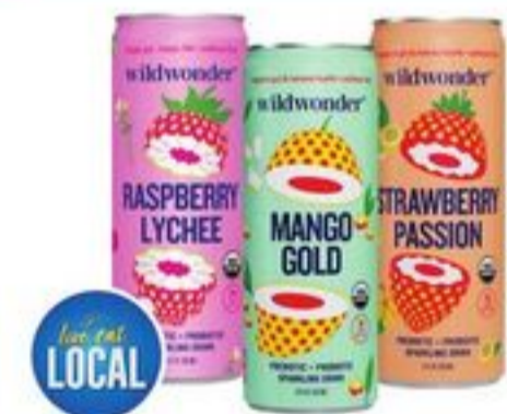
Wildwonder Sparkling Prebiotic 12-oz. Selected varieties. Member Price: $3.00 ea.