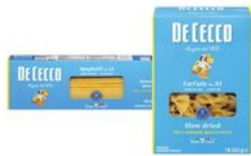
De Cecco Pasta 16-oz. Selected varieties. Member Price: $2.50 ea.