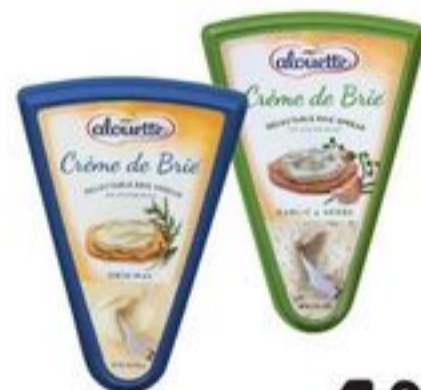
Alouette Crème de Brie 5-oz. Original or Garlic & Herbs.