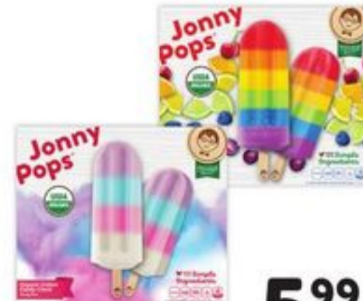
Jonny Pops Popsicles 8-ct. Selected varieties.