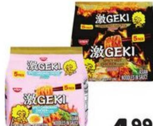
Nissin Geki Spicy Soup 3.8 to 3.88-oz. Selected varieties.