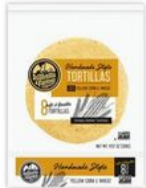
La Tortilla Factory Handmade Style Tortillas 8-ct. Selected varieties. Member Price: $2.50 ea.