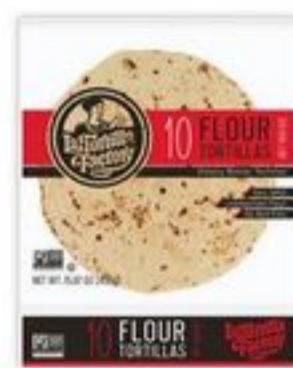
La Tortilla Factory Simply Better Flour Tortillas 8 to 10-ct. Selected varieties.