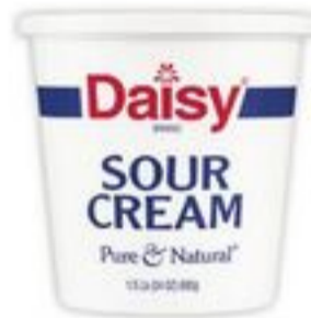
Daisy Sour Cream 24-oz. Selected varieties.