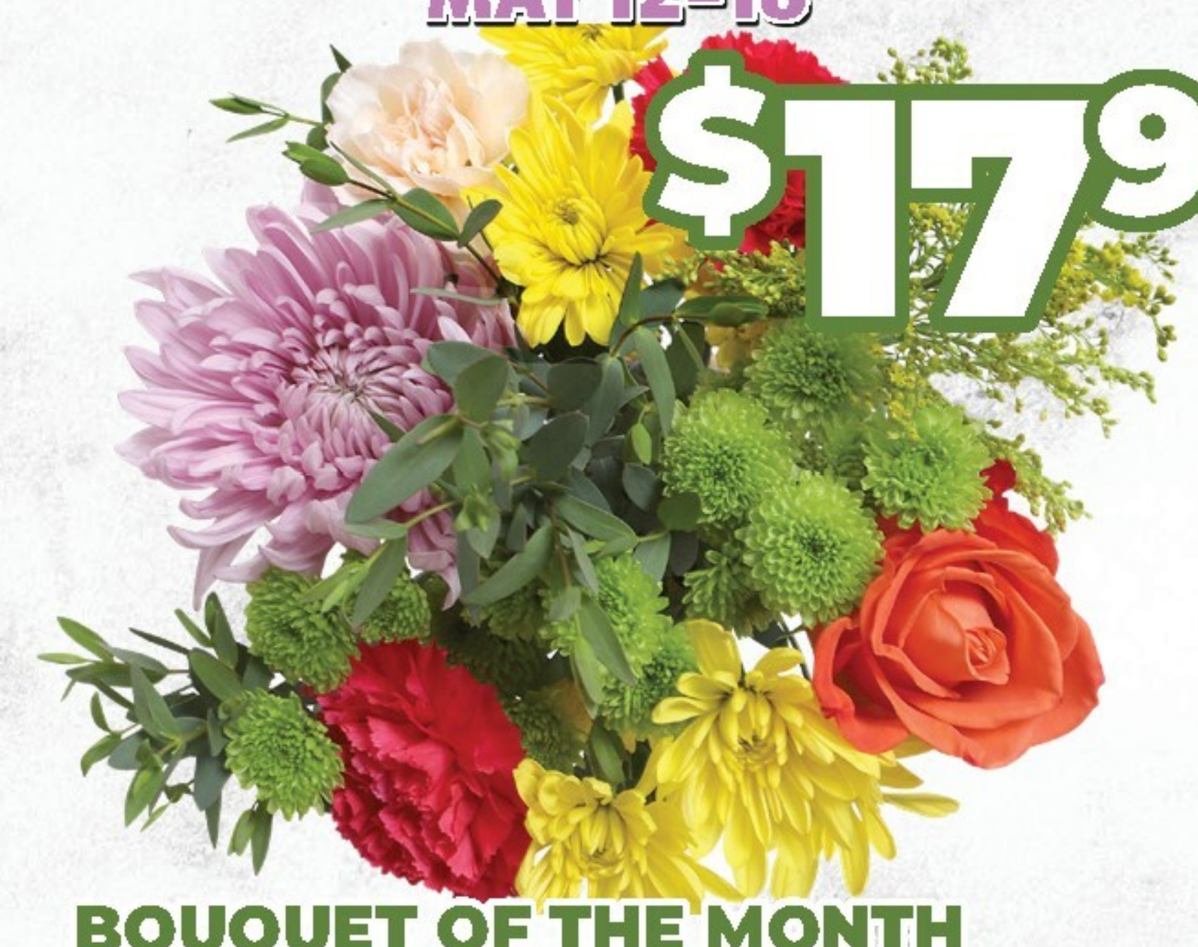
BOUQUET OF THE MONTH