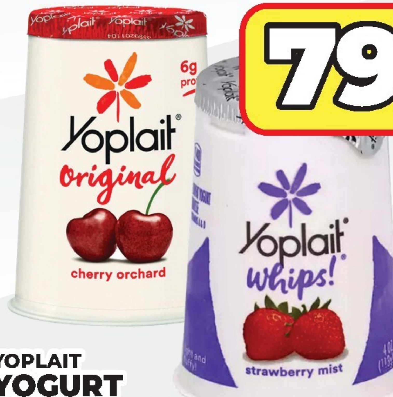
YOPLAIT YOGURT 4-6 OZ. SELECT VARIETIES