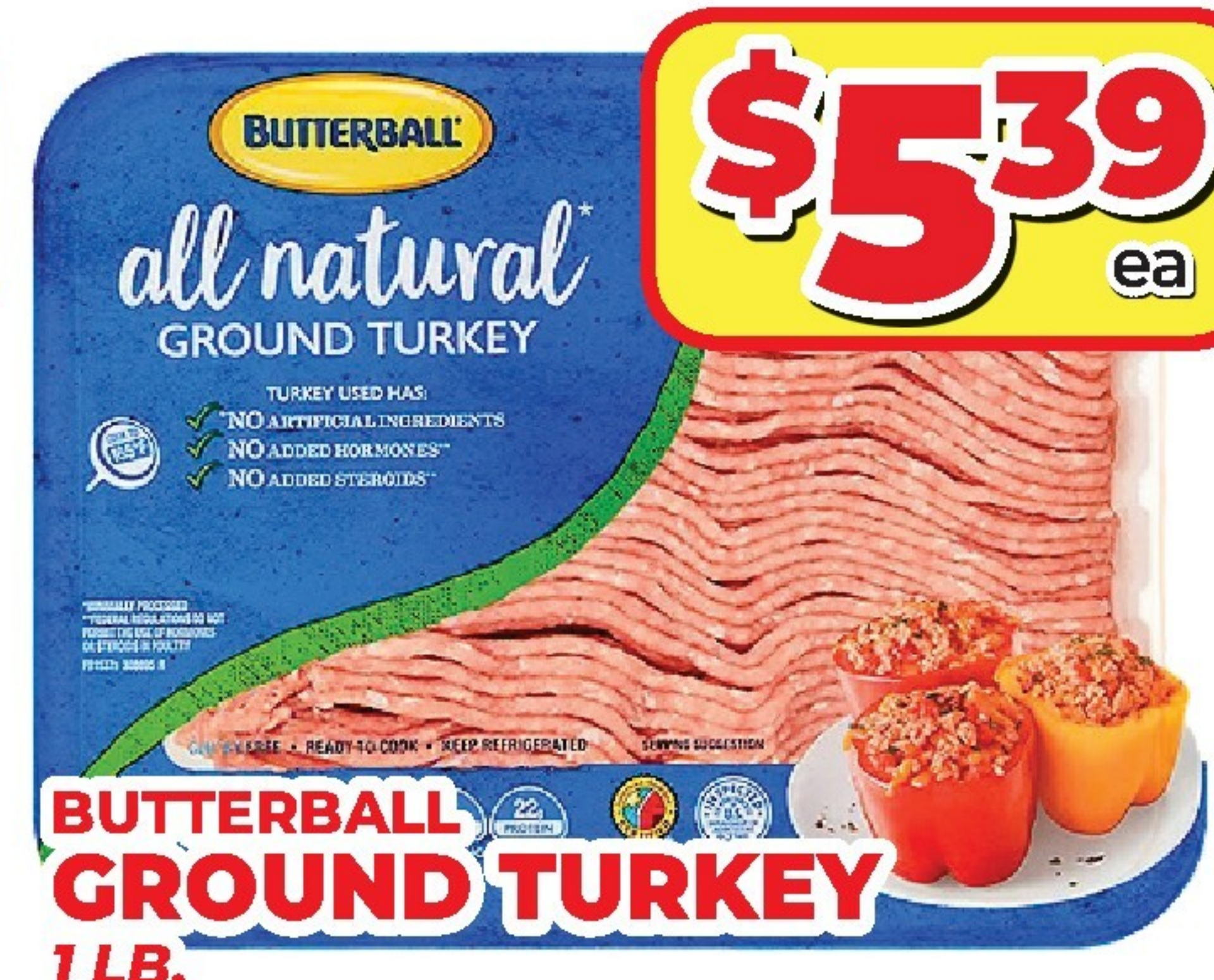
BUTTERBALL GROUND TURKEY 1 LB.