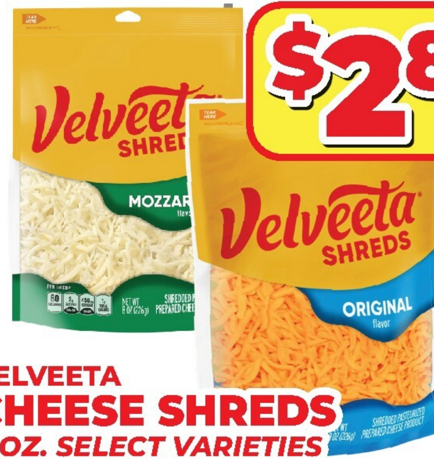
VELVEETA CHEESE SHREDS 8 OZ. SELECT VARIETIES