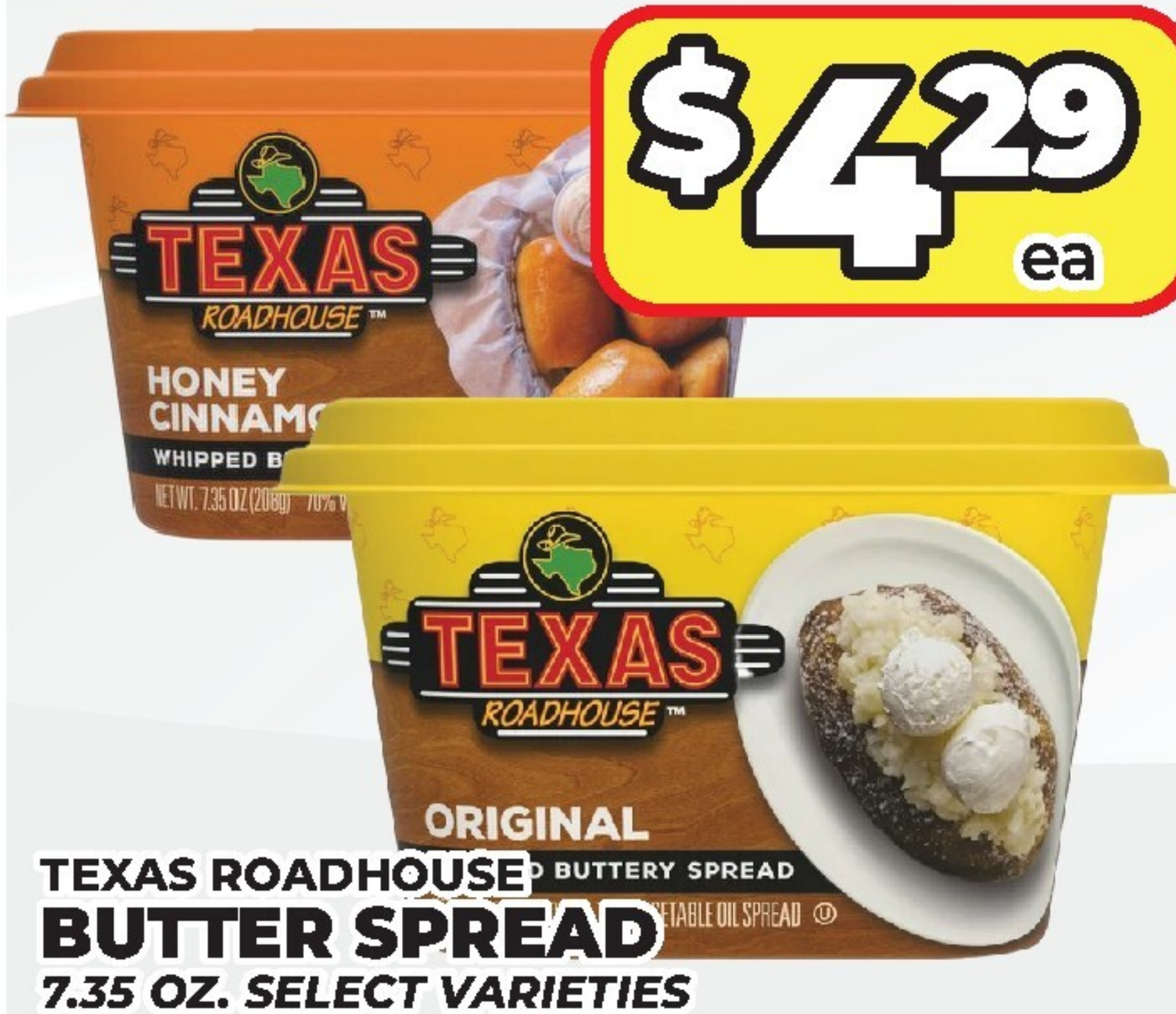
TEXAS ROADHOUSE BUTTER SPREAD 7.35 OZ. SELECT VARIETIES