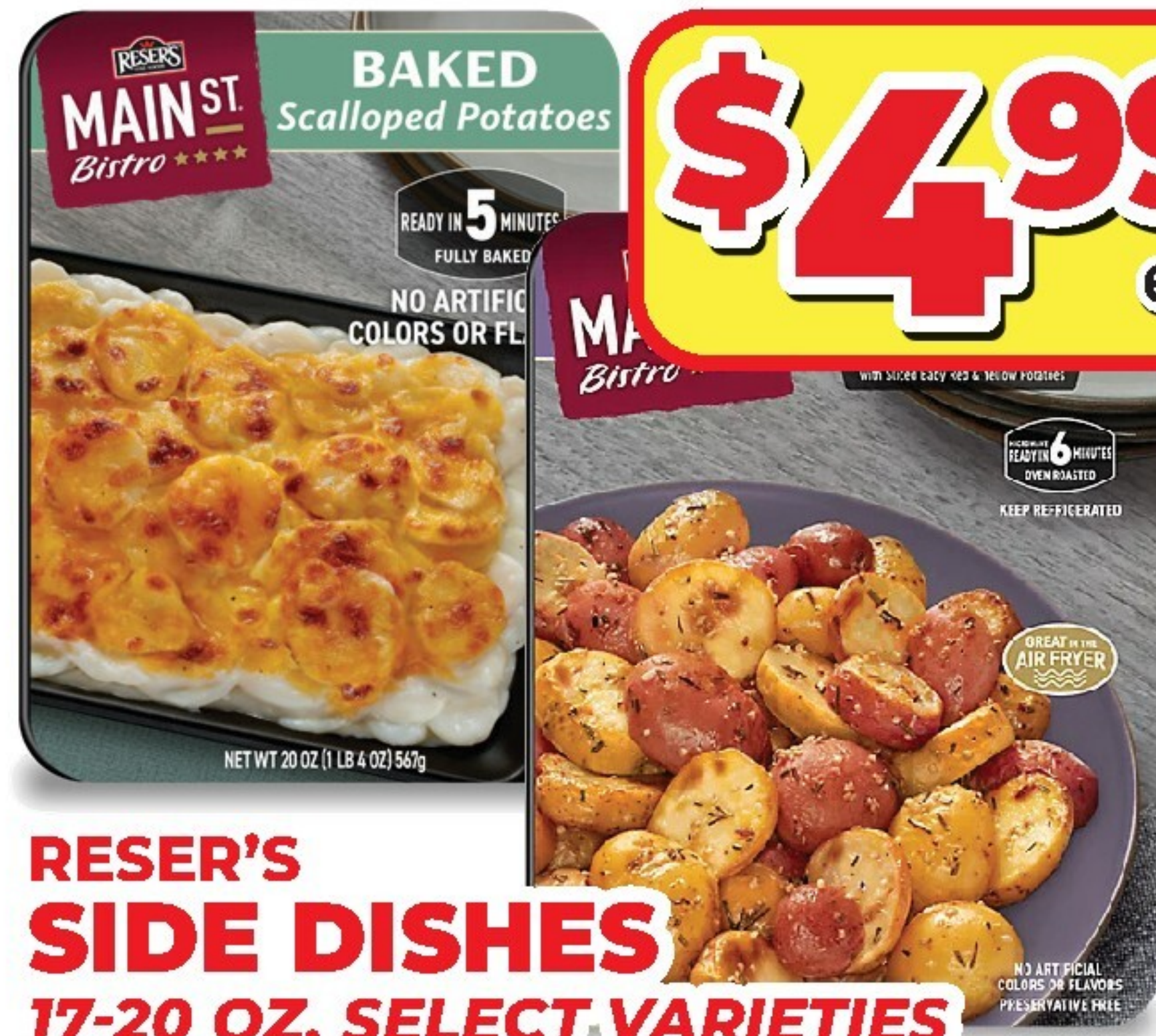
RESER'S SIDE DISHES 17-20 OZ. SELECT VARIETIES