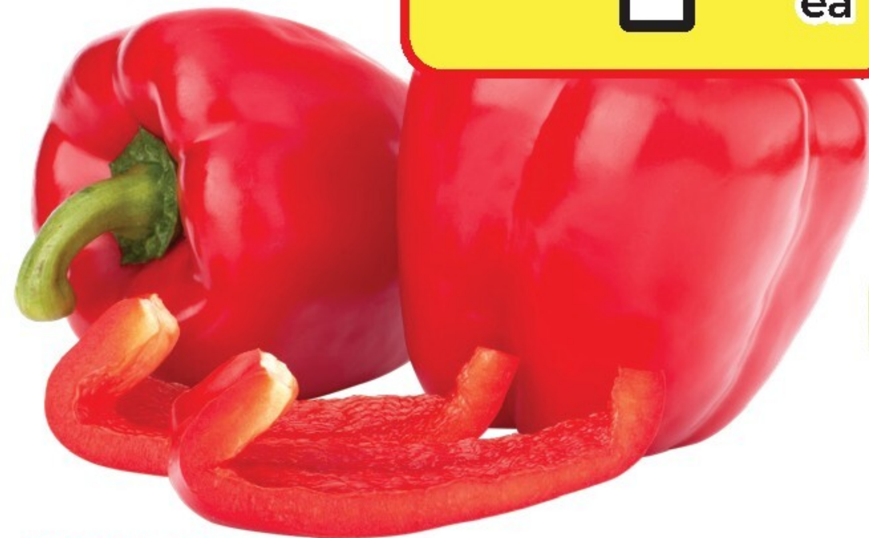
EXTRA LARGE RED BELL PEPPERS