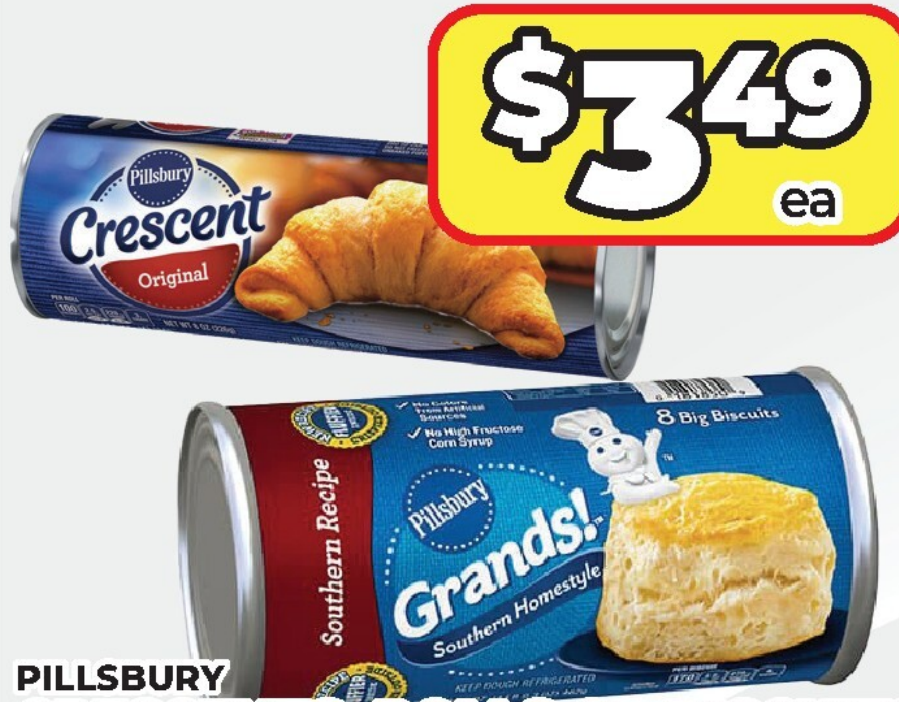
PILLSBURY CRESCENTS, ROLLS OR BISCUITS 8-16.3 OZ. SELECT VARIETIES