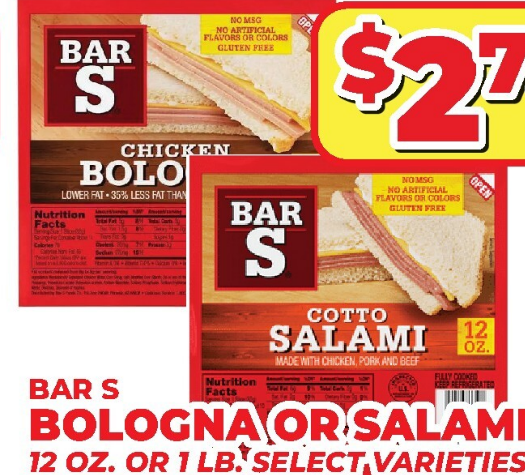
BAR S BOLOGNA OR SALAMI 12 OZ. OR 1 LB. SELECT VARIETIES