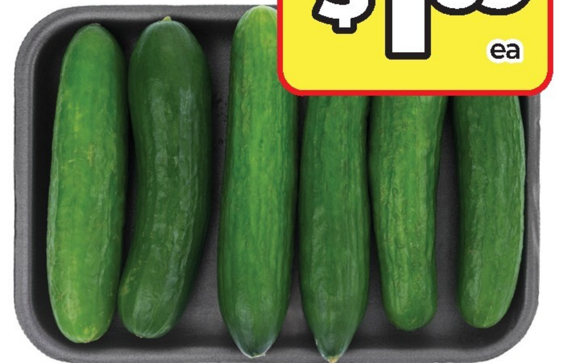
MINI CUCUMBERS 6 CT.