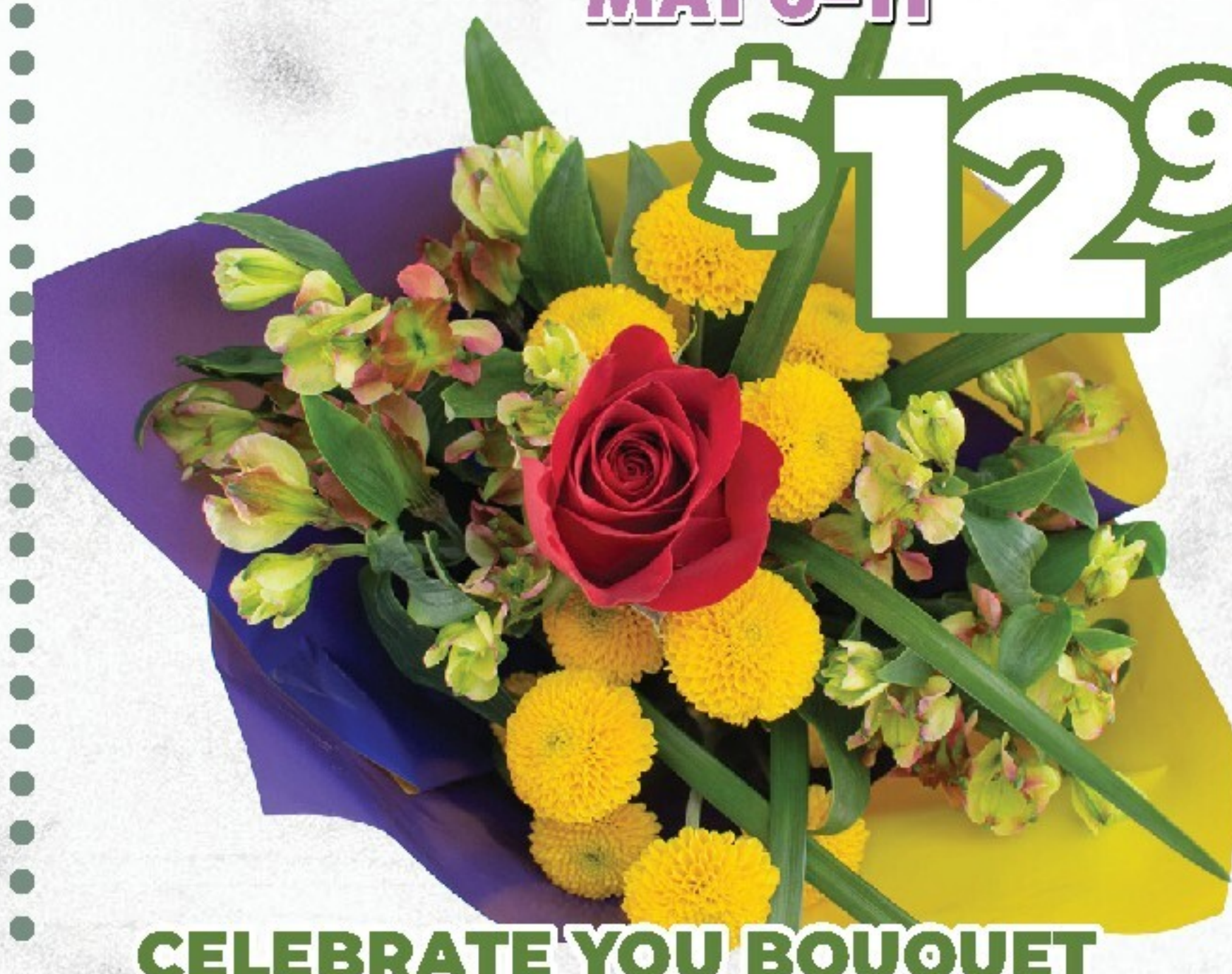
CELEBRATE YOU BOUQUET