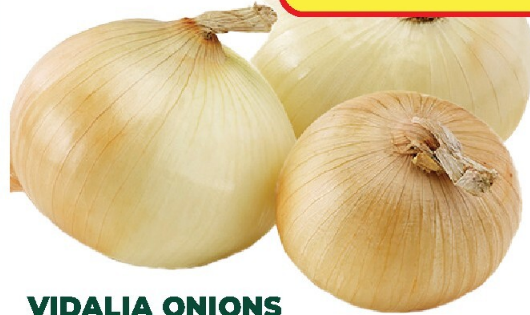
VIDALIA ONIONS 3 LB. BAG