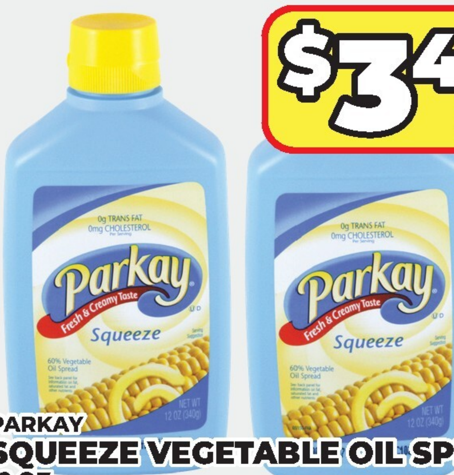
PARKAY SQUEEZE VEGETABLE OIL SPREAD 12 OZ.