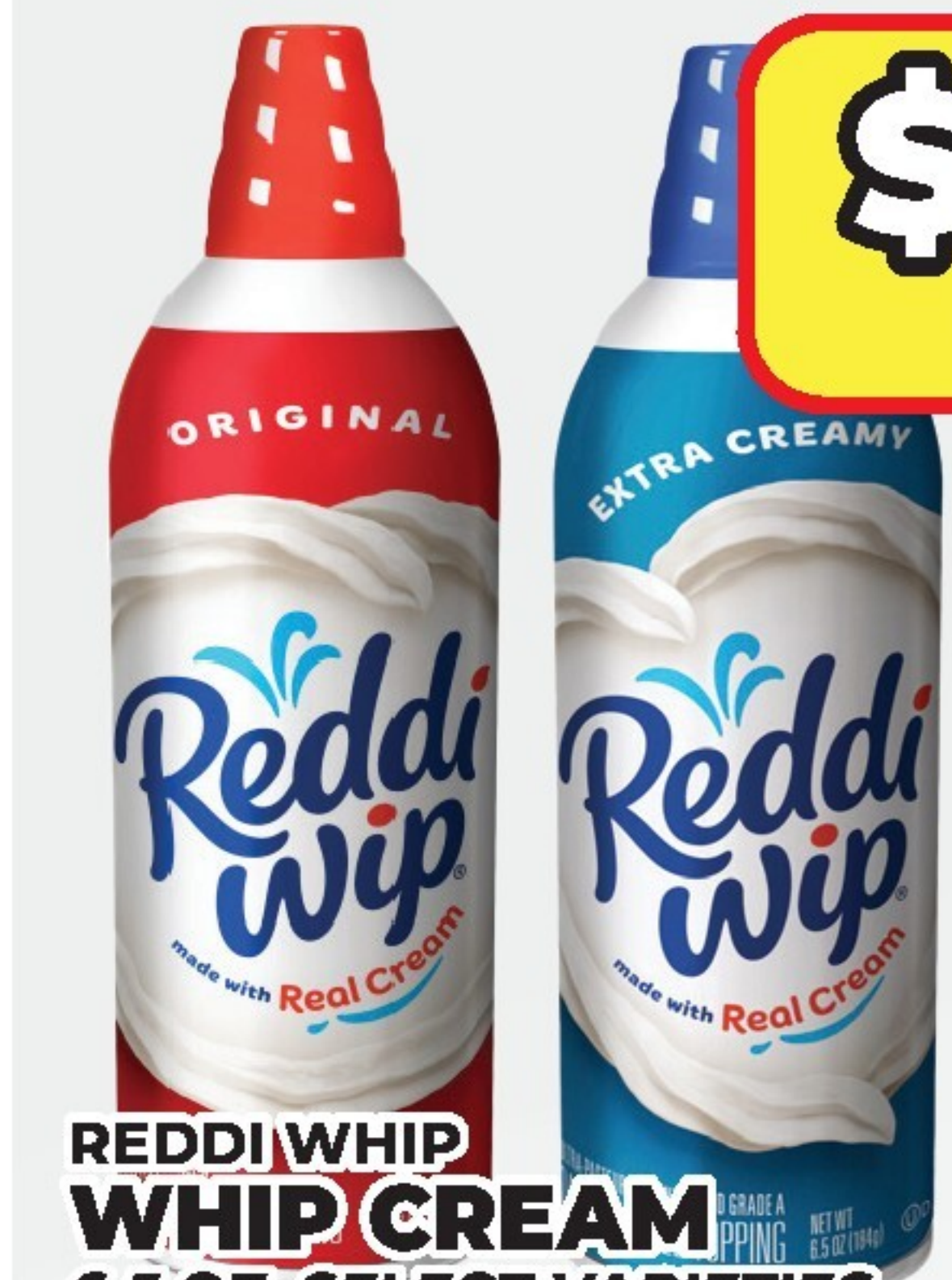
REDDI WHIP WHIP CREAM 6.5 OZ. SELECT VARIETIES