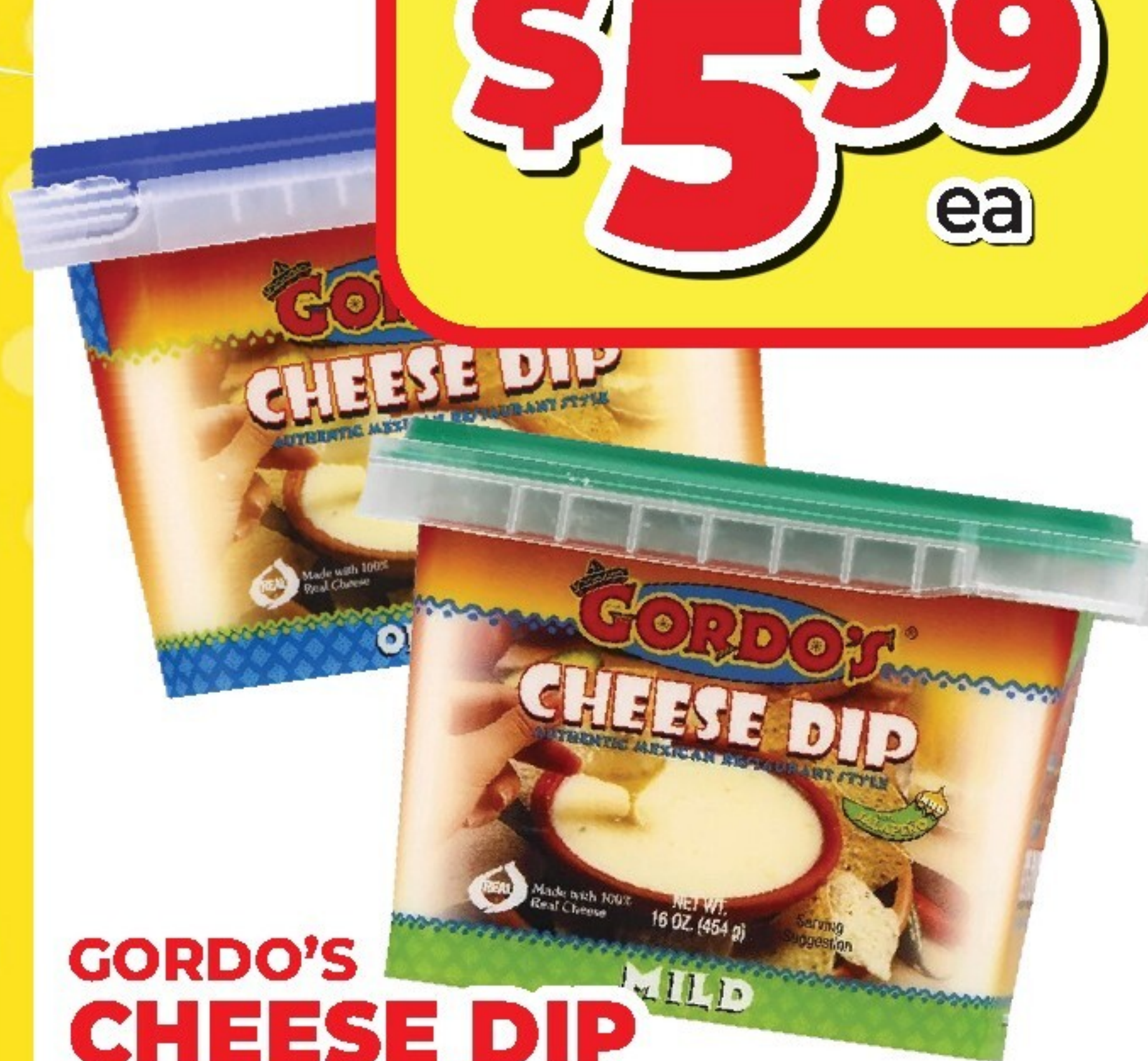
GORDO'S CHEESE DIP 16 OZ. SELECT VARIETIES