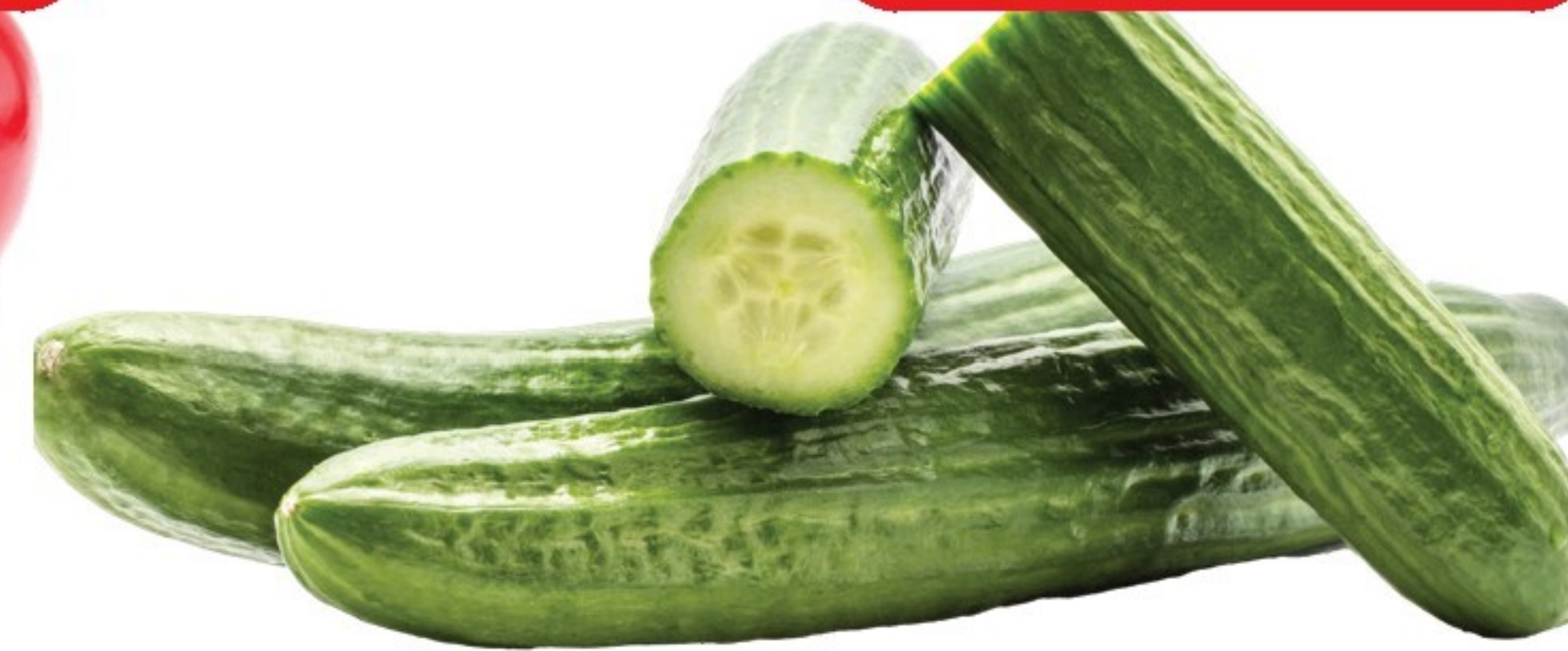
ENGLISH MEDIUM CUCUMBERS