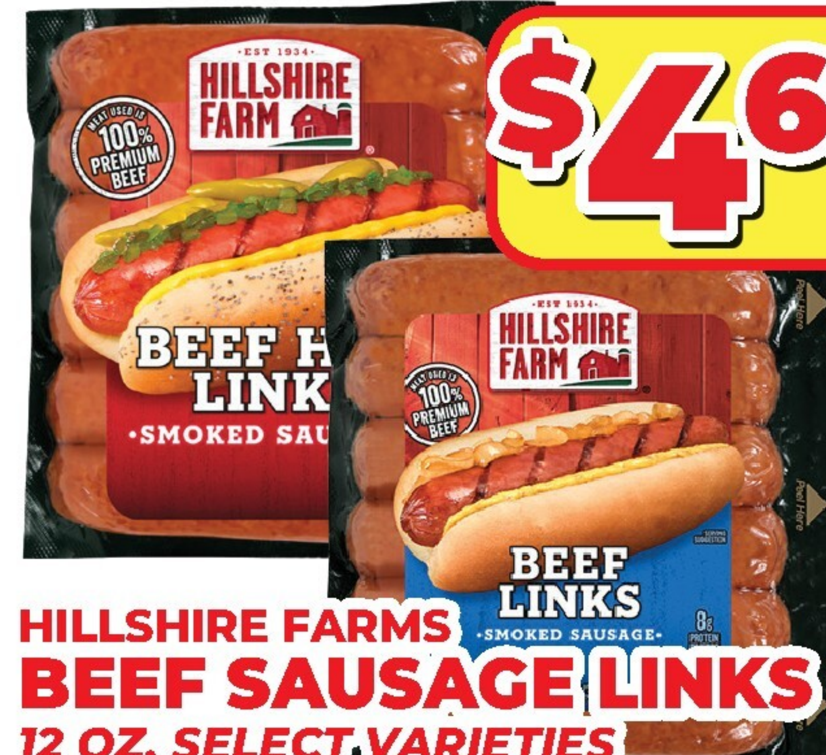
HILLSHIRE FARMS BEEF SAUSAGE LINKS 12 OZ. SELECT VARIETIES