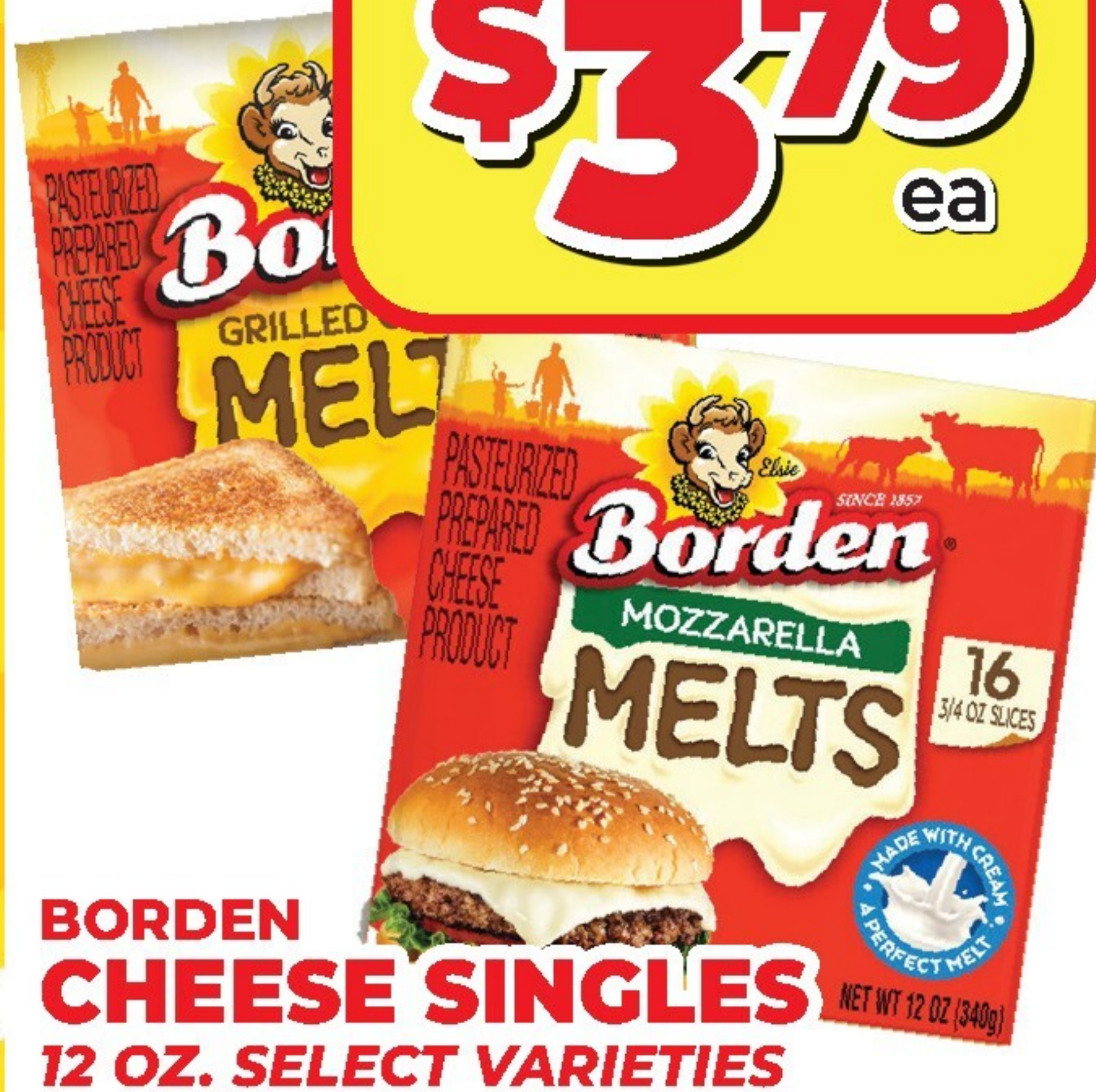
BORDEN CHEESE SINGLES 12 OZ. SELECT VARIETIES