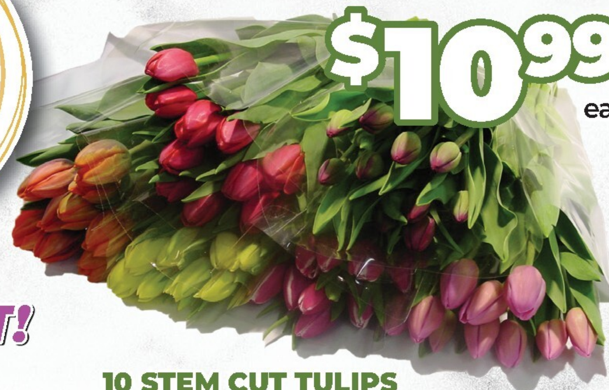
10 STEM CUT TULIPS