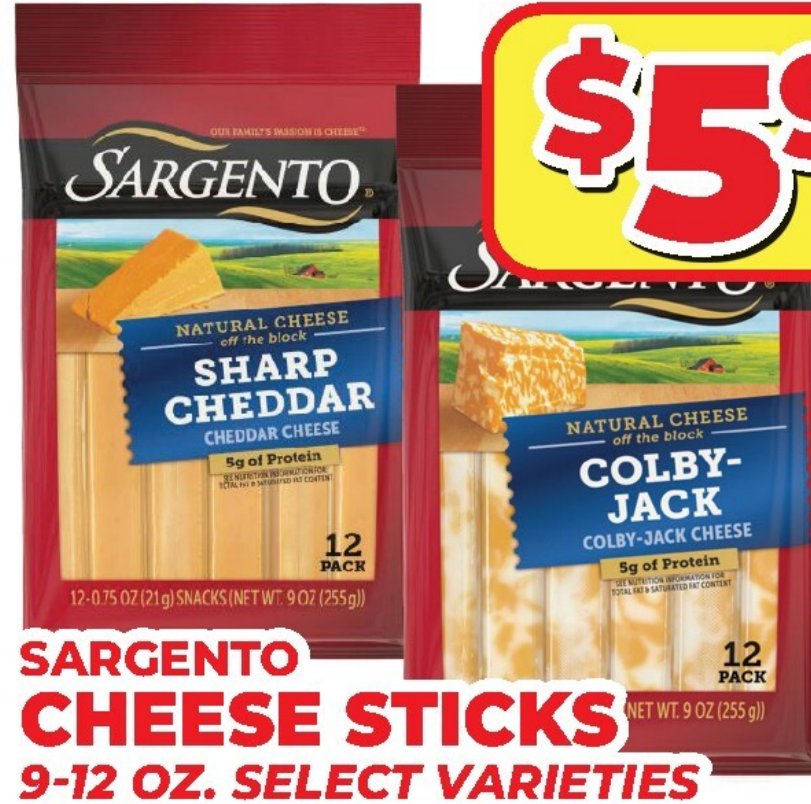
SARGENTO CHEESE STICKS 9-12 OZ. SELECT VARIETIES