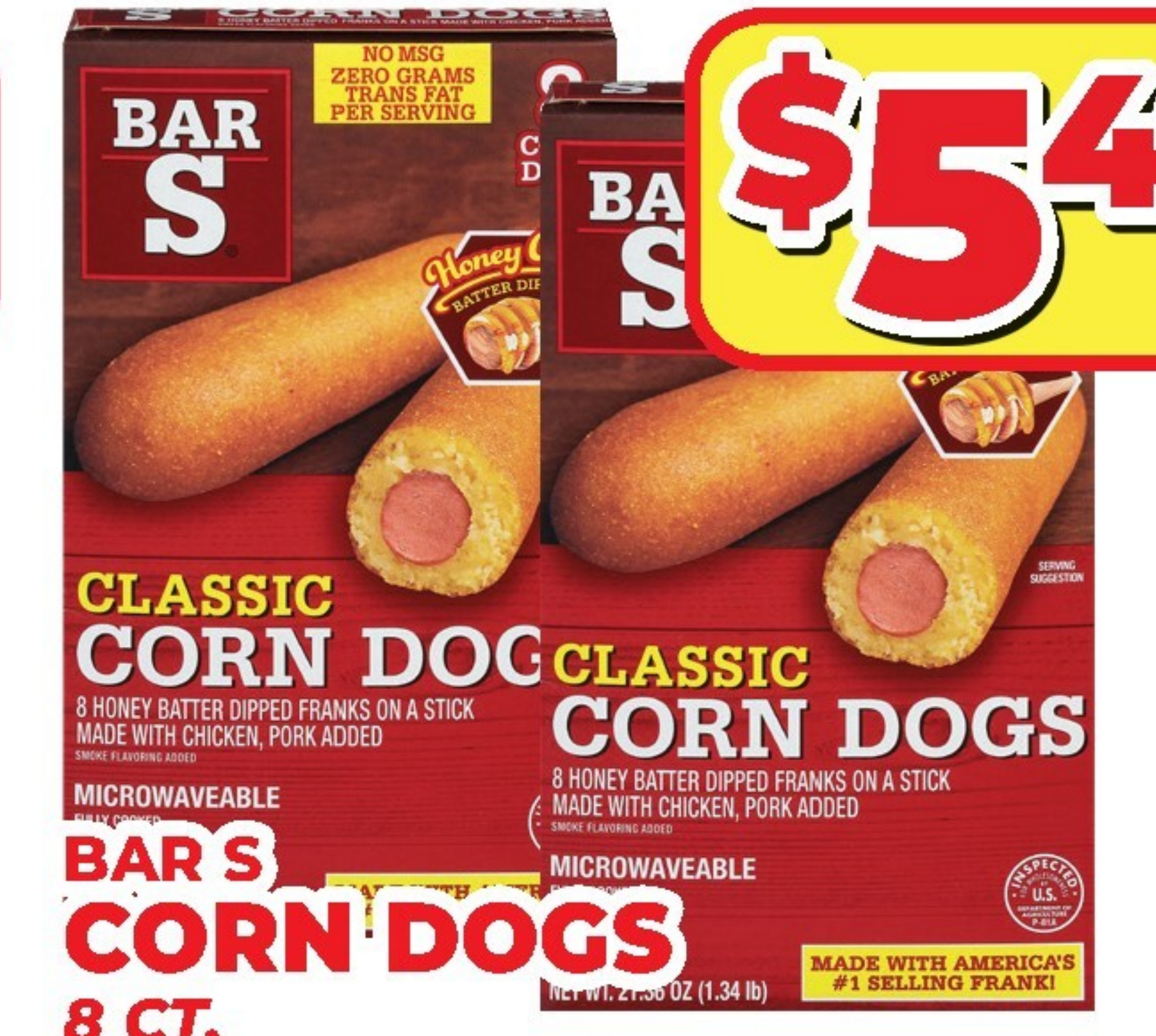
BAR S CORN DOGS 8 CT.