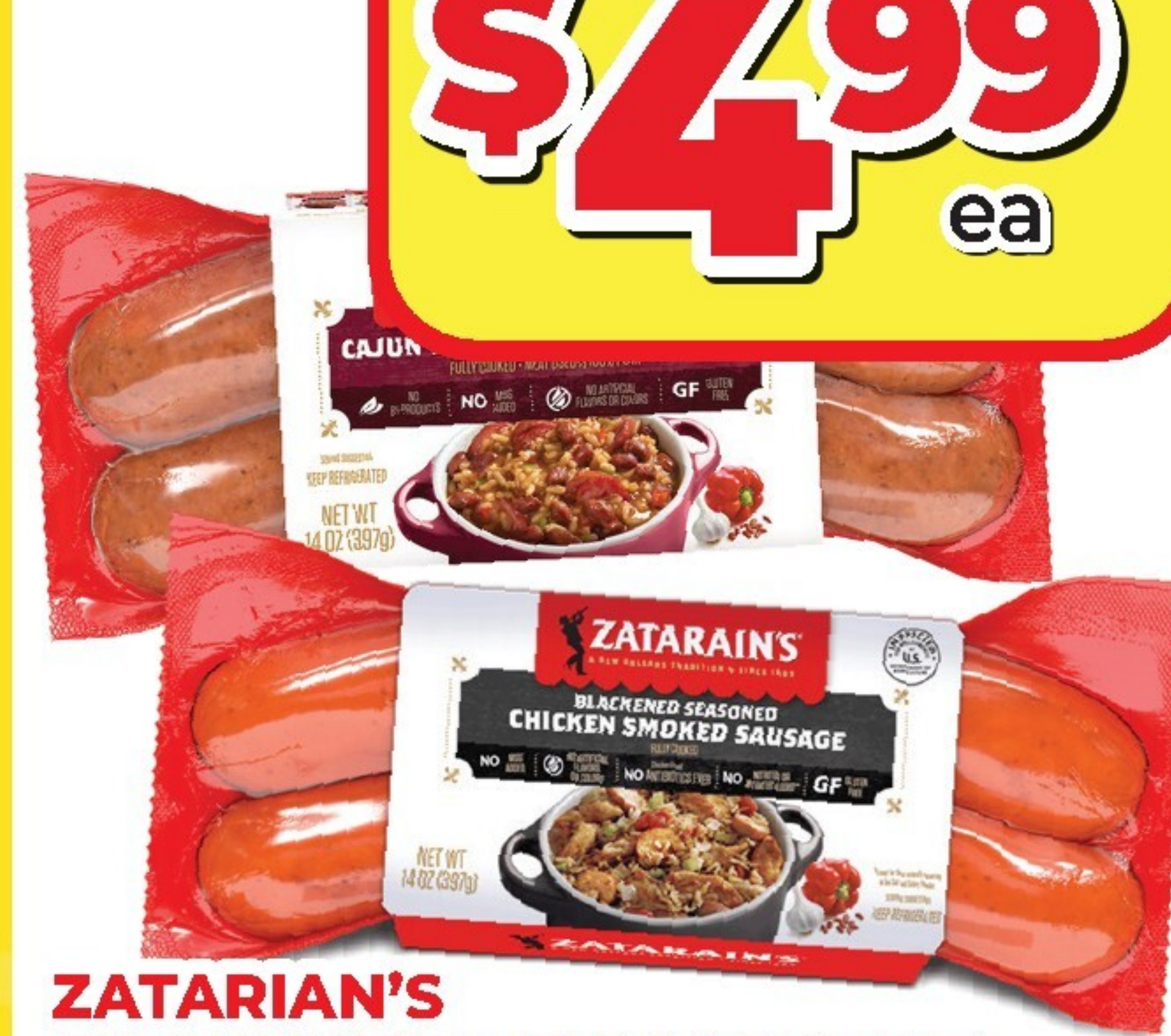
ZATARAIN'S SMOKED SAUSAGE 14 OZ. SELECT VARIETIES