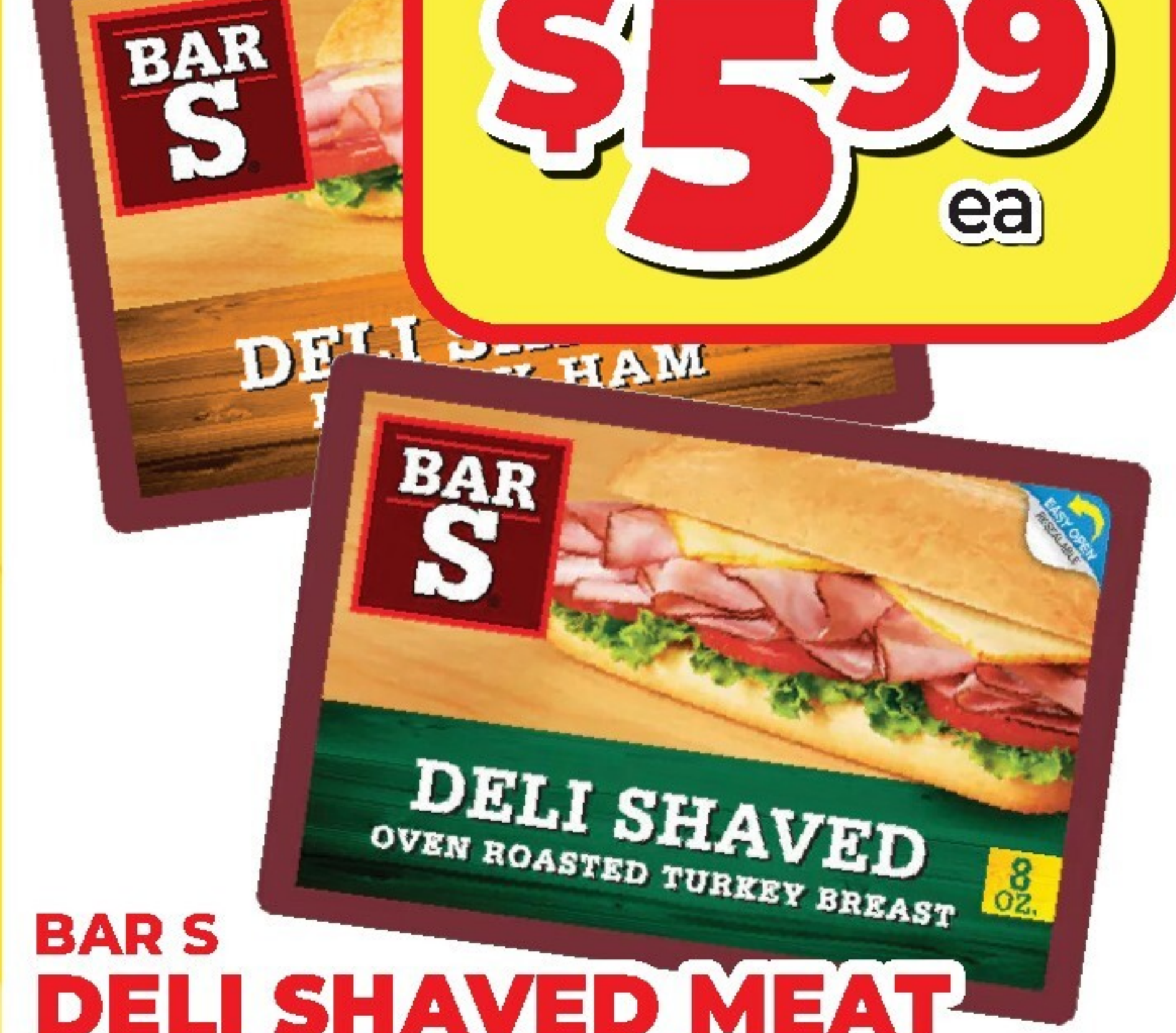
BAR S DELI SHAVED MEAT 14-16 OZ. SELECT VARIETIES