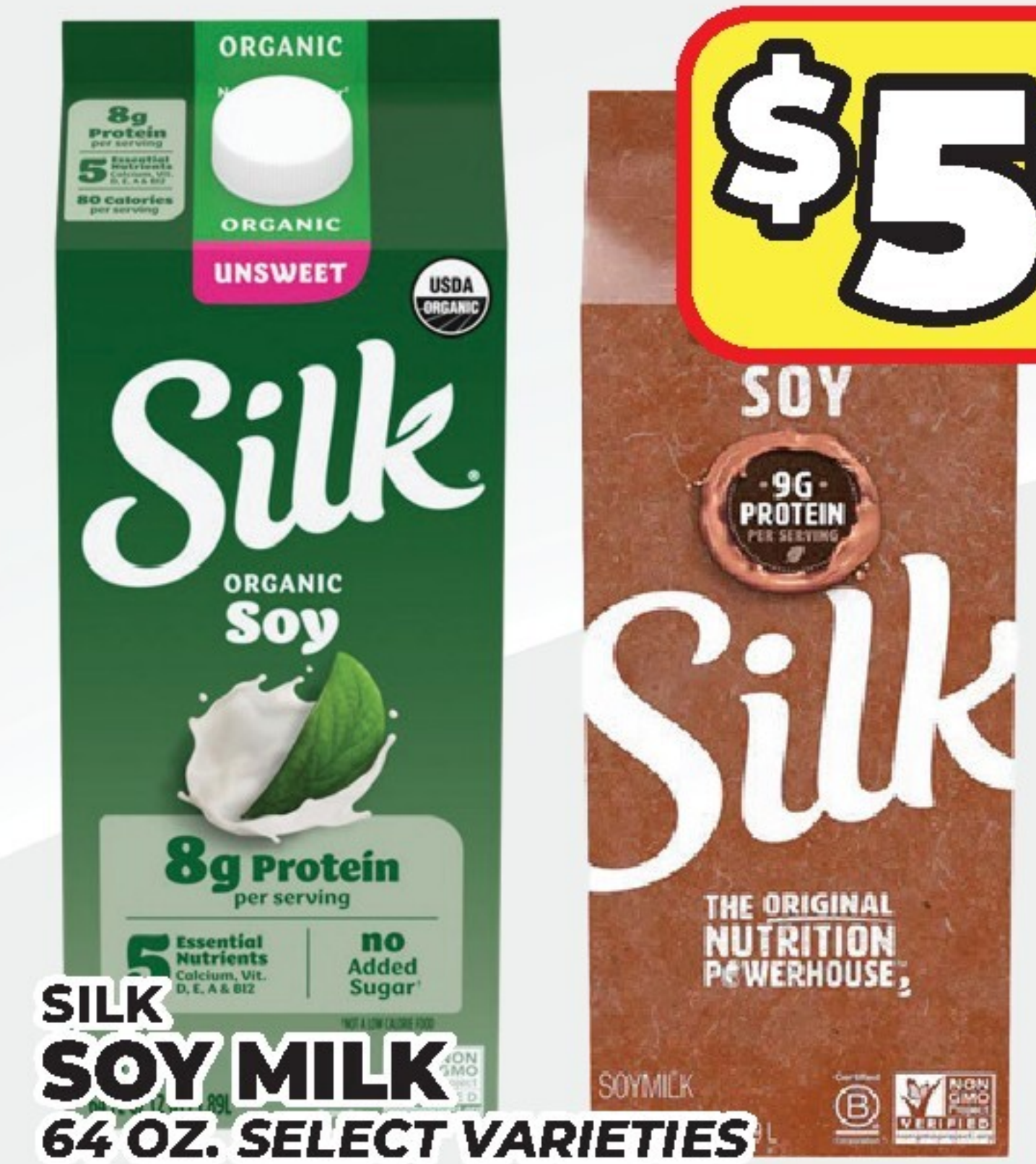
SILK SOY MILK 64 OZ. SELECT VARIETIES