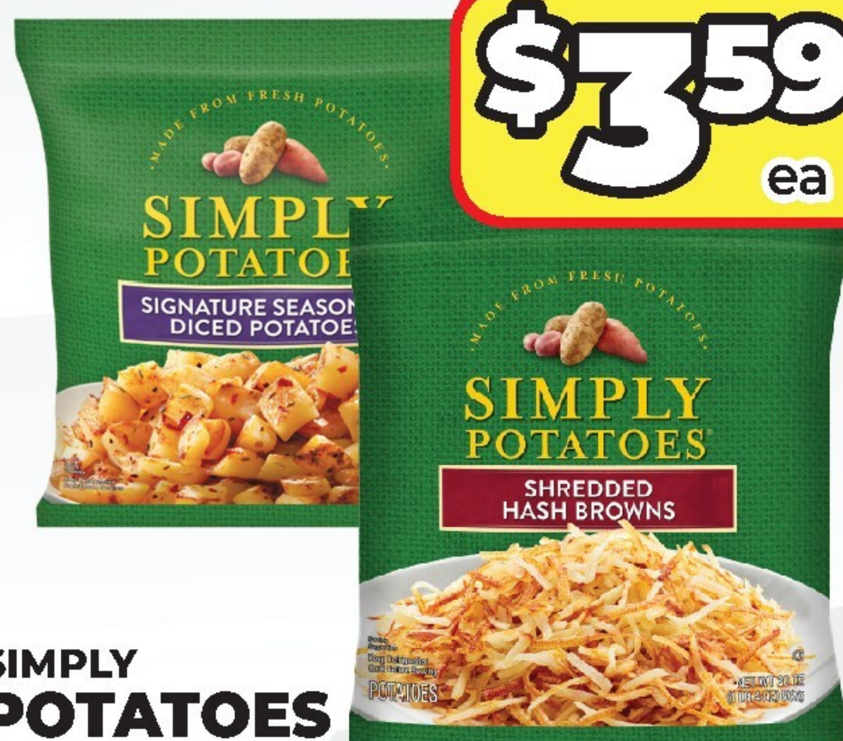
SIMPLY POTATOES 20 OZ. SELECT VARIETIES