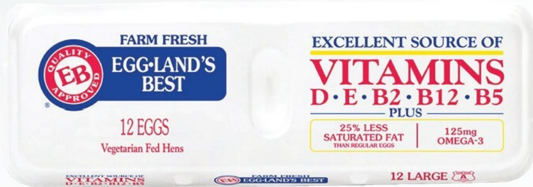
EGGLAND LARGE EGGS 12 CT.