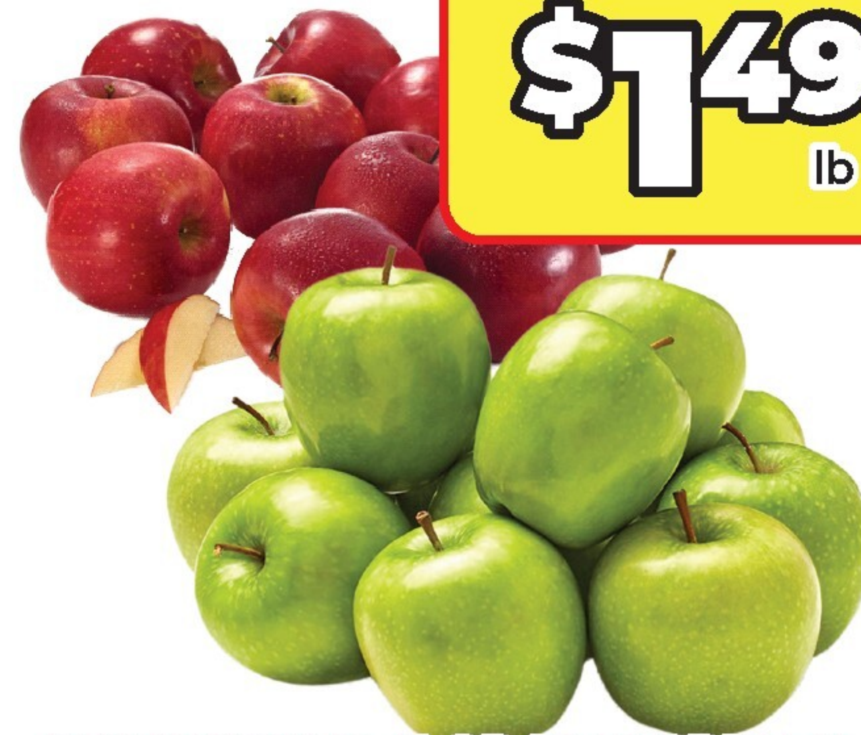
GRANNY SMITH OR FUJI APPLES