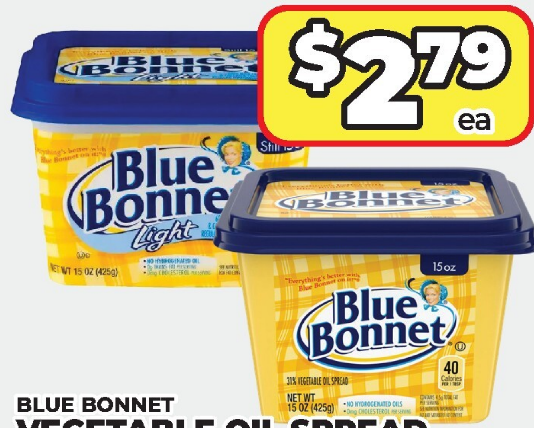
BLUE BONNET VEGETABLE OIL SPREAD 15 OZ. SELECT VARIETIES