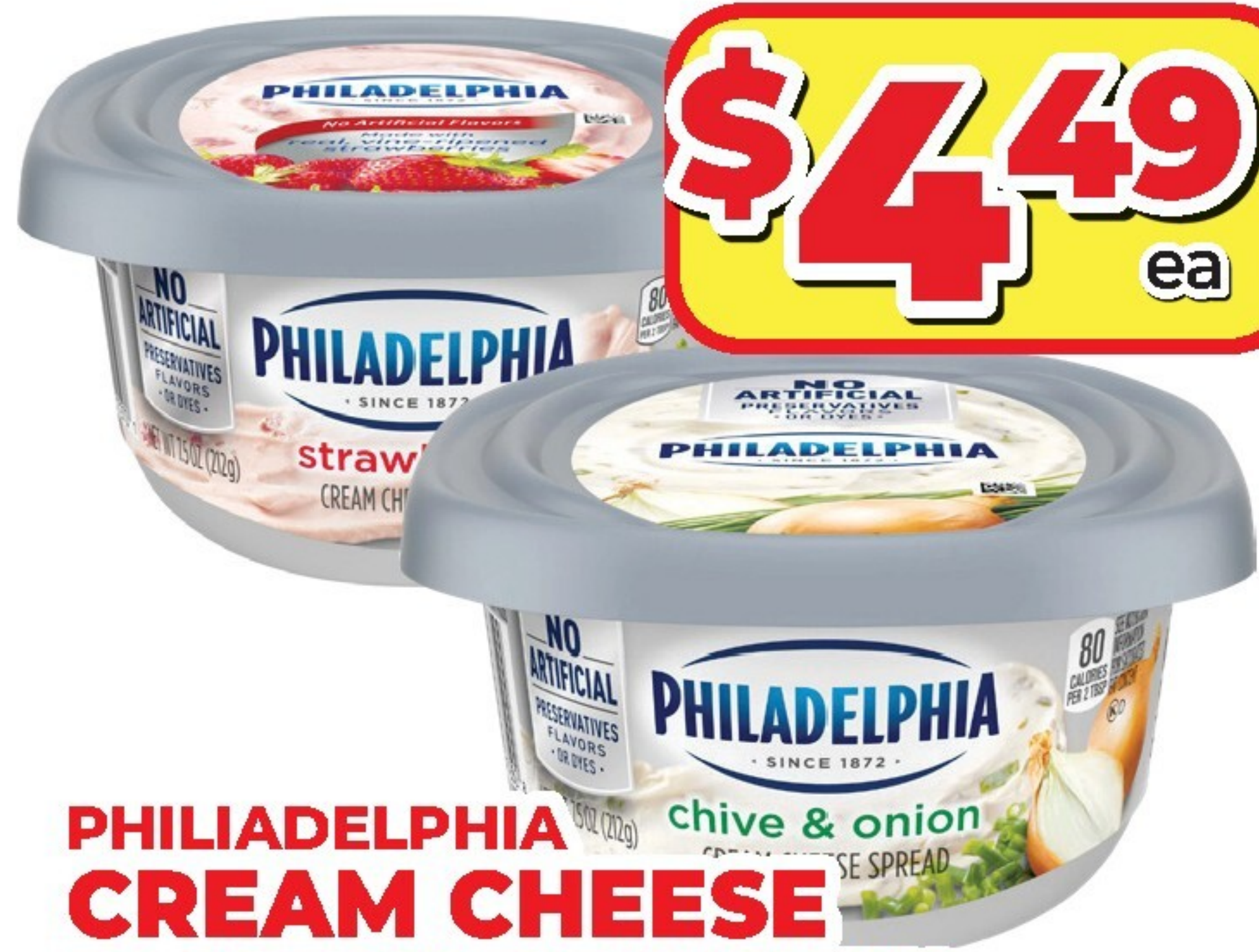
PHILADELPHIA CREAM CHEESE 7.5-8 OZ. SELECT VARIETIES