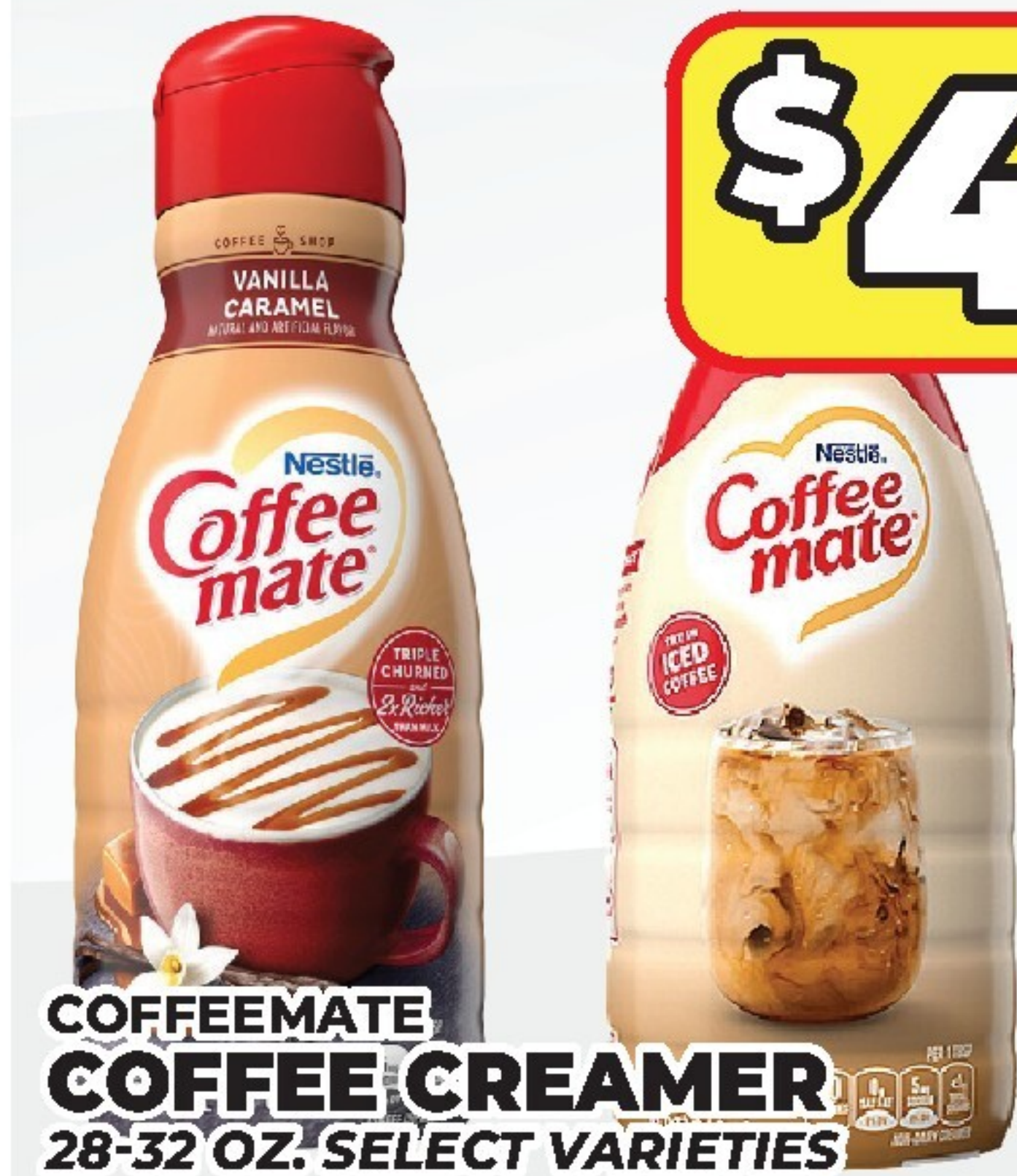
COFFEEMATE COFFEE CREAMER 28-32 OZ. SELECT VARIETIES