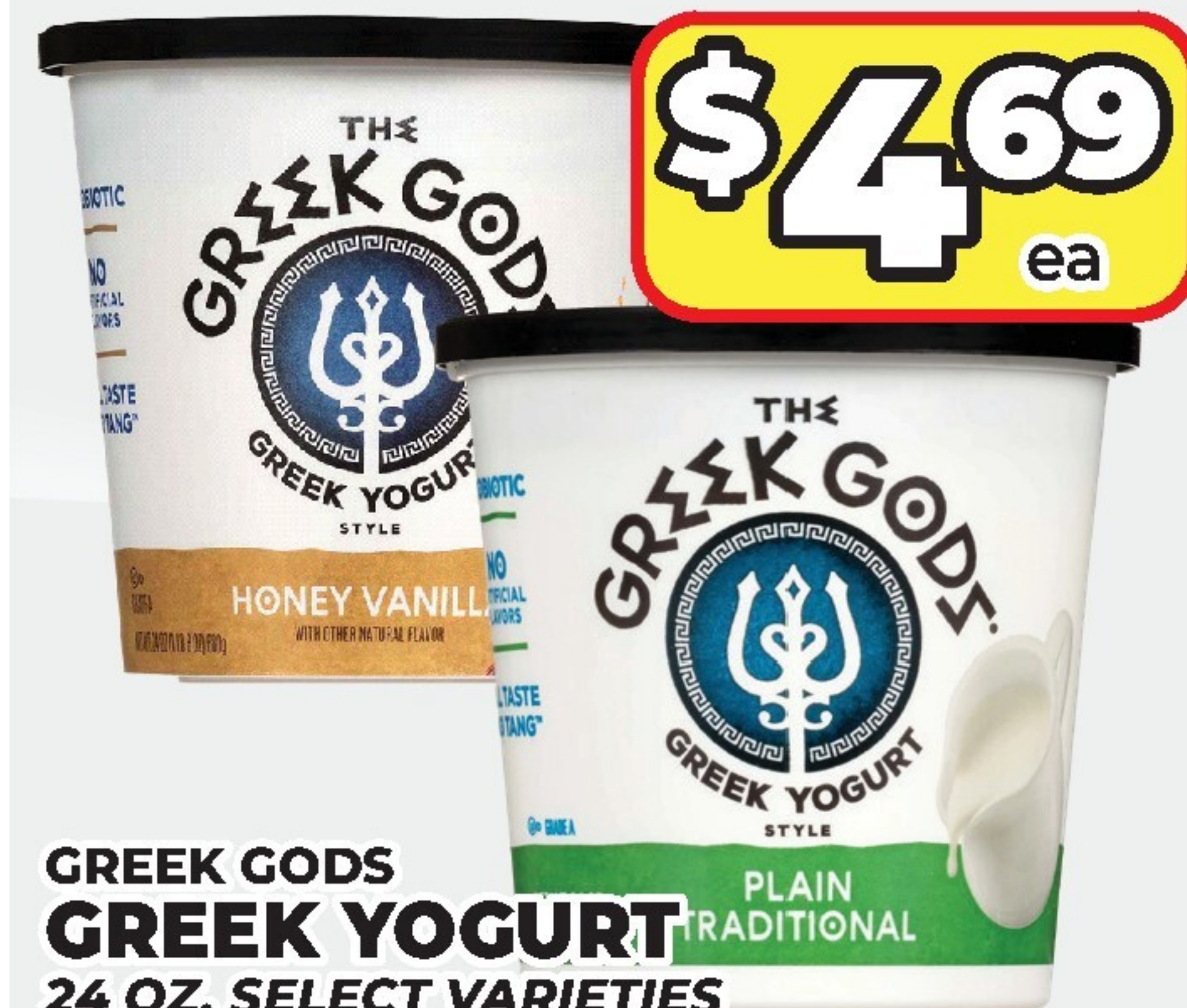
GREEK GODS GREEK YOGURT 24 OZ. SELECT VARIETIES