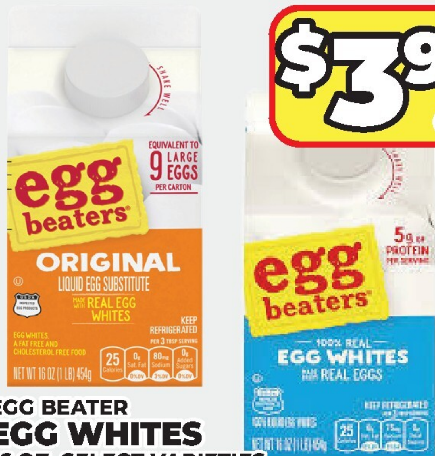
EGG BEATER EGG WHITES 16 OZ. SELECT VARIETIES