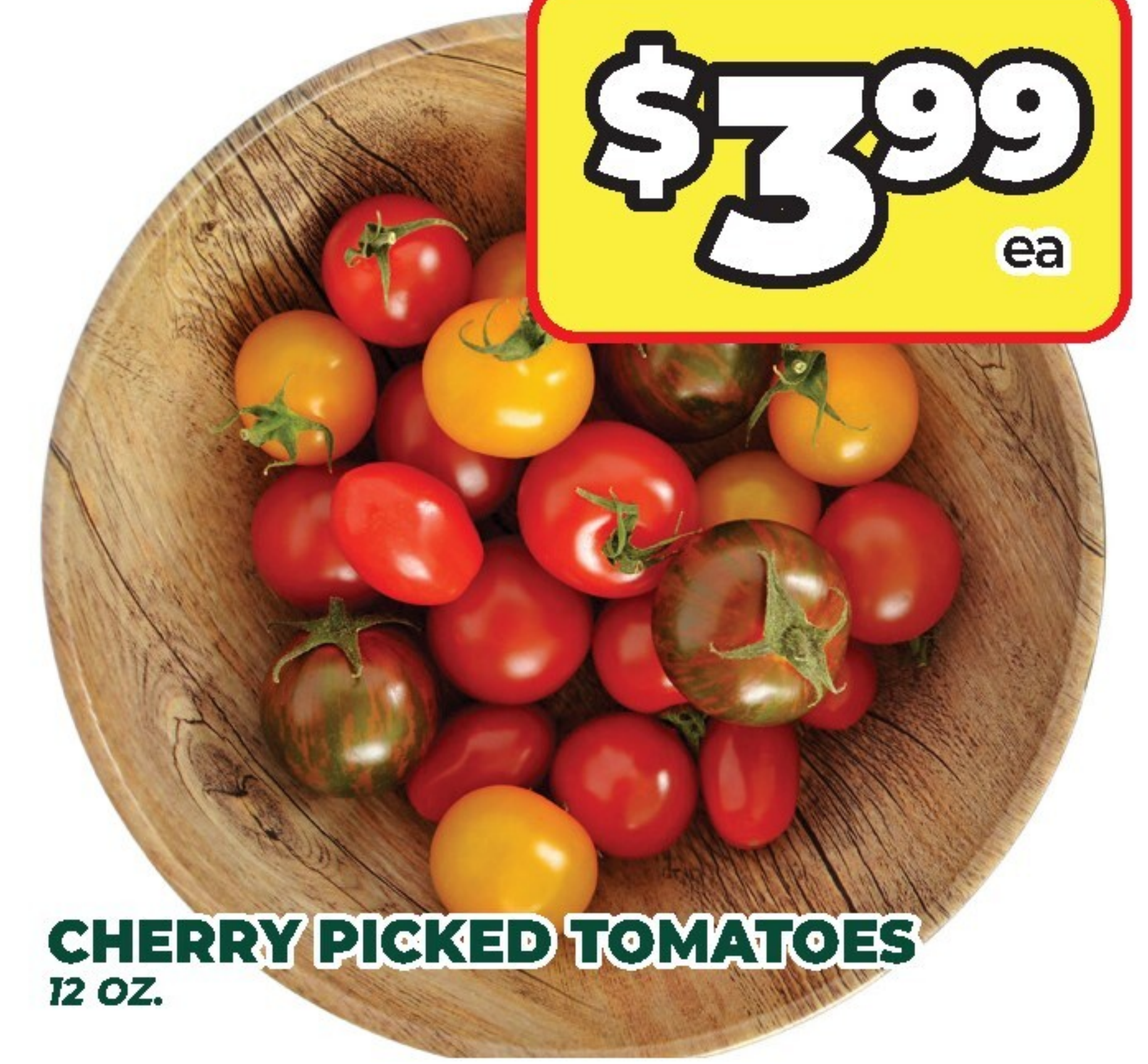
CHERRY PICKED TOMATOES 12 OZ.