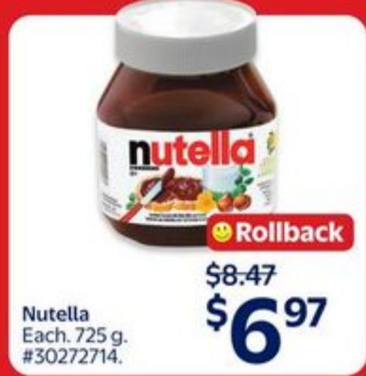
Nutella Each. 725 g. #30272714.