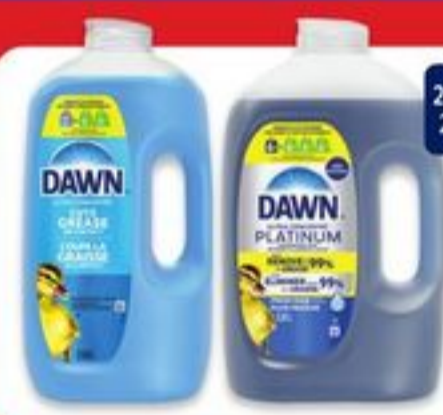
2.01L - 2.64L Dawn dish soap Each. Selected varieties. #31110968.