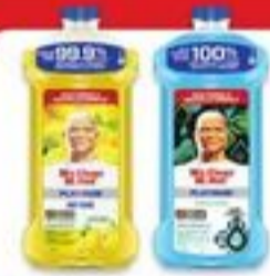
Mr. Clean multisurface cleaner Each. Selected varieties. 1.2 L. #50809383.