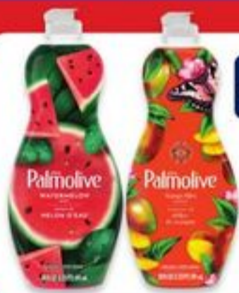
591 mL Palmolive dish soap Each. Selected varieties. #50680326.

Because saving you money is always our priority