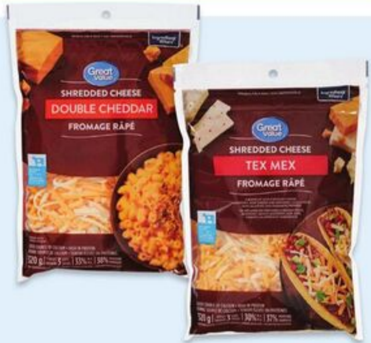
Great Value cheese shreds Each. Selected varieties. 320 g. #50704732.