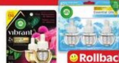
Air Wick refills 3-pack or Vibrant refills 2-pack Each. #50841949.