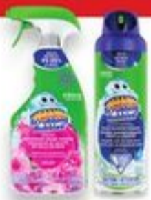
Scrubbing Bubbles foam cleaner 385 g - 623 g or spray 946 mL Each. Selected varieties. #1345937.