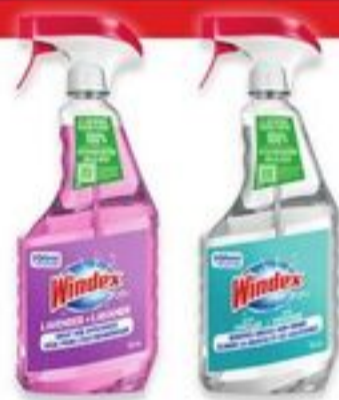
Windex trigger sprays Each. Selected varieties. 765 mL. #50838462.