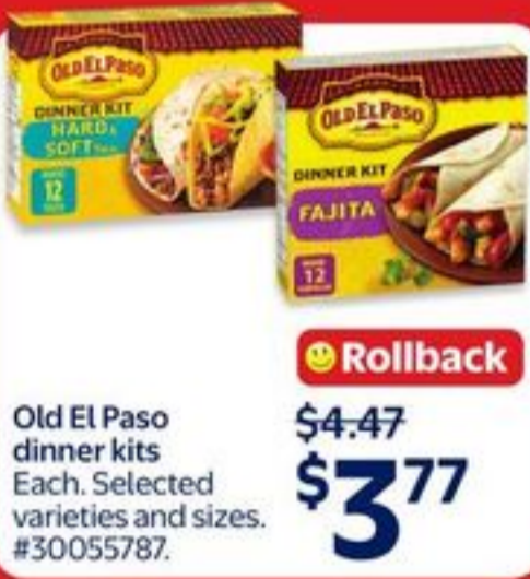
Old El Paso dinner kits Each. Selected varieties and sizes. #30055787.