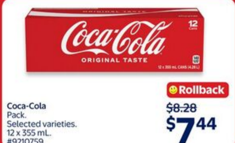
Coca-Cola Pack. Selected varieties. 12 x 355 mL. #9210759.