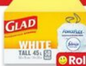
Glad white kitchen garbage bags Each. 50s. #30251906.