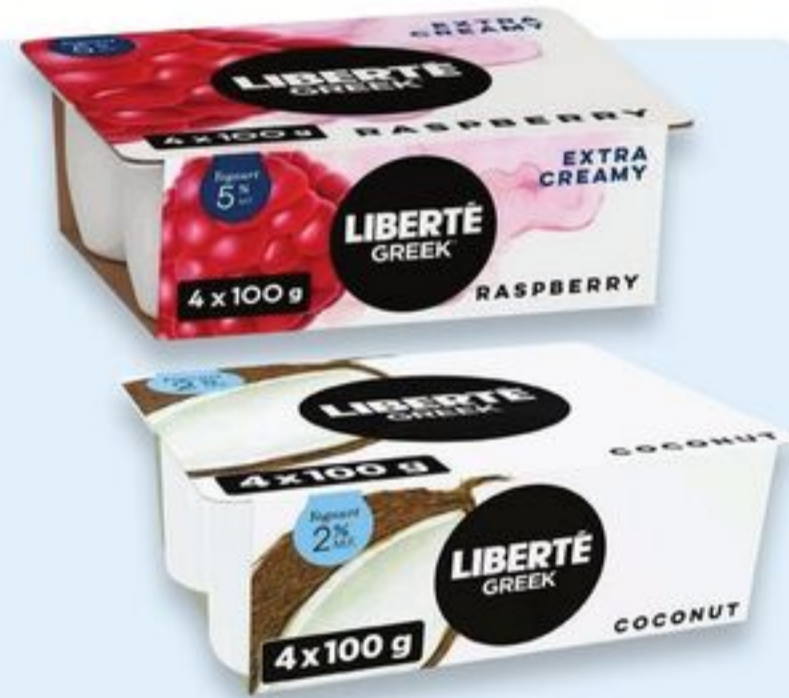
Liberté Greek yogurt Pack. Selected varieties. 4 x 100 g. #50434395.