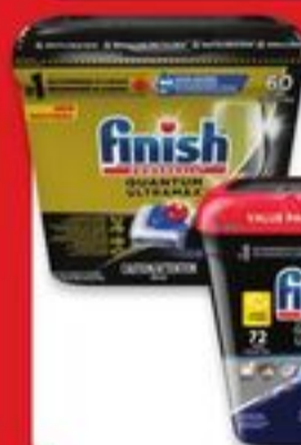
Finish Quantum Ultramax 60s or Ultimate 72s Each. Selected varieties. #50415402.