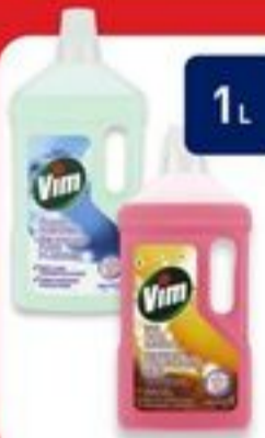
1 L Vim cleaners Each. Selected varieties. #50735200.