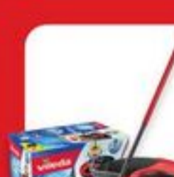
Vileda EasyWring spin mop and bucket system Each. #30886564.