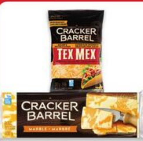
Cracker Barrel cheese block 400 g or shreds 320 g Each. Selected varieties. #30795316.