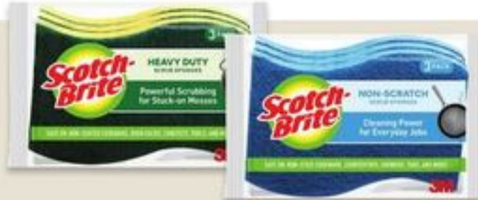
Scotch-Brite sponges 3-pack Pack. #1329177.