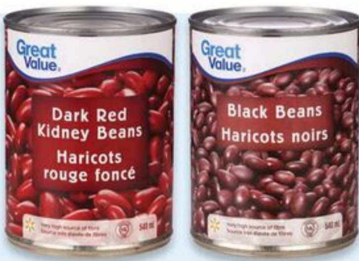
Great Value beans Each. Selected varieties. 540 mL. #9206427.