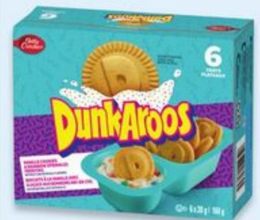
DunkAroos 6-pack Pack. 168 g. #31143256.