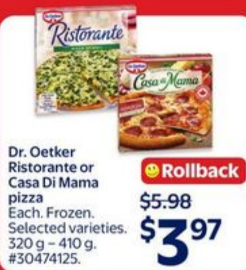
Dr. Oetker Ristorante or Casa Di Mama pizza Each. Frozen. Selected varieties. 320 g - 410 g. #30474125.