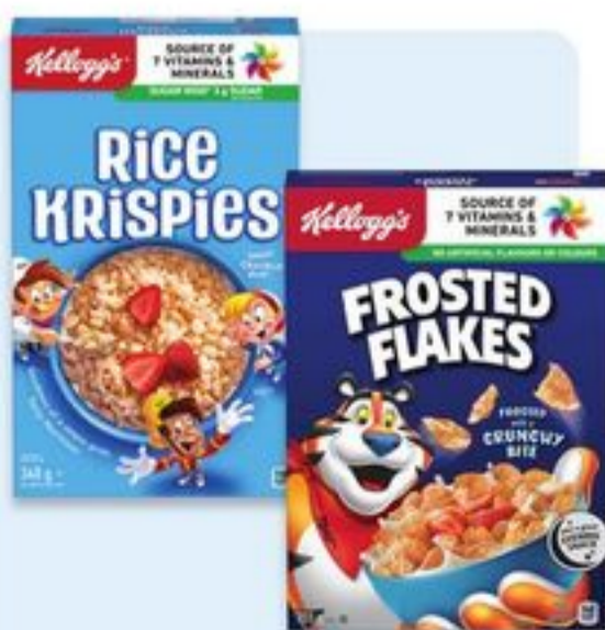
Kellogg's cereal Each. Selected varieties. 340 g – 355 g. #30973860.