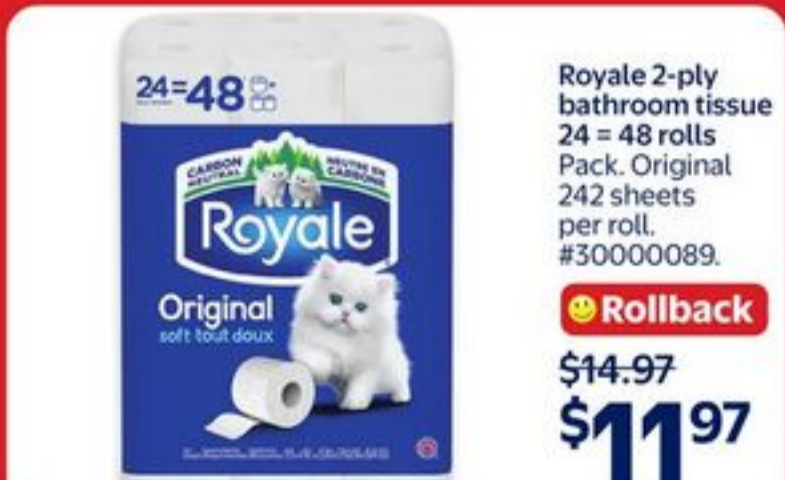
Royale 2-ply bathroom tissue 24 = 48 rolls Pack. Original 242 sheets per roll. #30000089.