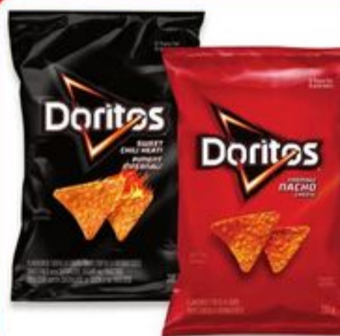
Doritos tortilla chips Each. Selected flavours. 235 g. #31184740.