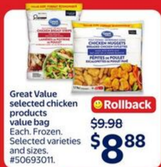
Great Value selected chicken products value bag Each. Frozen. Selected varieties and sizes. #50693011.