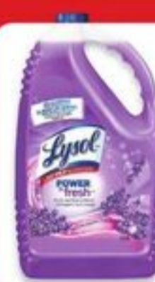
Lysol cleaning pours Each. 4.26 L. #31704900.