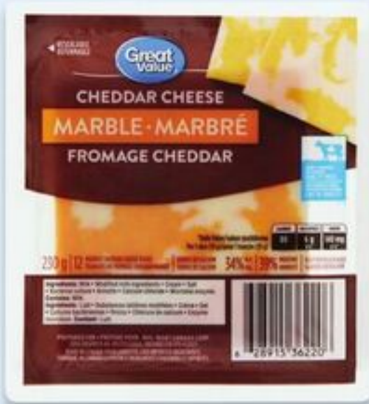
Great Value cheese slices Each. Selected varieties and sizes. #31284511.