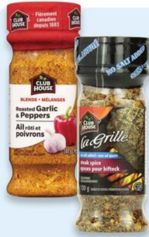
Club House or La Grille spices Each. Selected varieties and sizes. #50559219.