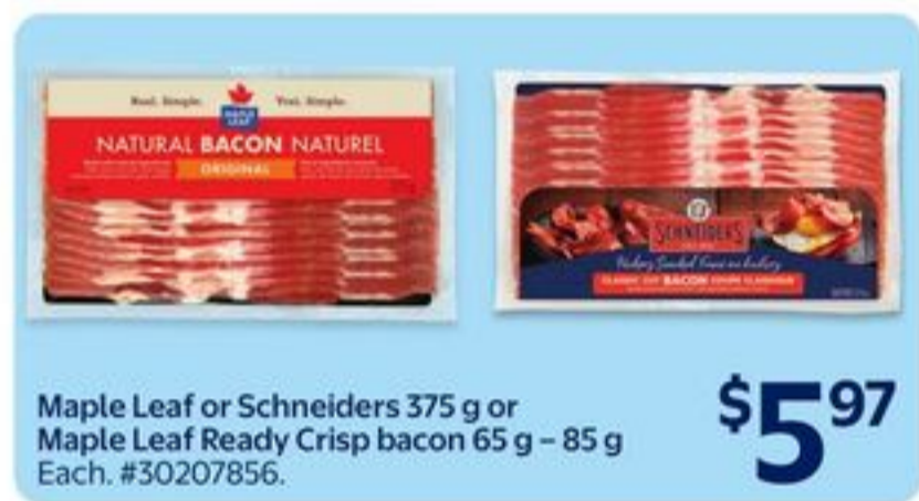
Maple Leaf or Schneiders 375 g or Maple Leaf Ready Crisp bacon 65 g - 85 g Each. #30207856.