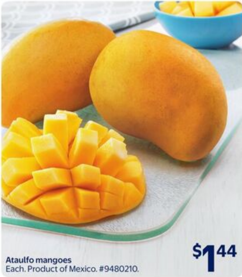
Ataulfo mangoes Each. Product of Mexico. #9480210.