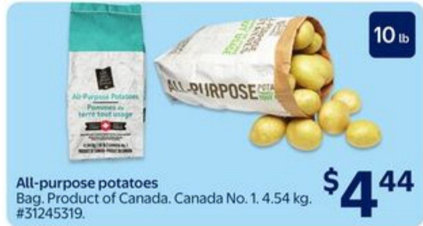
All-purpose potatoes Bag. Product of Canada. Canada No. 1. 4.54 kg. #31245319.