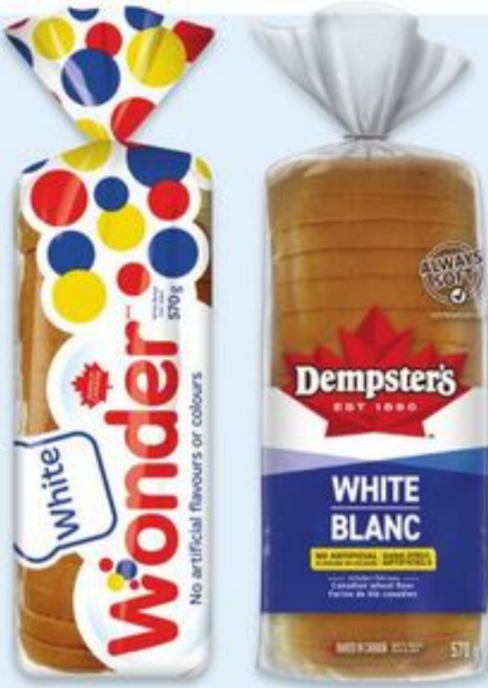
Dempster's or Wonder white or whole wheat bread Each. Selected varieties and sizes. #50323219.