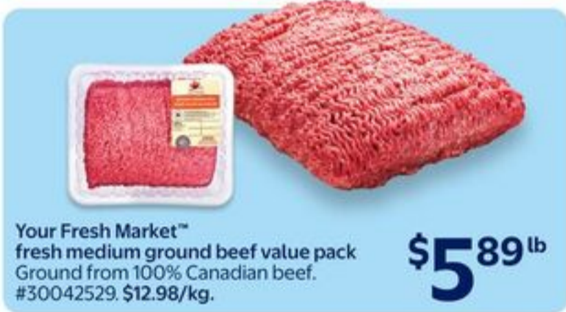
Your Fresh Market™ fresh medium ground beef value pack Ground from 100% Canadian beef. #30042529. $12.98/kg.