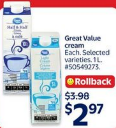
Great Value cream Each. Selected varieties. 1 L. #50549273.