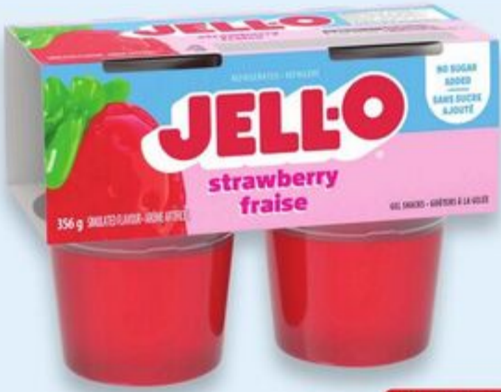
Jell-O snack cups Pack. 4 x 89 g. #30544194.