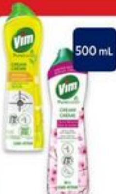
500 mL Vim cleaners Each. Selected varieties. #50735202.