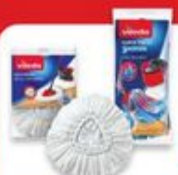
Vileda EasyWring or SuperTwist mop refill Each. #1353511.