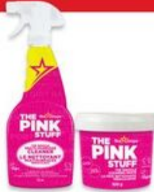
The Pink Stuff cleaners Each. Selected varieties and sizes. #50549500.