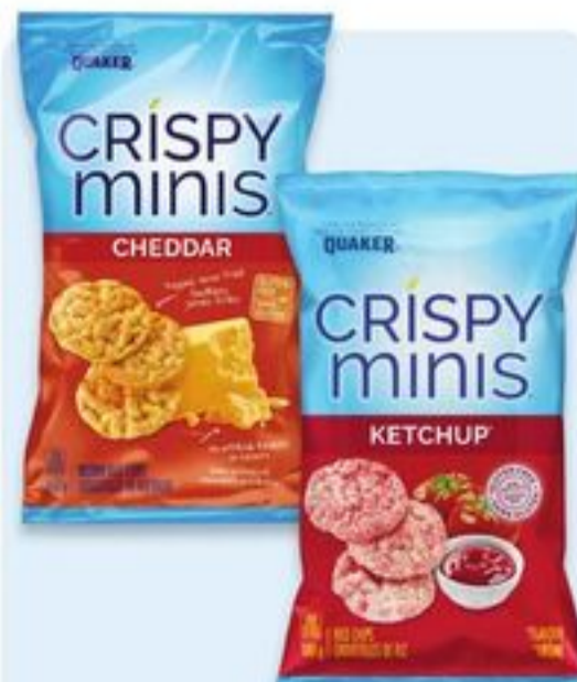
Quaker Crispy Minis Each. Selected flavours. 100 g. #9231722.