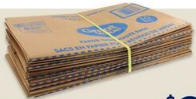
Great Value lawn and leaf bags 10-pack. #50550303.