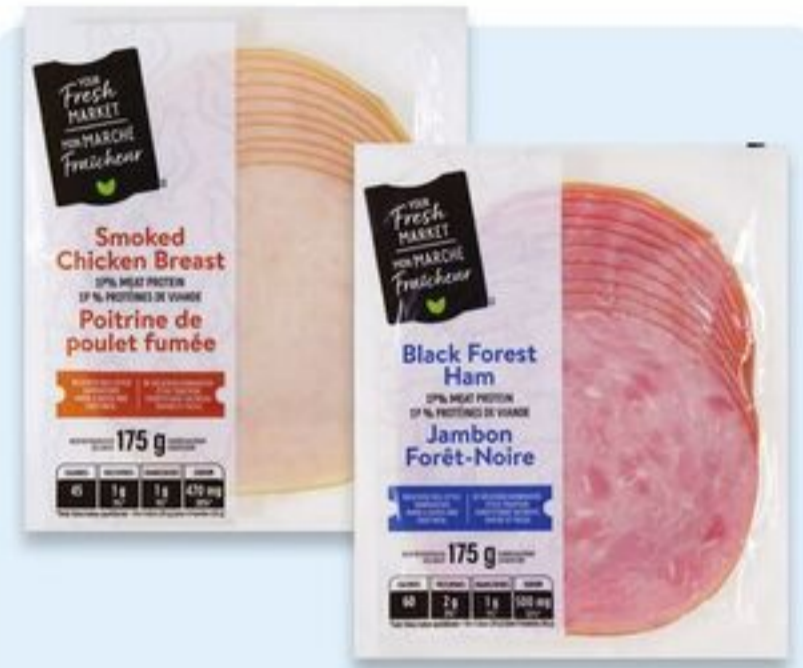
Your Fresh Market™ sliced deli meat Each. Selected varieties. 175 g. #30904140.