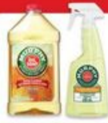
Murphy spray or liquid wood cleaner Each. Selected varieties. #30758315.