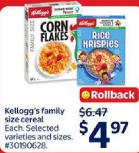
Kellogg's family size cereal Each. Selected varieties and sizes. #30190628.