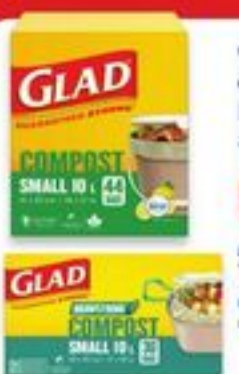
Glad compost bags Each. 30s - 44s. #30301455.