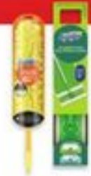
Swiffer Duster 6' starter kit or Sweep and Mop starter kit Each. #50569657.