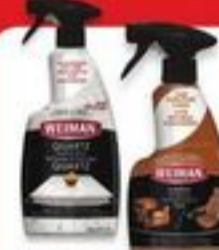
Weiman specialty cleaners Each. 355 mL - 710 mL. #30361782.