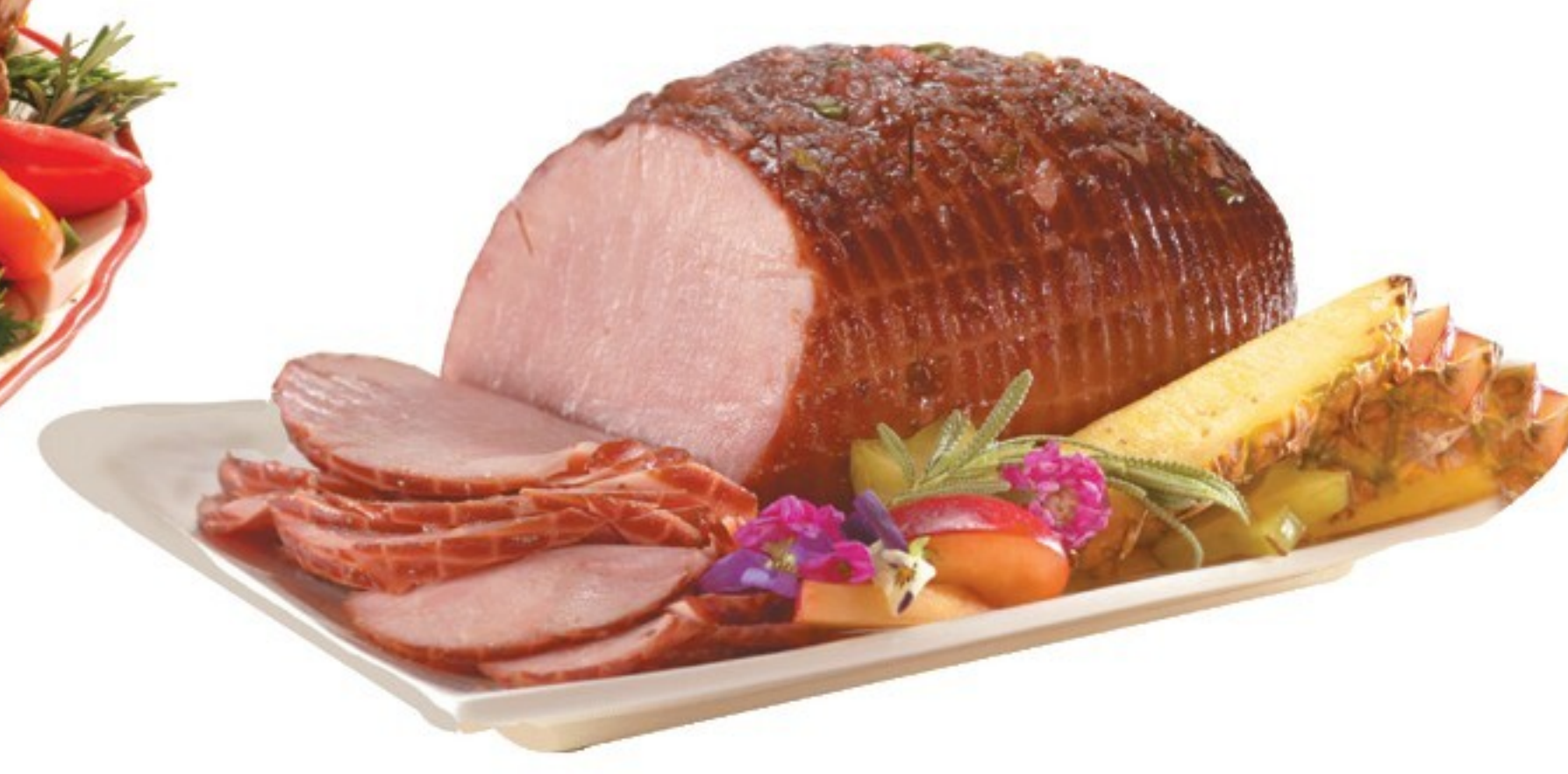
Burgers' Whole Country Hams