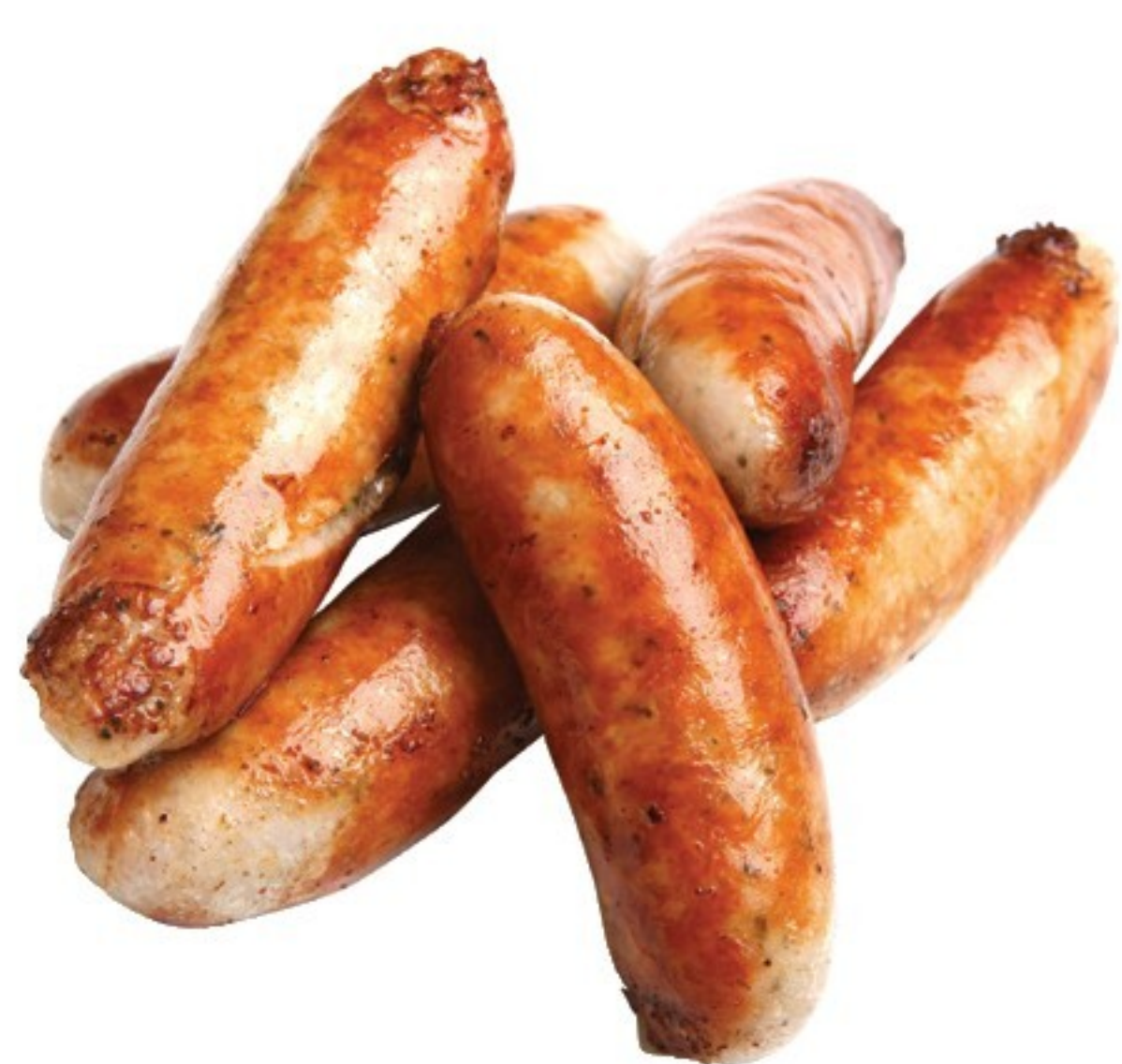
Schulte's Fresh Rope Sausage