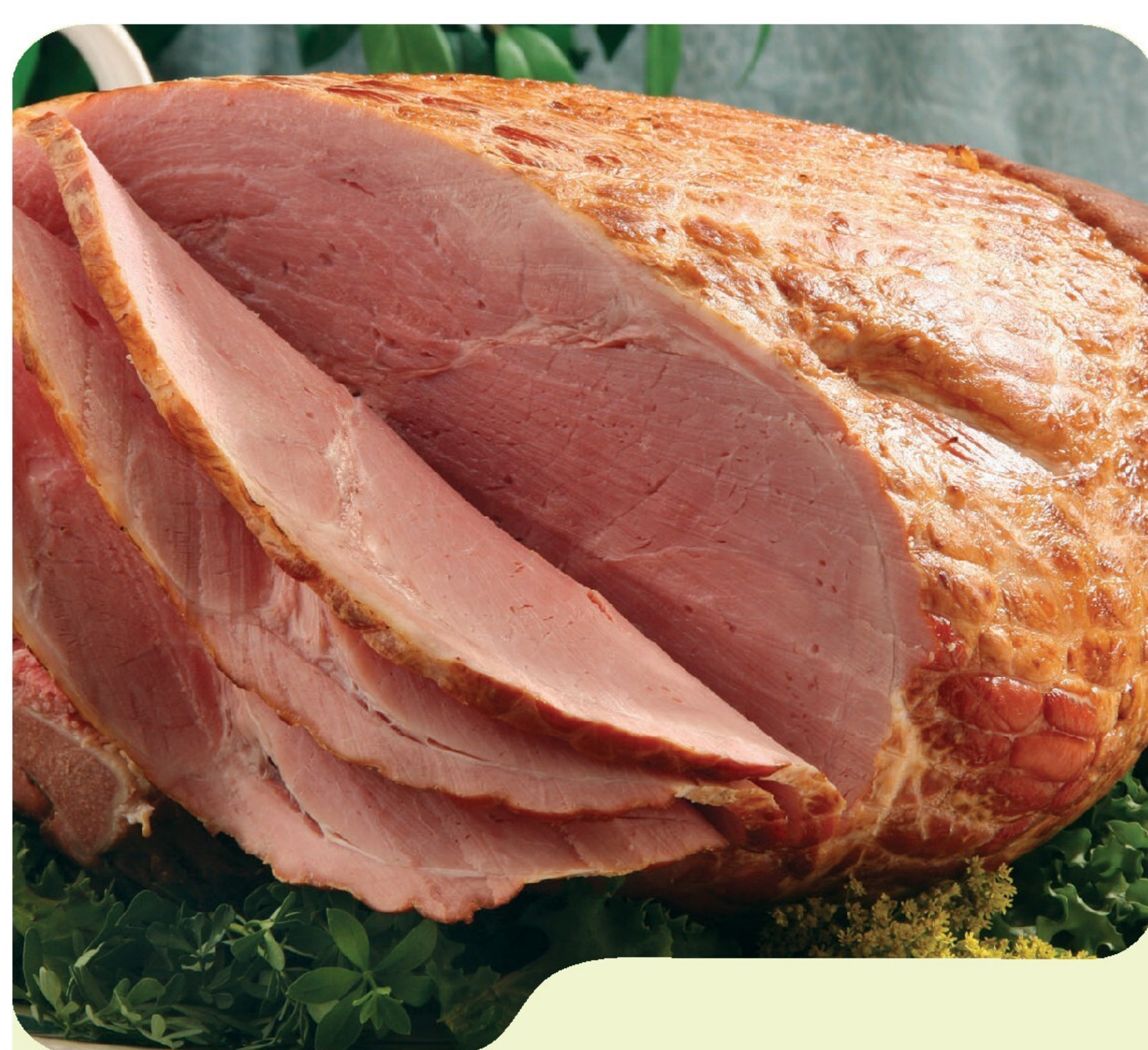
Frick's or Cook's Whole Bone-in Hams