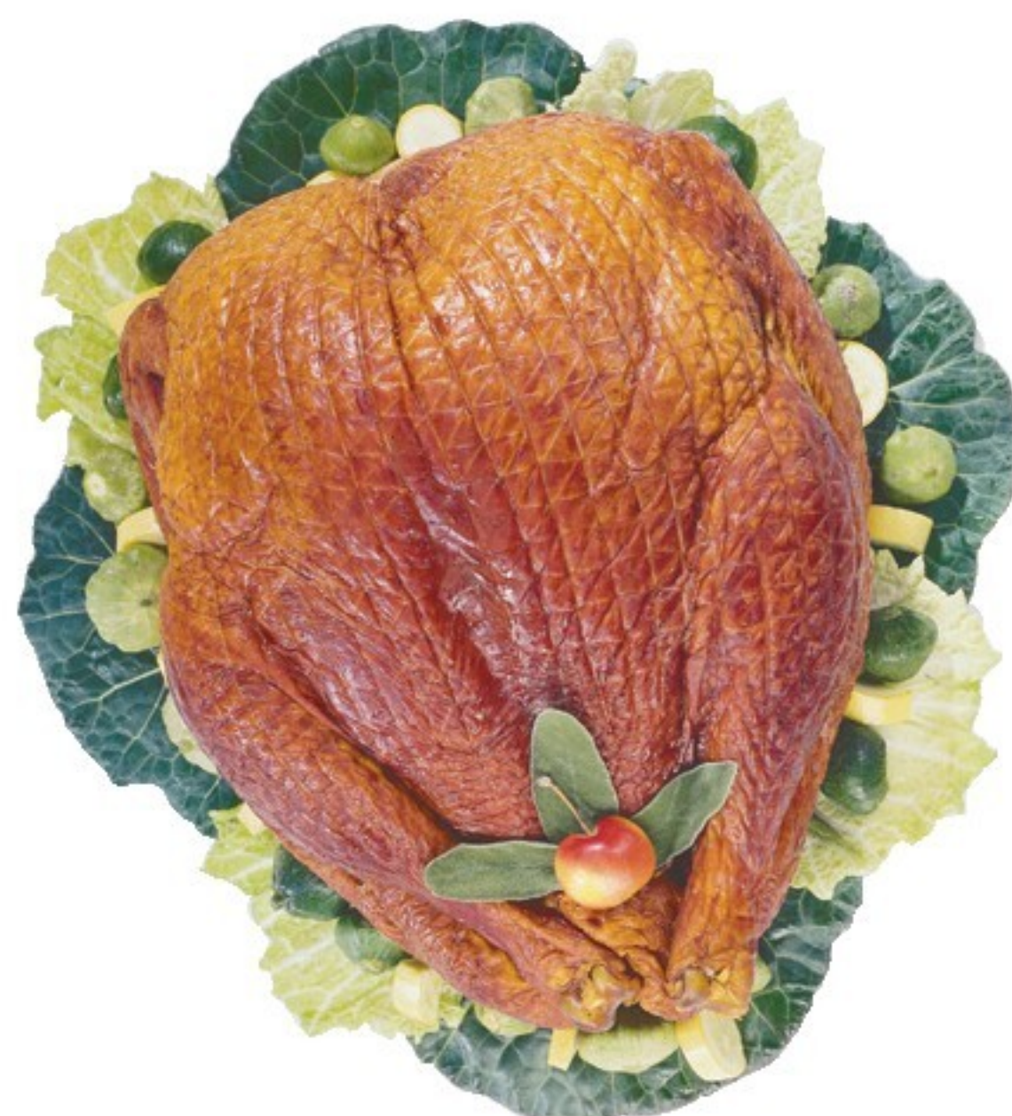
Butterball or Burger's Whole Smoked Turkeys