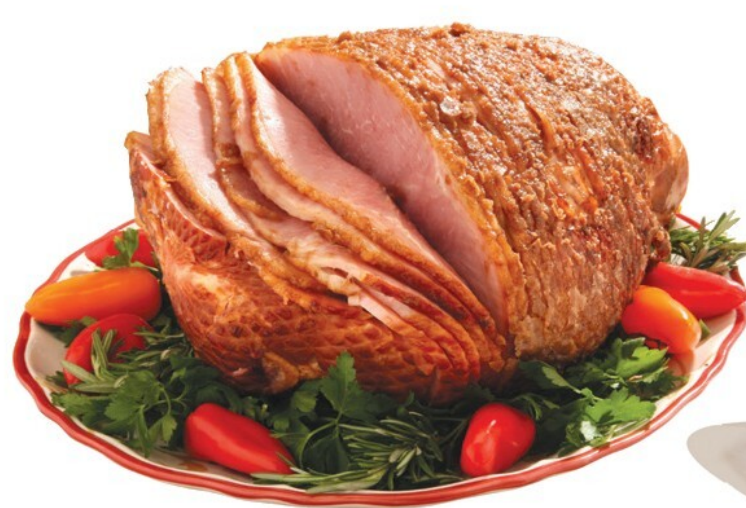
Best Choice Spiral Sliced Bone-In Hams