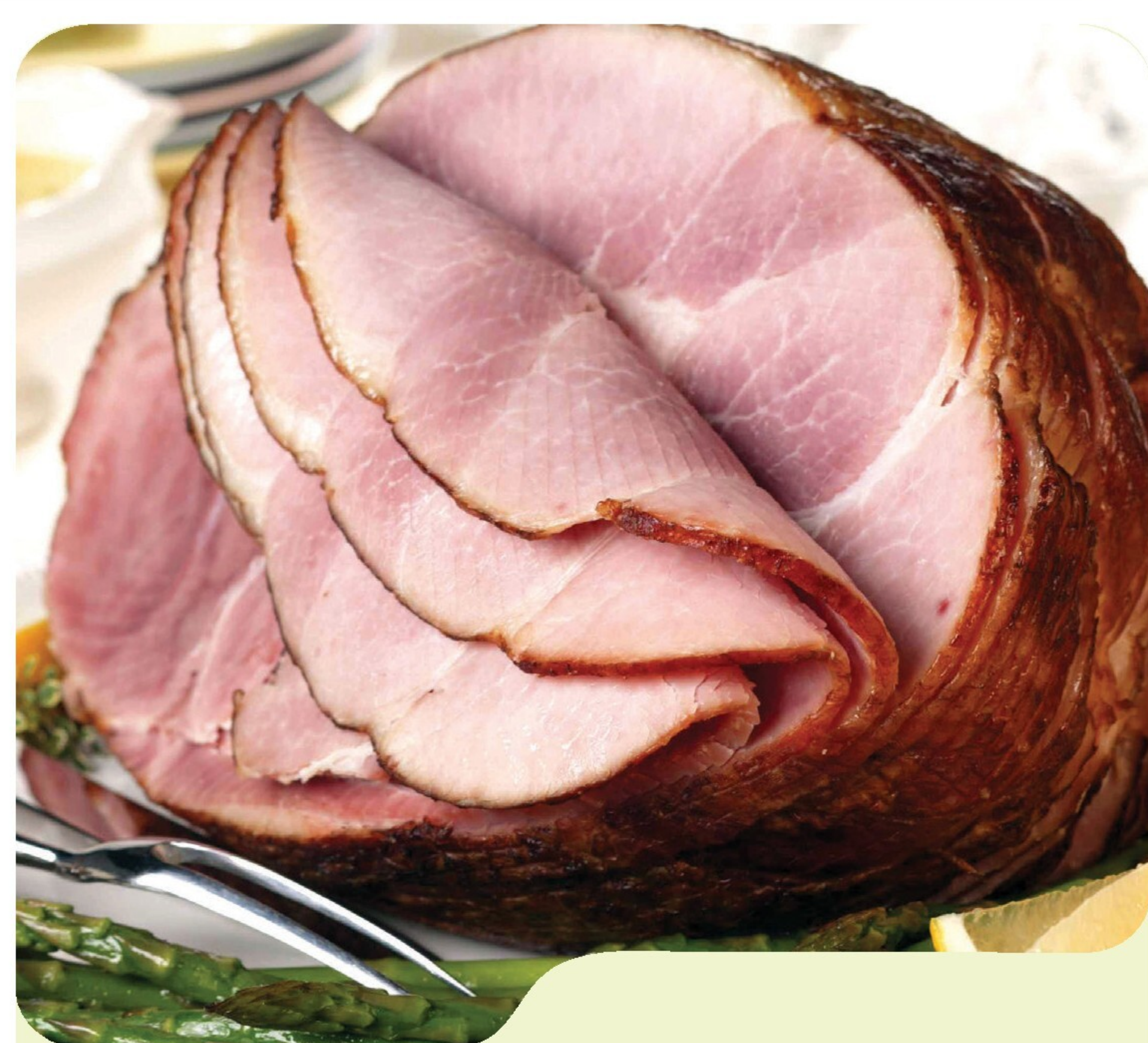
Frick's, Cook's, Sugardale Shank Portion Bone-in Ham