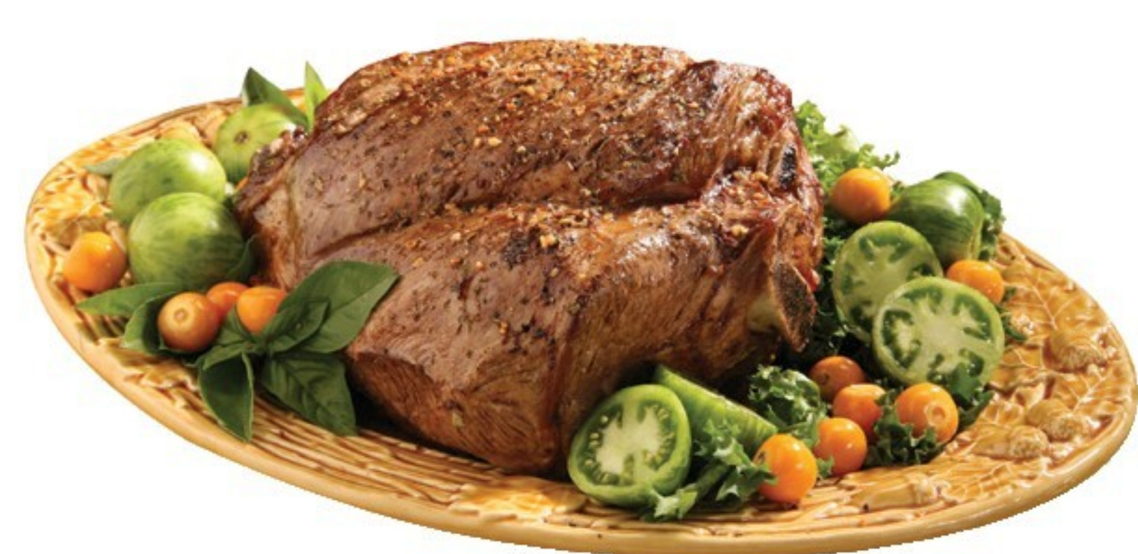
Whole or Half Bone-In Lamb Legs