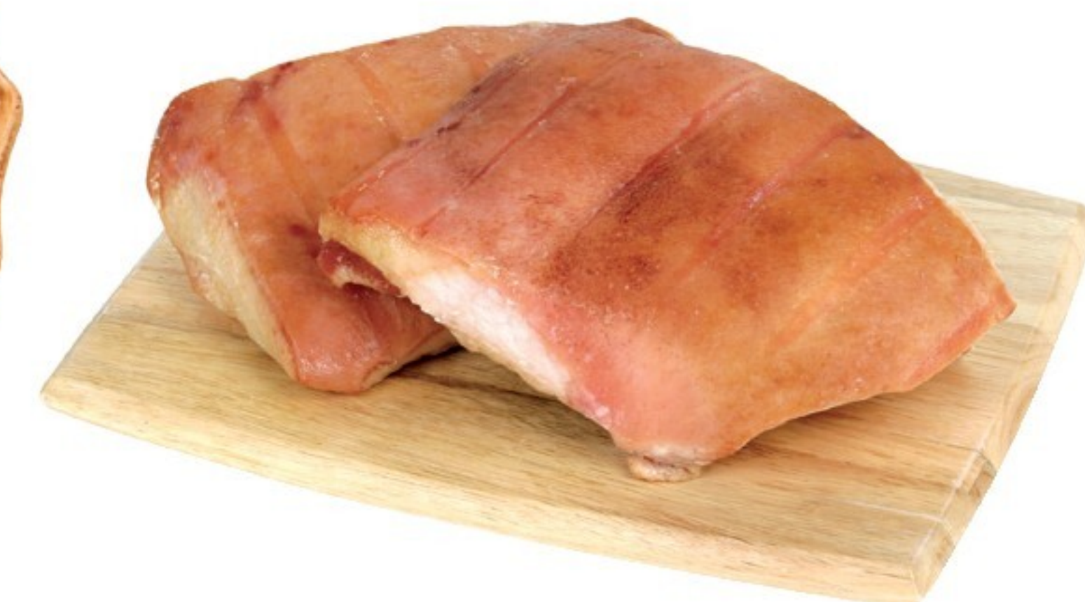
Burgers' Sliced Jowl