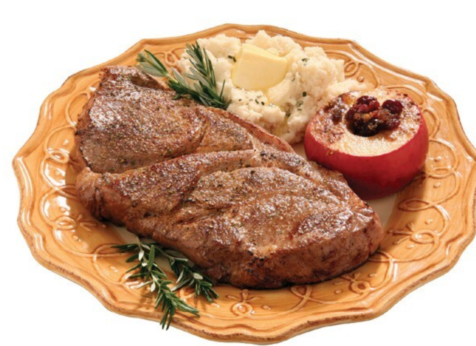
Fresh Cut Pork Steaks Family Pack