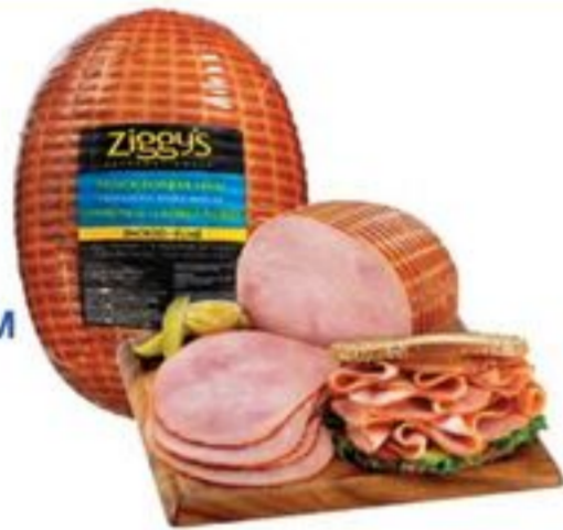
ZIGGY'S® SMOKED BLACK FOREST HAM EXTRA LEAN WHOLE PIECE VARIABLE WEIGHT 20323392_KG