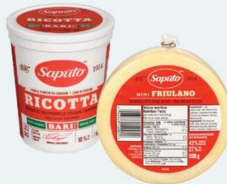
BARI RICOTTA 1 KG OR SAPUTO MINI FRIULANO CHEESE 500 G 20136427_EA/20708981_EA