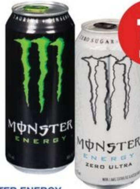
MONSTER ENERGY ORIGINAL OR ZERO ULTRA 12 X 473 ML 20938249_C12/20938521_C12