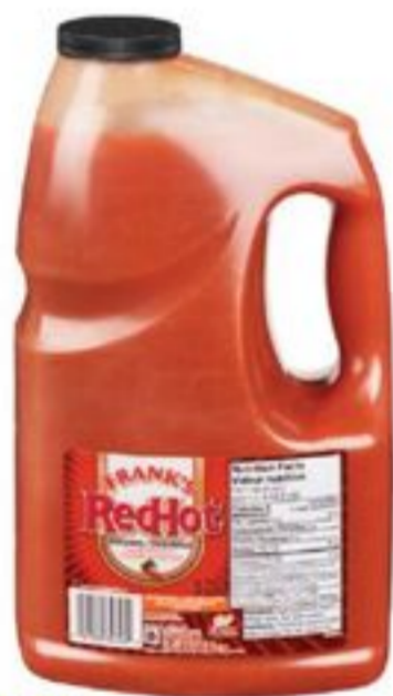
FRANK'S ORIGINAL RED HOT SAUCE 3.78 L 20130877_EA