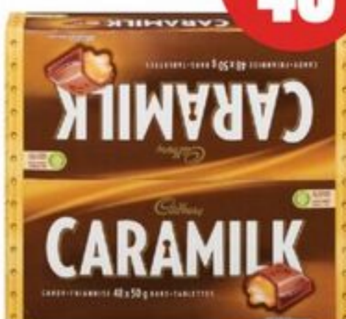
CARAMILK SINGLE BARS 48'S 20691851_C48