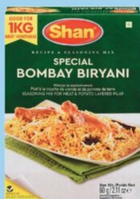
SHAN SPICE MIXES SELECTED VARIETIES 50-65 G 20323215002_EA