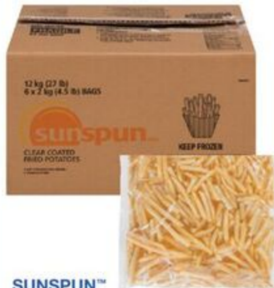
SUNSPUN™ CLEAR COATED FRIED POTATOES 12 KG 6 X 2 KG 20905111_EA