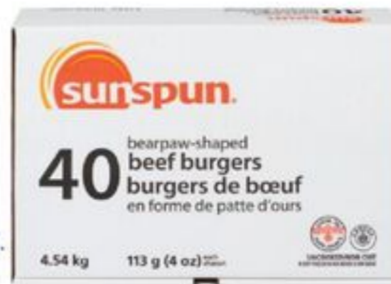
SUNSPUN™ BEEF BURGERS 4.54 KG, 40 X 4 OZ. FROZEN 20150627_EA