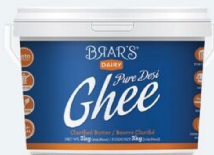
BRAR'S DESI GHEE 3 KG 21520900_EA