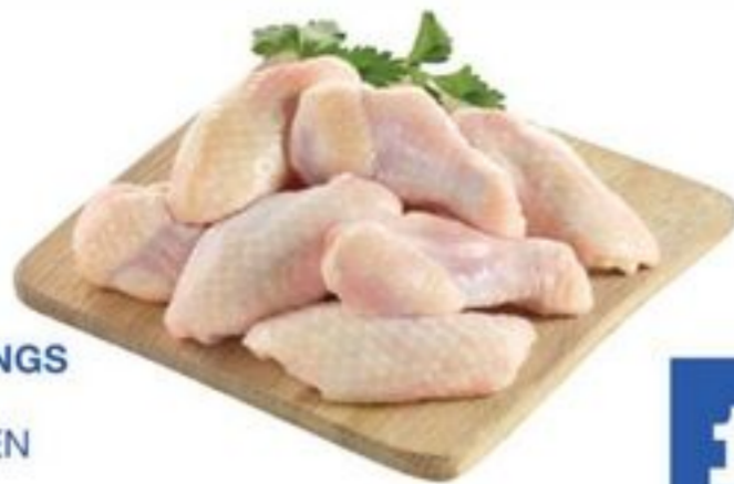
CHILEAN CHICKEN WINGS 6-8'S PER LB 20 KG, FROZEN 21734660_C04