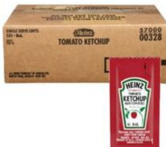
HEINZ KETCHUP PORTIONS 500'S 20000699_EA