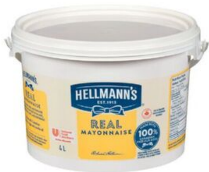
HELLMANN'S MAYONNAISE 4 L 20021711_EA