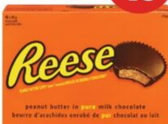
REESE'S PEANUT BUTTER CUP SINGLE BARS 48'S 20582012_C48