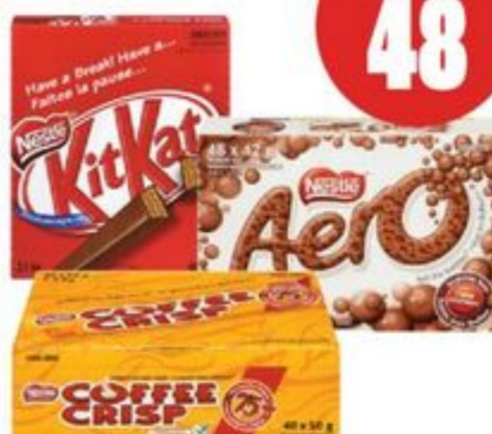
NESTLÉ COFFEE CRISP, KIT KAT OR AERO MILK CHOCOLATE SINGLE BARS 48'S 20019964_C48 20066954_C48 20306258_C48