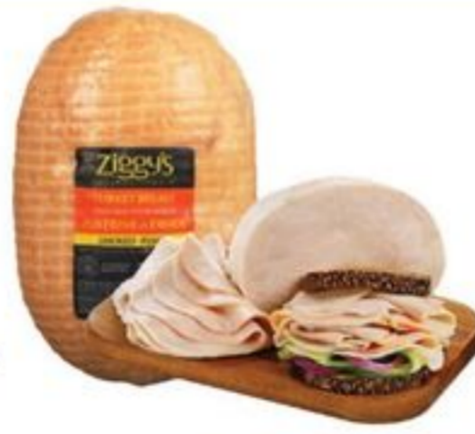
ZIGGY'S® SMOKED TURKEY BREAST EXTRA LEAN WHOLE PIECE VARIABLE WEIGHT 20324673_KG