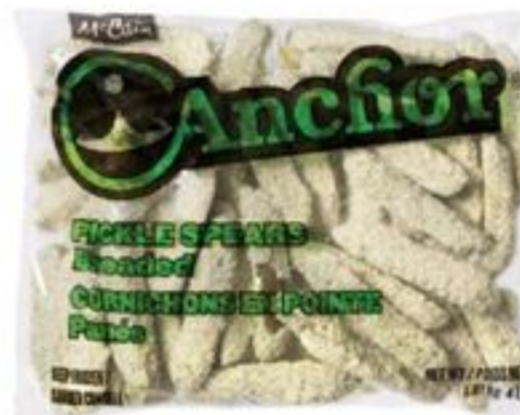
MCCAIN BATTERED PICKLES 1.81 KG 20993519_EA