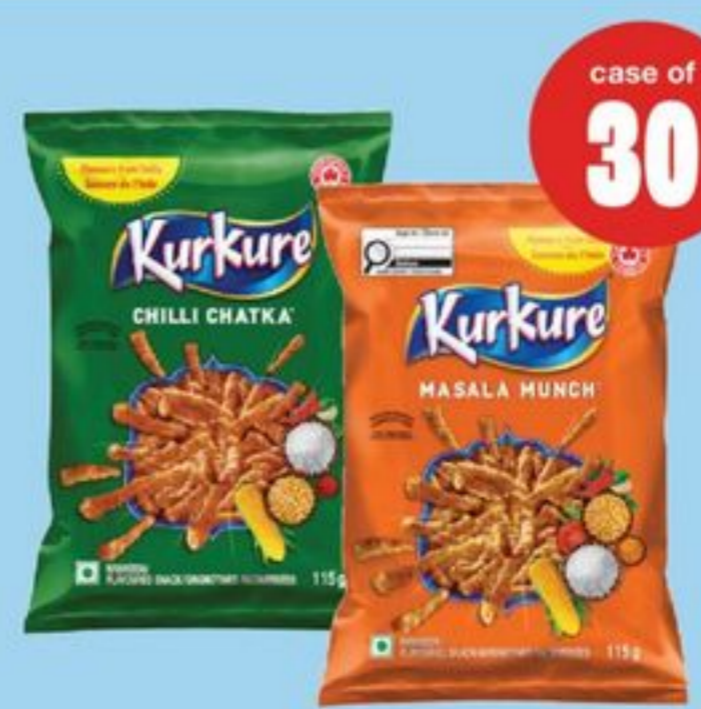
KURKURE FLAVOURED SNACKS SELECTED VARIETIES 30 X 115 G 20659742_C30/21361077_C30