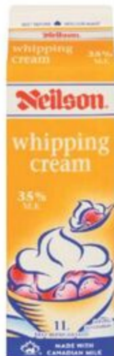
NEILSON WHIPPING CREAM 35% 1 L 20101039_EA