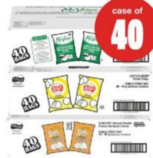
MISS VICKIE'S, LAY'S CLASSIC OR SUNCHIPS HARVEST CHEDDAR CHIPS 40 G X 40'S 21588060_C40 20067191001_EA 20076447001_EA