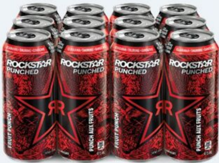
ROCKSTAR ENERGY DRINKS SELECTED VARIETIES 12 X 473 ML 20368415003_C12