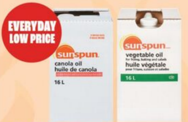
SUNSPUN™ CANOLA OR VEGETABLE OIL SELECTED VARIETIES, 16 L 20024719_EA/20126146_EA