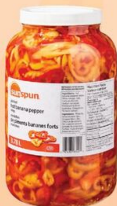
SUNSPUN™ HOT BANANA PEPPERS 3.78 L 21291232_EA