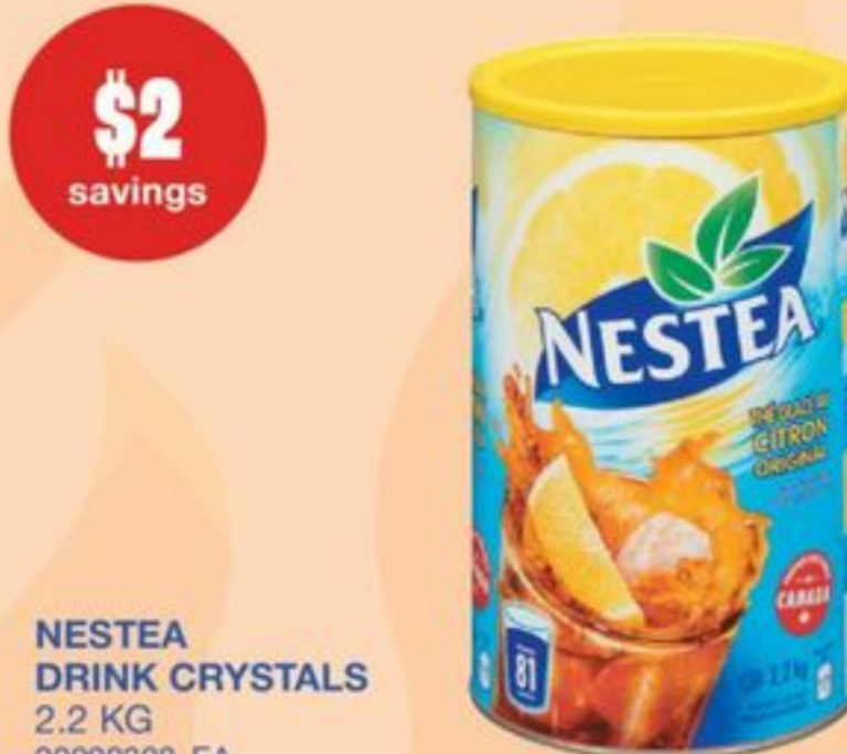
NESTEA DRINK CRYSTALS 2.2 KG 20098328_EA