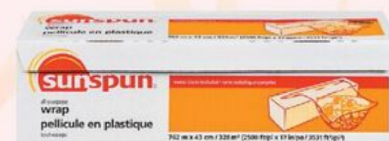
SUNSPUN™ ALL-PURPOSE WRAP 2500' X 17" 20077370_EA