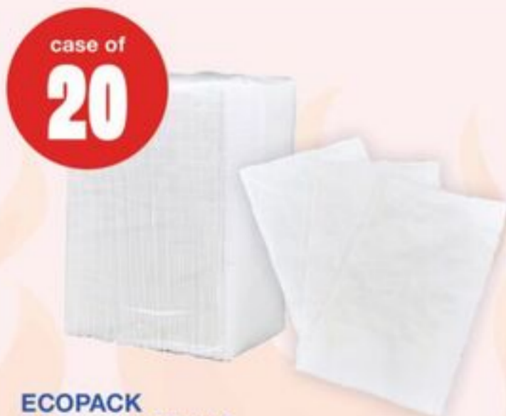
ECOPACK DINNER NAPKINS WHITE, 15 X 17" 20 SLEEVES X 150'S 21734370_C20