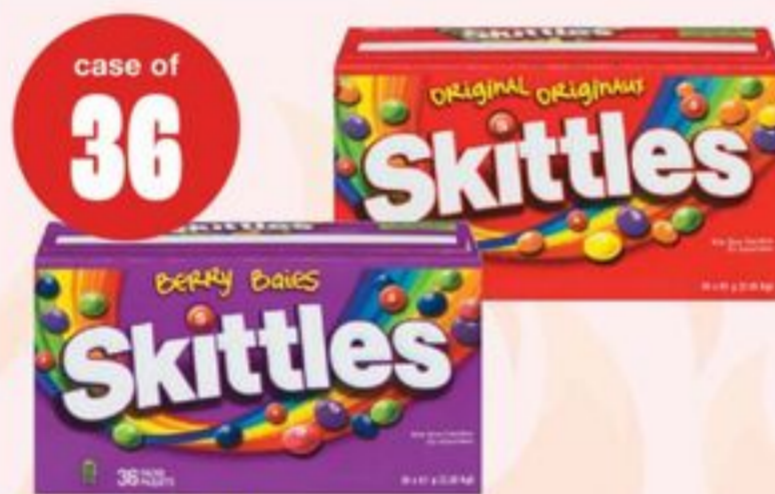
SKITTLES OR STARBUST CANDIES SELECTED VARIETIES 36'S 20686198001_C36/20707917_C36