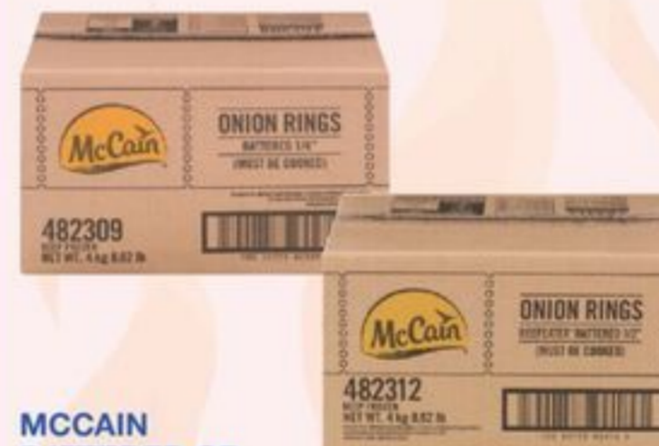
MCCAIN BATTERED OR BEEFEATER ONION RINGS FROZEN, 4 KG 20083180_EA/20779718_EA