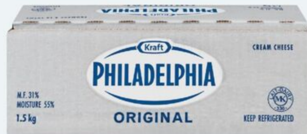
PHILADELPHIA CREAM CHEESE 1.5 KG 20017153002_EA