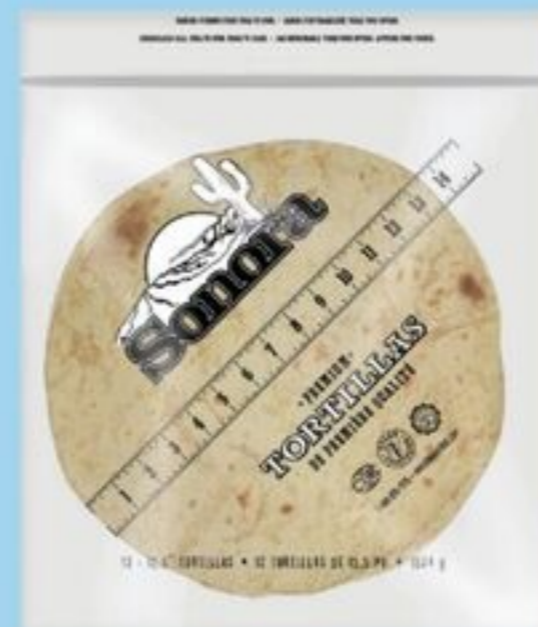
SONORA 13.5" FLOUR TORTILLAS 12'S 21532737_EA