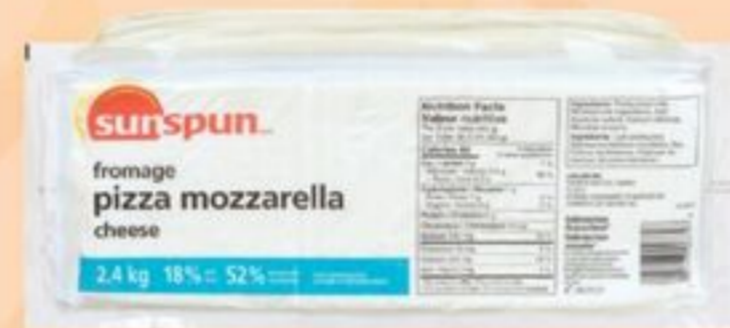
SUNSPUN™ PIZZA MOZZARELLA CHEESE 18% M.F., 2.4 KG 21383785_EA