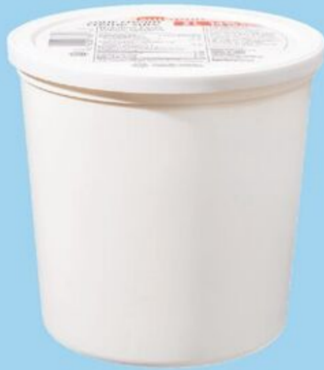
SUNSPUN™ SOUR CREAM 14% M.F., 2 L 20160751_EA