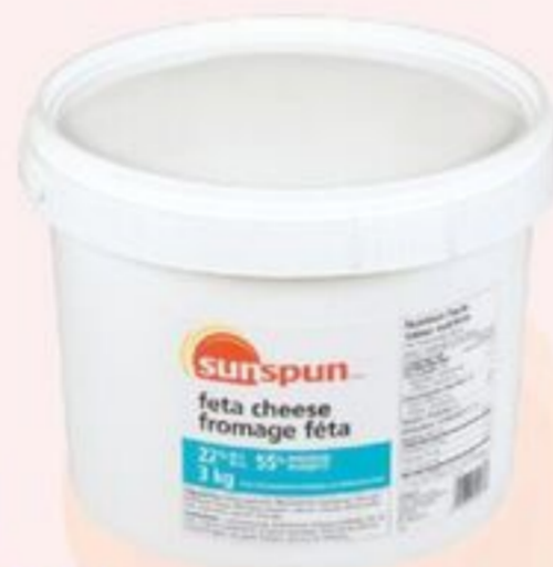
SUNSPUN™ FETA CHEESE 22% M.F., 3 KG 21279915_EA