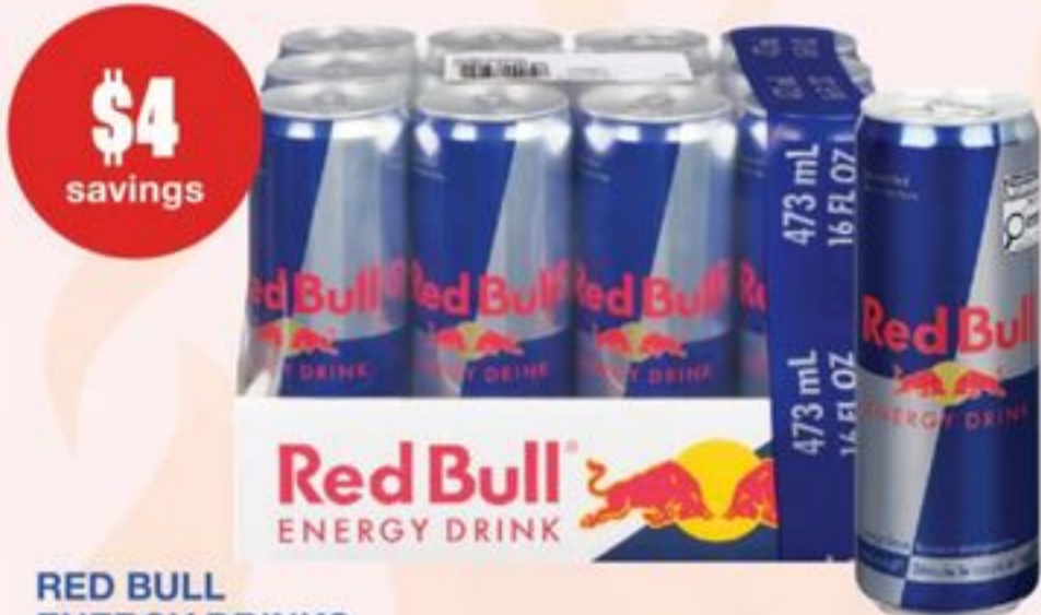
RED BULL ENERGY DRINKS SELECTED VARIETIES 12 X 473 ML 20370365001_C12