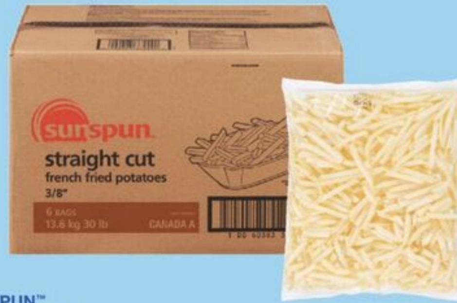
SUNSPUN™ STRAIGHT CUT 3/8 FRENCH FRIES FROZEN, 13.6 KG 20313990001_EA