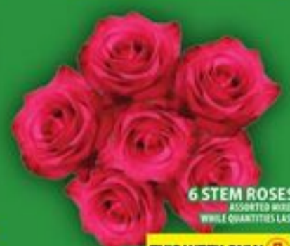
6 STEM ROSES ASSORTED MIXES WHILE QUANTITIES LAST