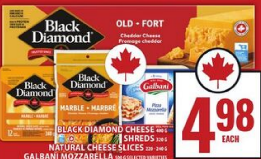
BLACK DIAMOND OLD - FORT Cheddar Cheese Fromage cheddar