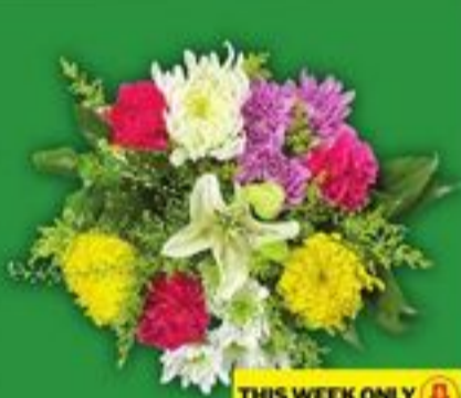
HOLIDAY DELUXE BOUQUET ASSORTED MIXES WHILE QUANTITIES LAST