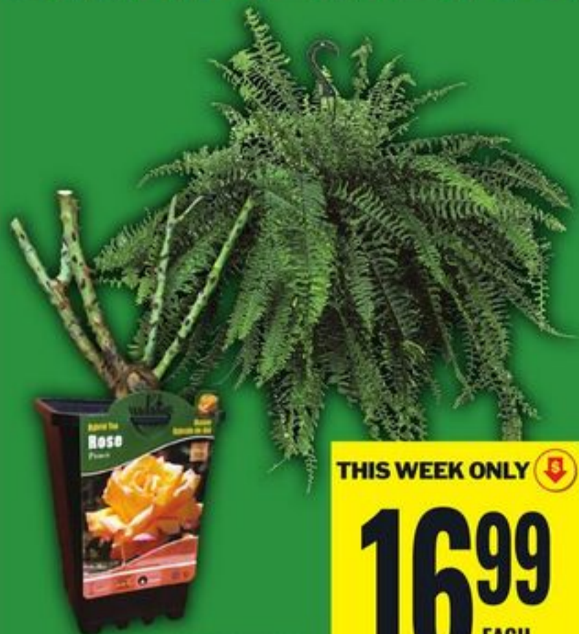
10" BOSTON FERN HANGING BASKET OR ASSORTED TEA ROSE ASSORTED VARIETIES, WHILE QUANTITIES LAST