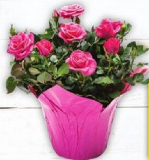
6" ROSEBUSH WHILE QUANTITIES LAST