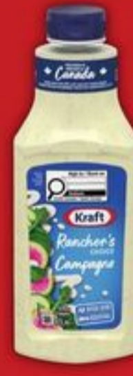
KRAFT SALAD DRESSING 425 ML SELECTED VARIETIES