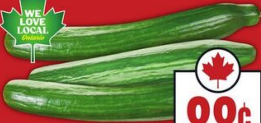
CUCUMBERS PRODUCT OF ONTARIO CANADA NO. 1 GRADE