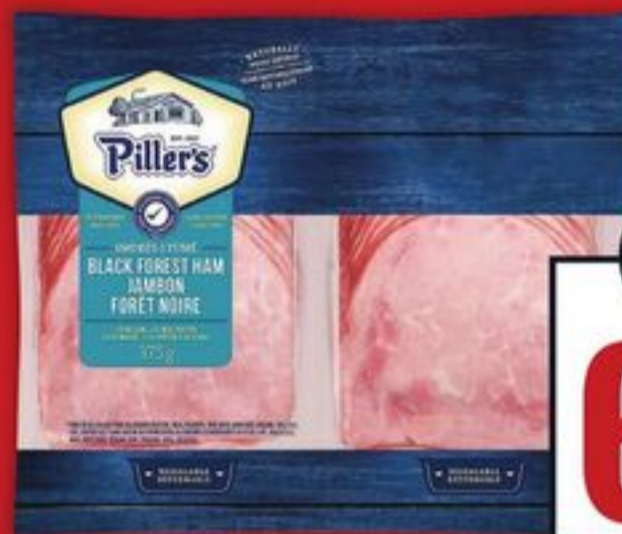
PILLER'S SLICED DELI MEAT 28 x 125 - 325 G SELECTED VARIETIES