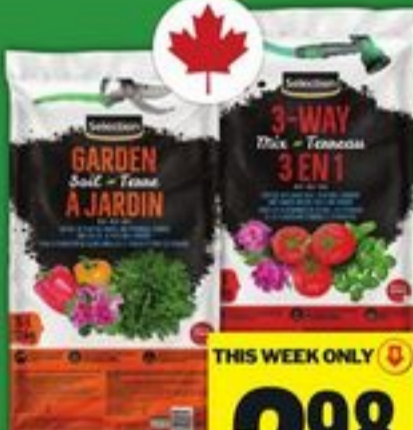
SELECTION GARDEN SOIL ASSORTED VARIETIES WHILE QUANTITIES LAST