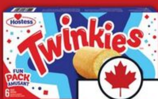
DEMPSTER'S BAGELS 450 - 510 G HOSTESS SNACK CAKES 6.5 SELECTED VARIETIES