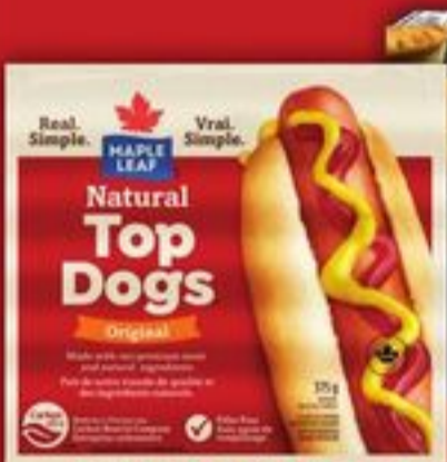
SCHNEIDERS RED HOTS OR MAPLE LEAF TOP DOGS WIENERS 375 G OR SCHNEIDERS MEAT PIES 330 - 400 G FROZEN SELECTED VARIETIES