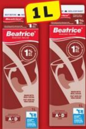
BEATRICE CHOCOLATE MILK 1 L SELECTED VARIETIES