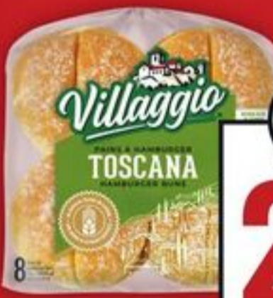
VILLAGGIO BREAD 550 - 675 G BUNS 6 - 8.5 SELECTED VARIETIES