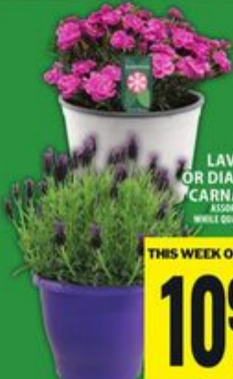
LAVENDER OR DIANTHUS CARNATIONS ASSORTED COLOURS WHILE QUANTITIES LAST