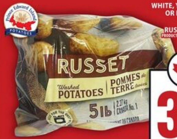
WHITE, YELLOW FLESH OR RED POTATOES PRODUCT OF CANADA NO. 1 GRADE 5 LB RUSSET POTATOES PRODUCT OF PRINCE EDWARD ISLAND CANADA NO. 1 GRADE 5 L