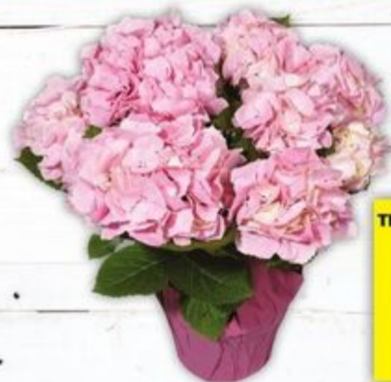
6" HYDRANGEA ASSORTED COLOURS WHILE QUANTITIES LAST