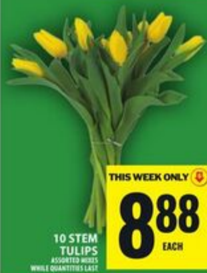
10 STEM TULIPS ASSORTED MIXES WHILE QUANTITIES LAST