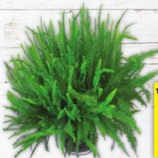
KIMBERLEY FERN ASSORTED COLOURS WHILE QUANTITIES LAST