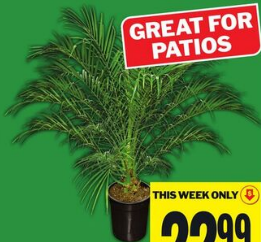
10" MAJESTY PALMS WHILE QUANTITIES LAST