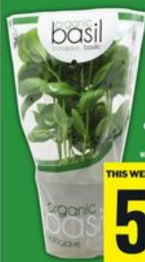
6" ORGANIC BASIL ASSORTED COLOURS WHILE QUANTITIES LAST