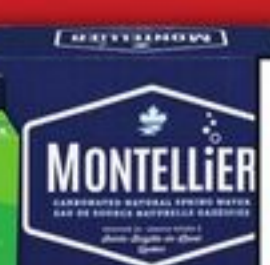
BUBLY SPARKLING WATER BEVERAGE 12 x 355 ML MONTELLIER CARBONATED NATURAL SPRING WATER 10 x 355 ML SELECTED VARIETIES