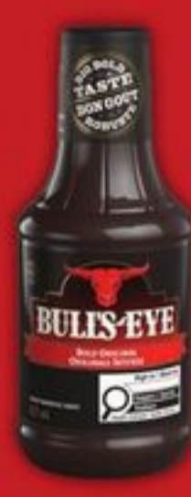
DIANA OR BULL'S EYE BBQ SAUCE 425 - 500 ML SELECTED VARIETIES