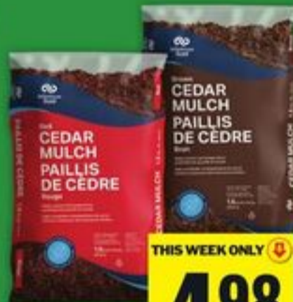
BLACK, RED OR BROWN MULCH ASSORTED VARIETIES WHILE QUANTITIES LAST