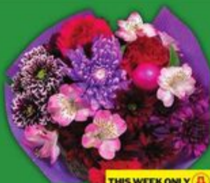
MIXED BOUQUET ASSORTED MIXES WHILE QUANTITIES LAST