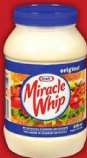
MIRACLE WHIP SPREAD 650 - 890 ML SELECTED VARIETIES