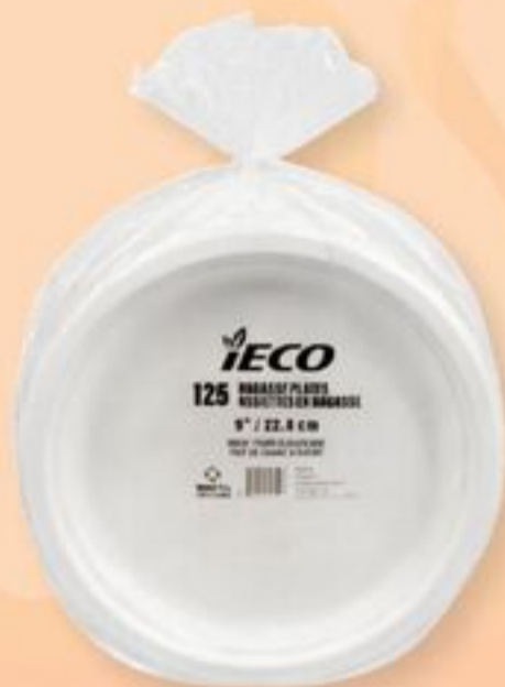
IECO BAGASSE PLATES 9", 125'S 21529157_EA