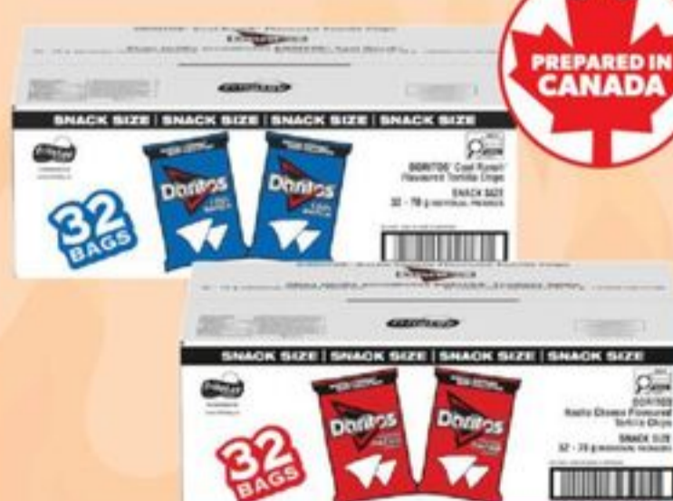
DORITOS TORTILLA CHIPS SELECTED VARIETIES 32'S 21721543_C32