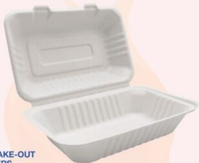
HINGED TAKE-OUT CONTAINERS SELECTED VARIETIES AND SIZES 9" X 6" X 3" 50'S 21672029_EA