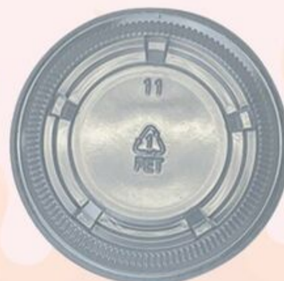
PORTION CUP LIDS CLEAR SELECTED VARIETIES AND SIZES 1.5-2.5 OZ, 100'S 21387439_EA