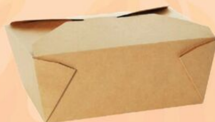
CAFÉ EXPRESS TAKE-OUT BOXES #8, 50'S 21423735_EA