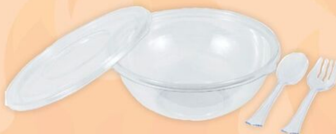
CAFÉ EXPRESS PET SALAD BOWLS 160 OZ, 4'S 21671961_EA