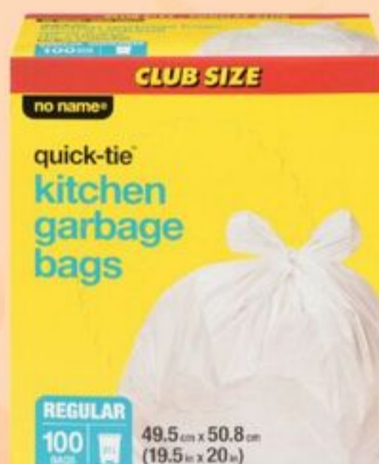
NO NAME® KITCHEN BAGS REGULAR, 100'S 21425519_EA