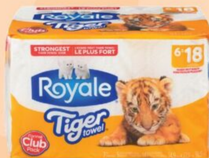
ROYALE TIGER TOWEL SELECTED VARIETIES 6=18 ROLLS, 6'S 21526573_EA