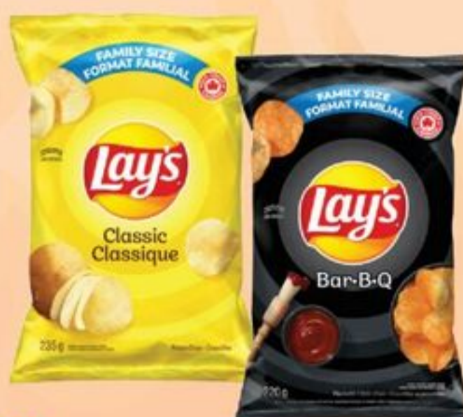
LAY'S POTATO CHIPS SELECTED VARIETIES 220/235 G 21241032_EA/21664493_EA