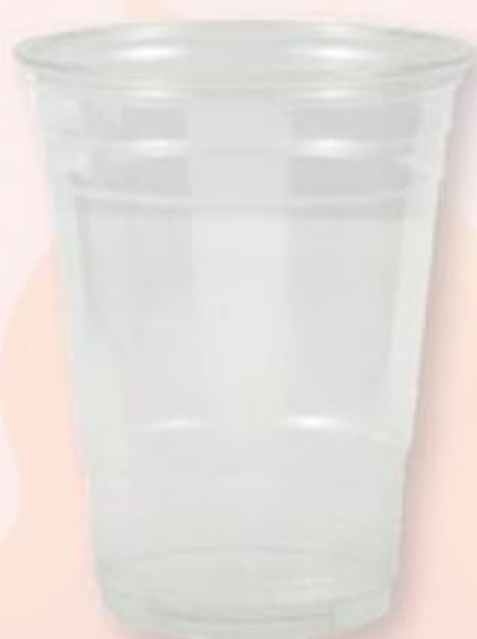
CAFÉ EXPRESS PET CUPS 16 OZ, 50'S 21460797_EA