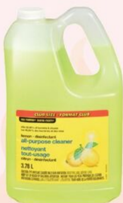
NO NAME® ALL-PURPOSE CLEANER LEMON, 3.78 L 21207735_EA