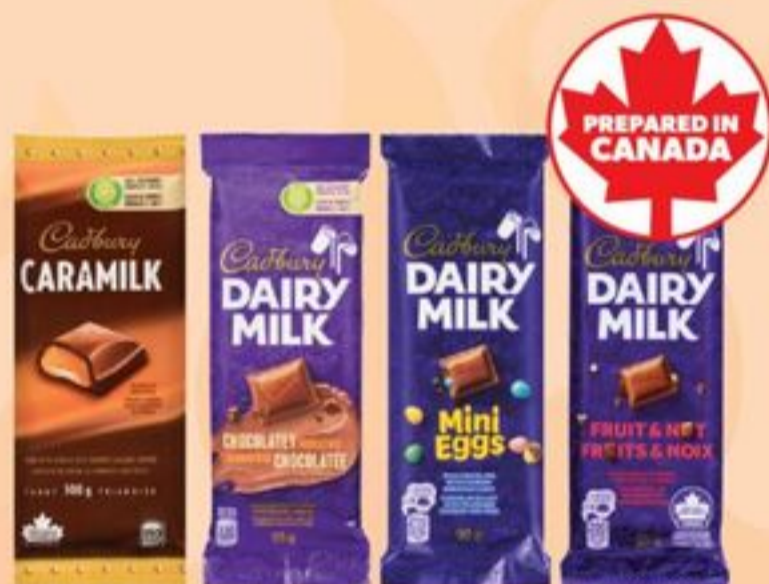
CADBURY FAMILY CHOCOLATE BAR SELECTED VARIETIES 90-100 G 21338333_EA/21648647_EA 20691626_EA/21648701_EA