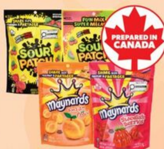
MAYNARD OR SOUR PATCH KIDS CANDY BAGS SELECTED VARIETIES 240-315 G 21545802_EA 21545817_EA 21545820_EA 21549747_EA