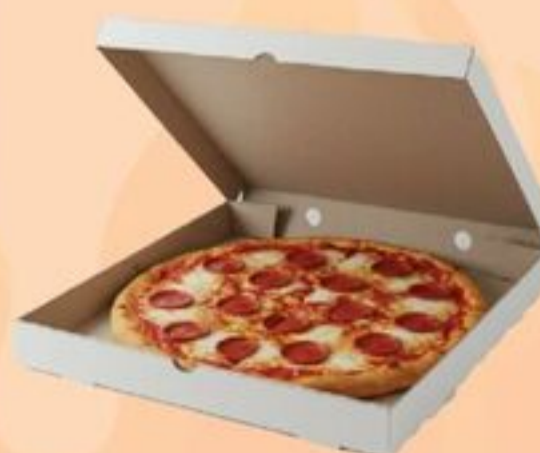
PIZZA BOX 12", 50'S SELECTED VARIETIES AND SIZES 21715718_C01