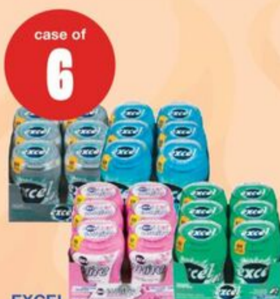
EXCEL GUM BOTTLES SELECTED VARIETIES, 6'S 20253506_C06 20310919002_C06 20310919004_C06 20545872_C06