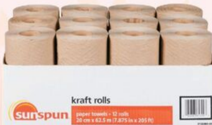
SUNSPUN™ KRAFT PAPER TOWEL ROLLS 12'S 20102855_EA