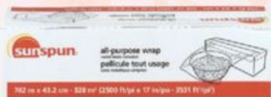
SUNSPUN™ ALL-PURPOSE WRAP 2500' X 17" 20077370_EA