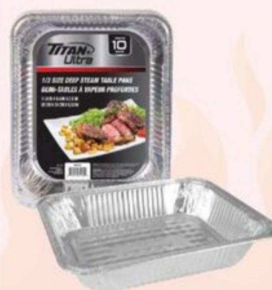
TITAN HALF STEAM PAN 10'S 21667077_EA