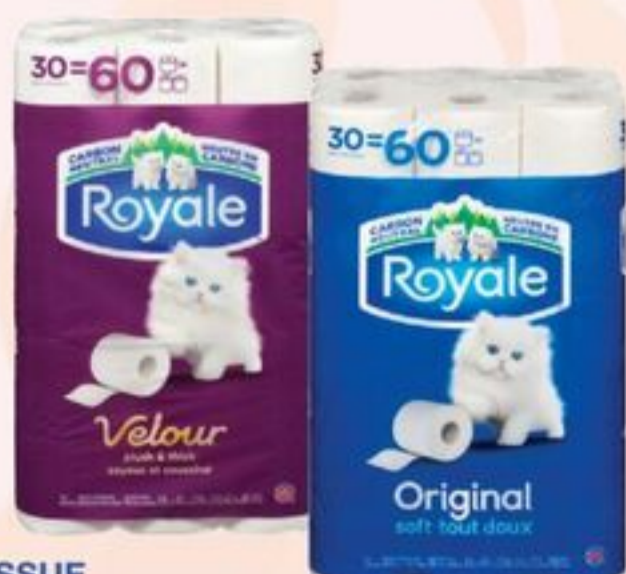
ROYALE BATHROOM TISSUE SELECTED VARIETIES 30=60 ROLLS, 30'S 21191252_EA 21378233_EA