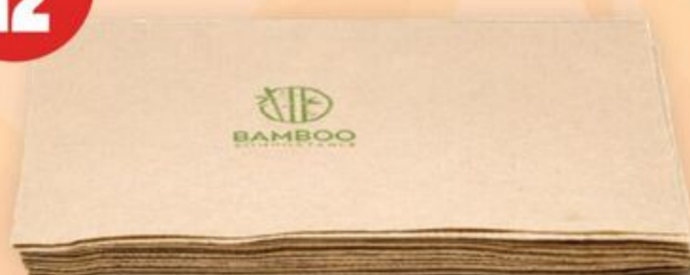
BAMBOO INTERFOLD NAPKIN 12 X 500'S 21733350_C12