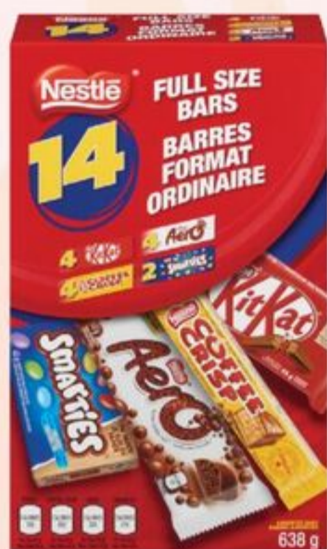
NESTLÉ ASSORTED CHOCOLATE BARS 14'S 21506185_EA