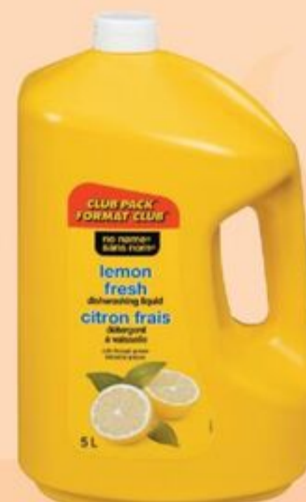
NO NAME® HAND DISHWASHING LIQUID LEMON CLUB PACK®, 5 L 21012774_EA