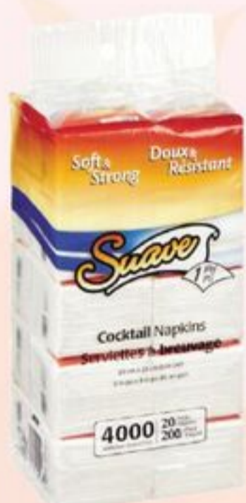
SUAVE COCKTAIL NAPKINS 20'S 21589948_EA