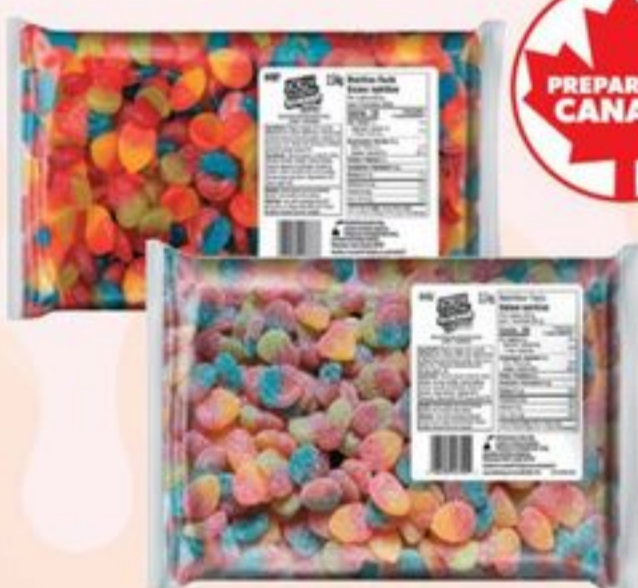
JOLLY RANCHER BULK CANDY SELECTED VARIETIES 2.5 KG 21596506_EA