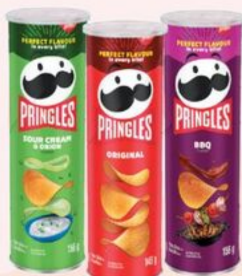
PRINGLES SUPERSTACK SELECTED VARIETIES 148/156 G 21003823_EA/21003832_EA 21003833_EA