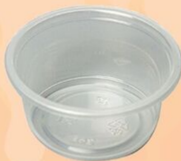
POTION CUPS SELECTED VARIETIES AND SIZES 2 OZ, 200'S 21368892_EA