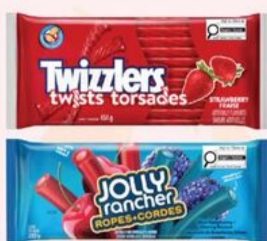
TWIZZLERS OR JOLLY RANCHER ROPES SELECTED VARIETIES 283-454 G 21545820_EA 21689823_EA