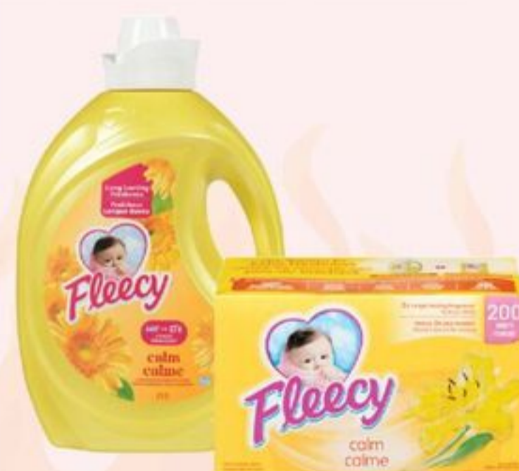
FLEECY LIQUID FABRIC CONDITIONER 3.5 L OR DRYER SHEETS 200'S 21311735_EA 21367271_EA