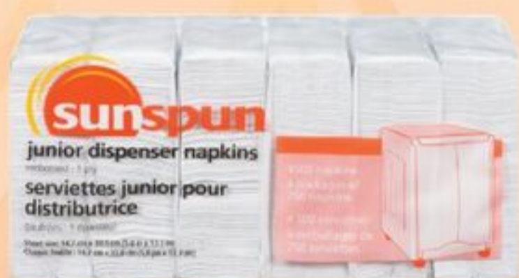
SUNSPUN™ JUNIOR DISPENSER NAPKINS 750'S 20426996_EA