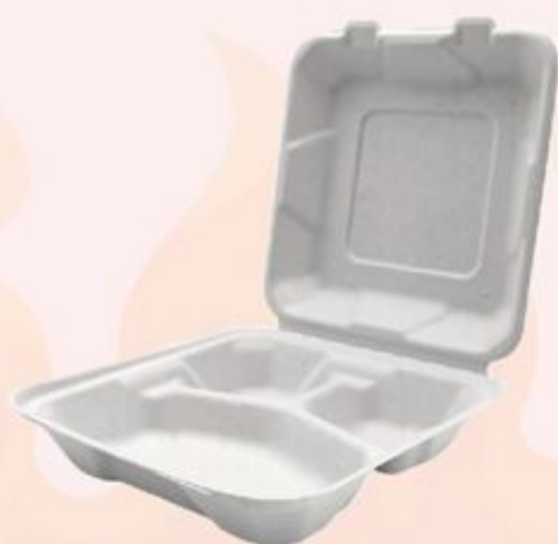
HINGED 3-CMP TAKE-OUT CONTAINERS 8" X 8" X 3" 100'S 21672163_EA