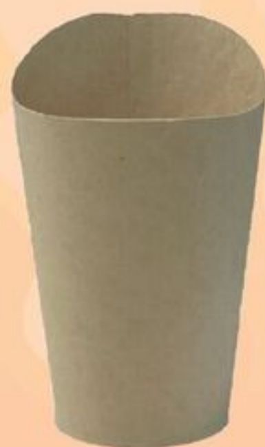
FRY CUPS 12 OZ, 100'S 21597070_EA