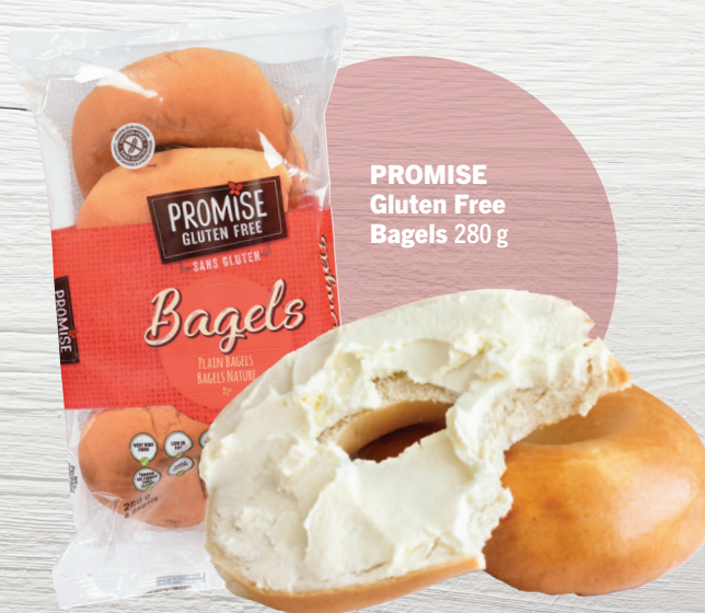
PROMISE Gluten Free Bagels 280 g