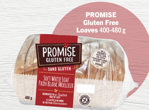
PROMISE Gluten Free Loaves 400-480 g