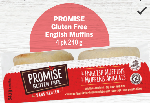
PROMISE Gluten Free English Muffins 4 pk 240 g