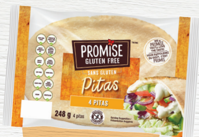
PROMISE Gluten Free Pitas 4 pk 248 g