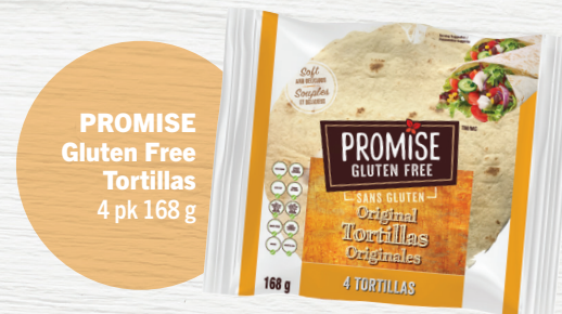
PROMISE Gluten Free Tortillas 4 pk 168 g