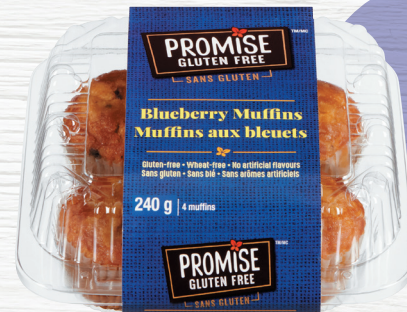
PROMISE Gluten Free Muffins 4 pk 240 g