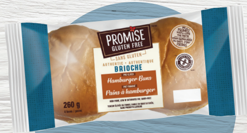
PROMISE Gluten Free Brioche Hot Dog or Hamburger Buns 4 pk 260-280 g