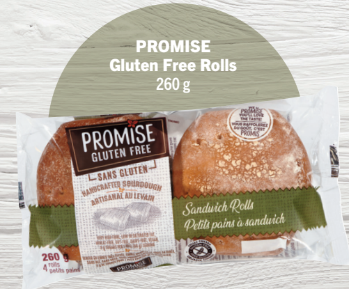
PROMISE Gluten Free Rolls 260 g