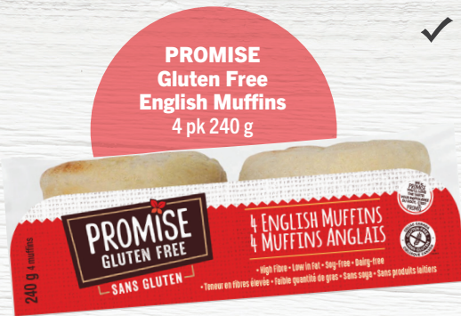
PROMISE Gluten Free English Muffins 4 pk 240 g