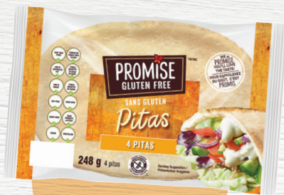
PROMISE Gluten Free Pitas 4 pk 248 g