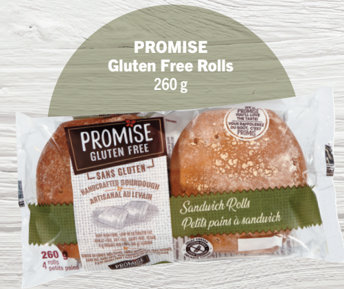
PROMISE Gluten Free Rolls 260 g