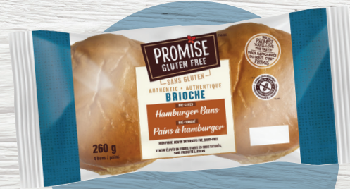
PROMISE Gluten Free Brioche Hot Dog or Hamburger Buns 4 pk 260-280 g