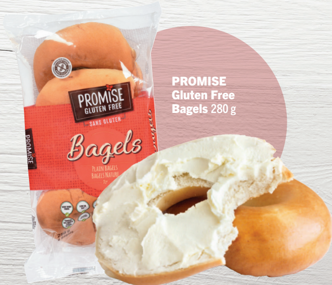
PROMISE Gluten Free Bagels 280 g