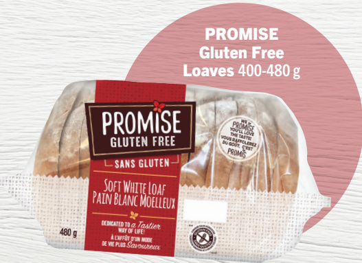
PROMISE Gluten Free Loaves 400-480 g