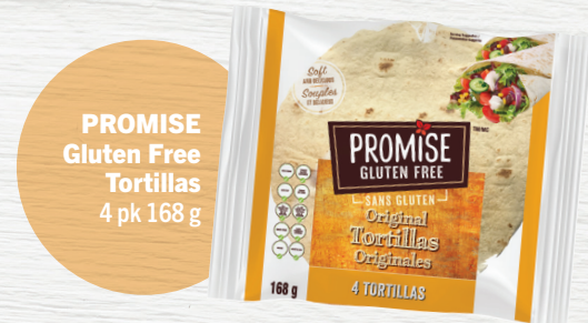
PROMISE Gluten Free Tortillas 4 pk 168 g