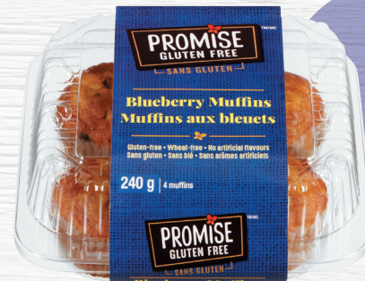
PROMISE Gluten Free Muffins 4 pk 240 g