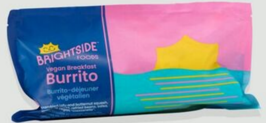
Brightside Foods Burrito $8 99 (375g) or Pinto Pockets (300g), Selected Varieties, Frozen