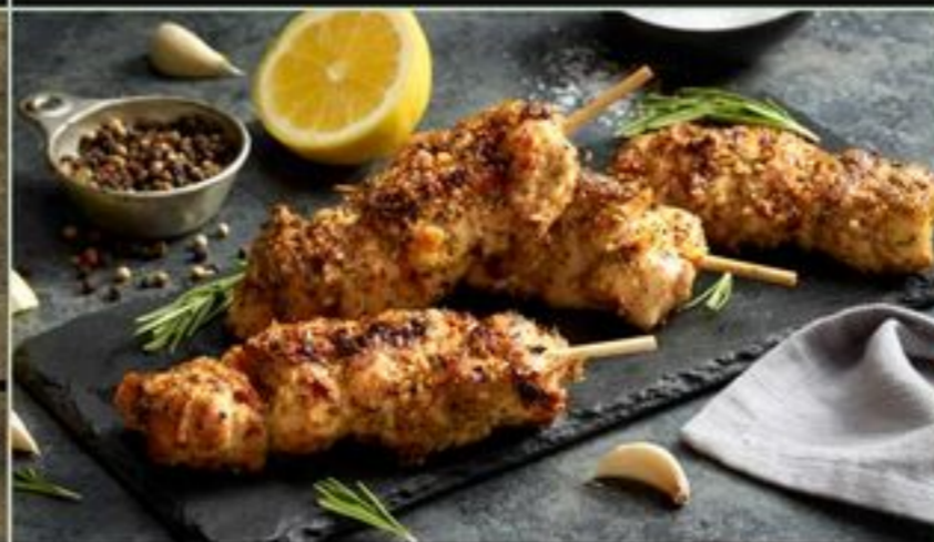
Marinated Chicken Kabobs Fresh, Selected Varieties, 22.02/kg