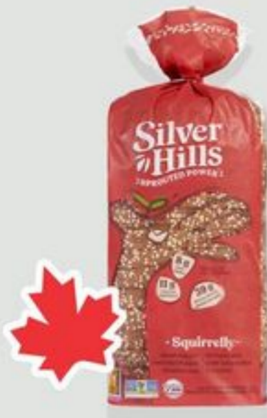
Silver Hills Squirrelly Bread $5 99 Selected Varieties, 600g