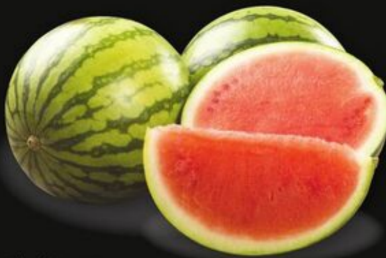
Mini Seedless Watermelon Mexico