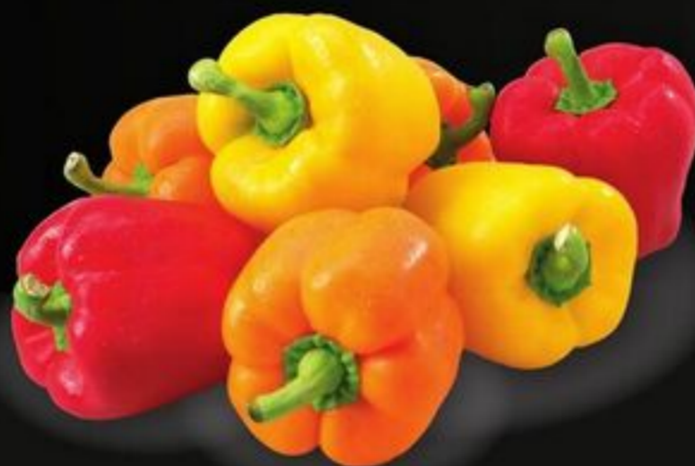
Coloured Peppers BC, 8.80/kg