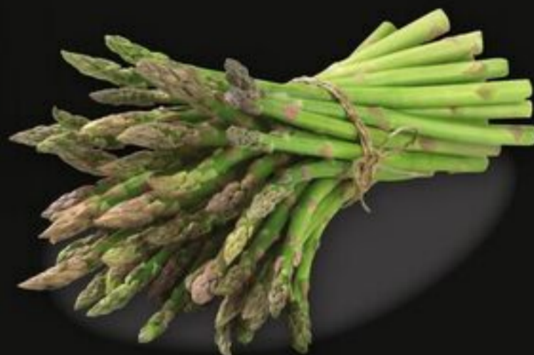
Asparagus Mexico, 13.21/kg