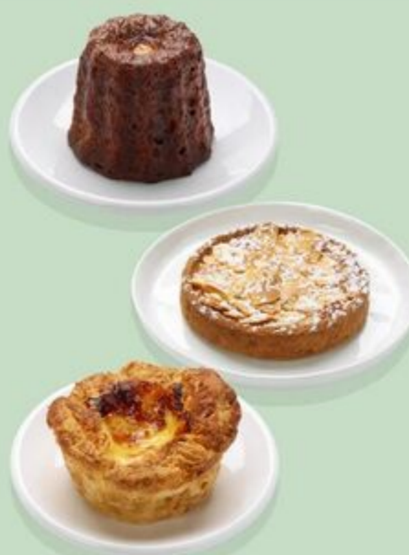
Urban Fare Gourmet Pastries $3 49

Indulge in our irresistible selection of freshly crafted pastries, made with the finest ingredients and authentic recipes. Each bite brings a touch of sweetness and elegance to your day.