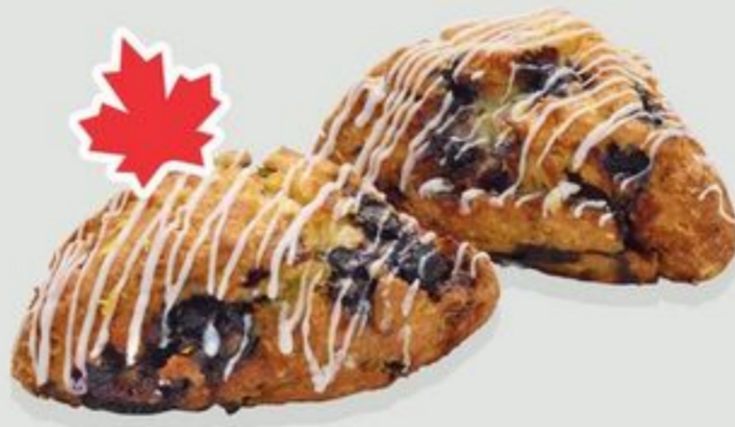
Scones $3 49 Selected Varieties, 200g or 229g