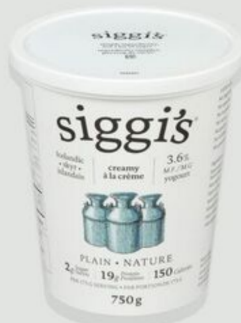
Siggis Yogurt $6 99 Selected Varieties, 750g