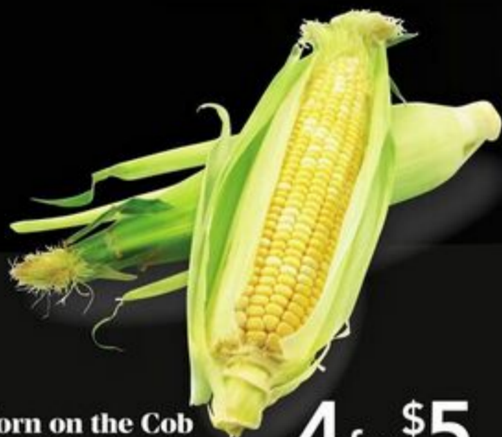
Corn on the Cob BC or USA