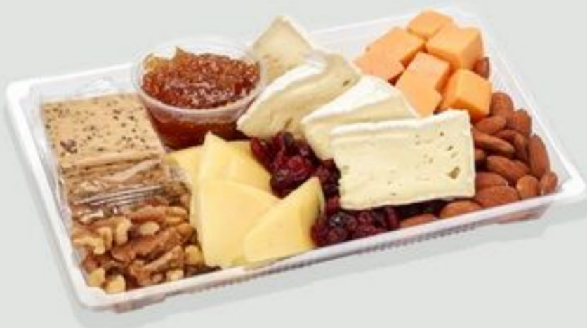
Charcuterie for 2 $8 99 with Signature Olives or Almonds, Made in Store