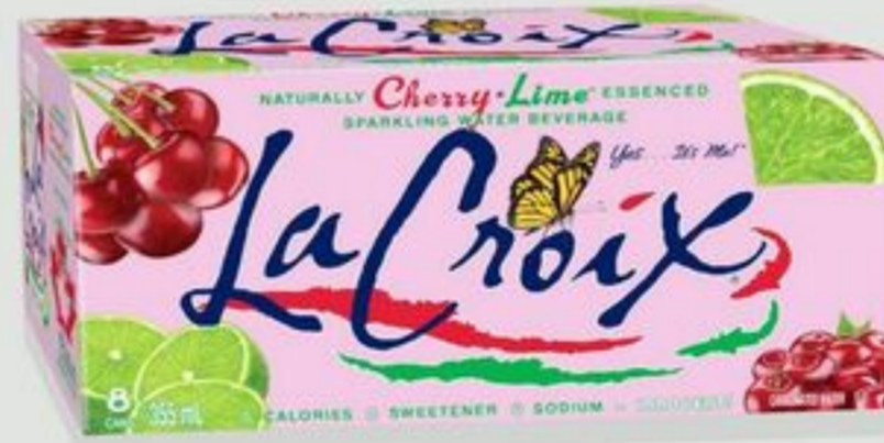
LaCroix Sparkling Water $6 99 Selected Varieties, 8 x 355 mL