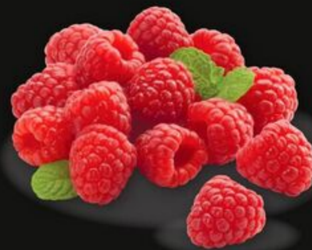
Raspberries or Blackberries, Mexico, 340g