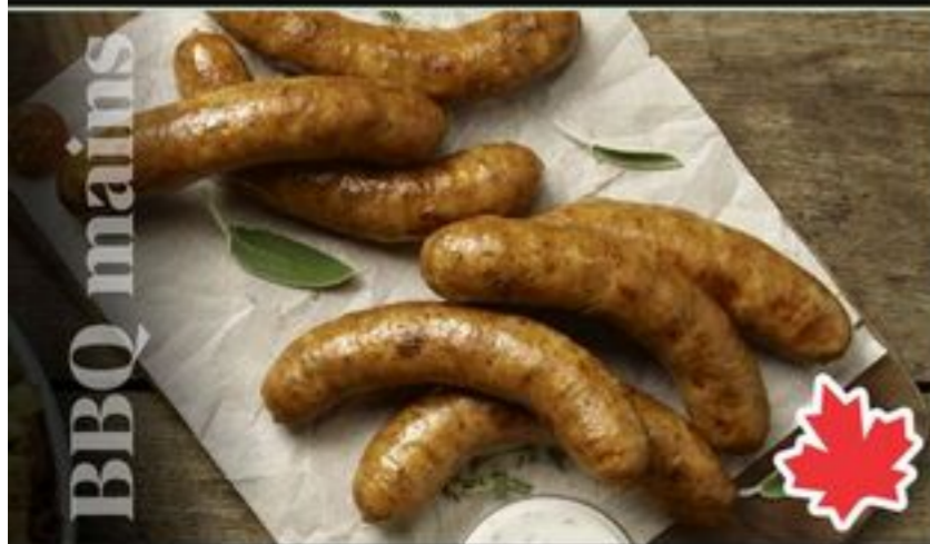
Gourmet Service Case Sausages Fresh