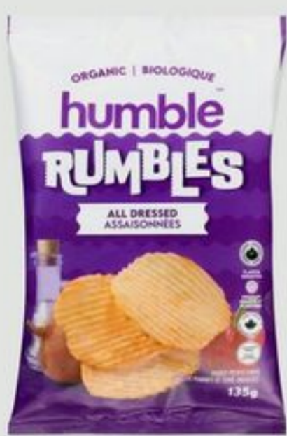
Humble Rumbles Potato Chips $4 49 135g