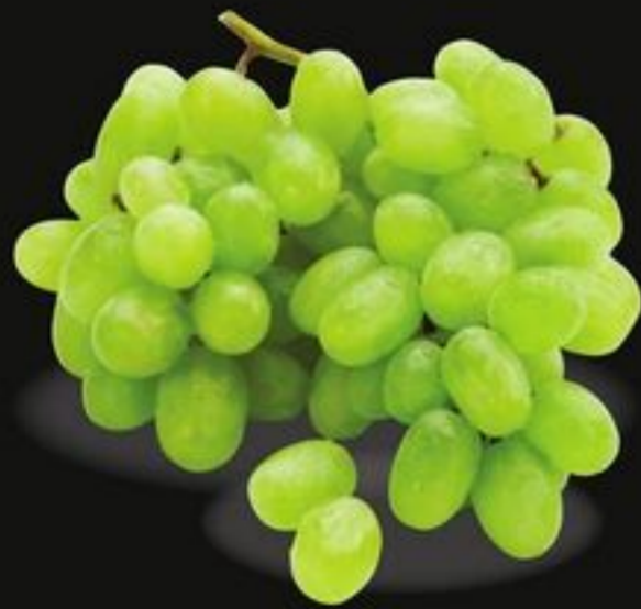
Green Seedless Grapes Peru, 11.00/kg