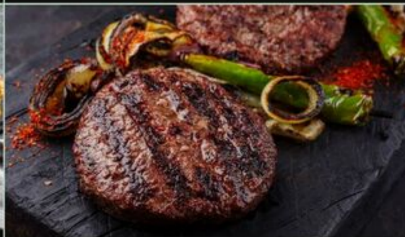
Fresh Gourmet Burger Patties Selected Varieties