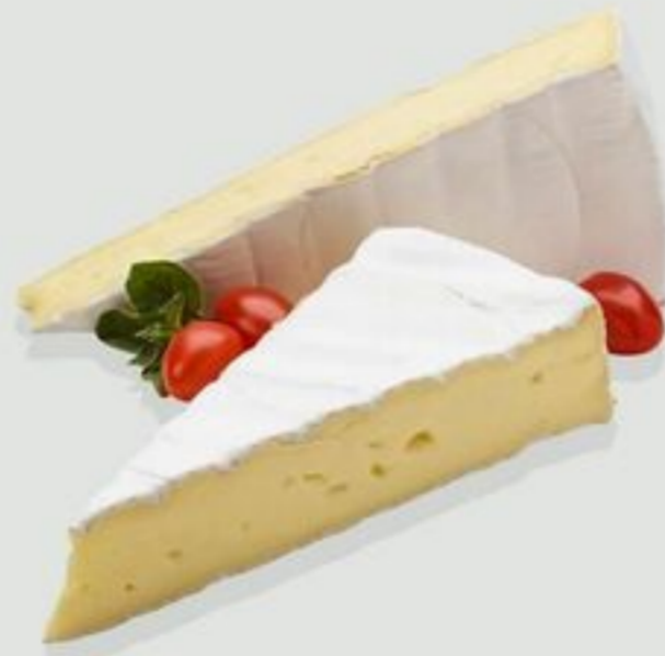
Double Crème Brie Cheese $3 99 /100g