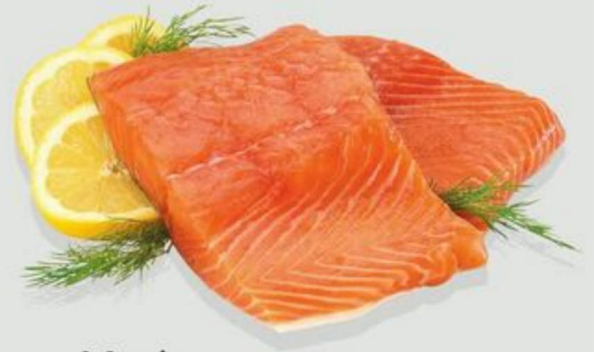
Atlantic Salmon Fillet $3 49 /100g Fresh, Farmed