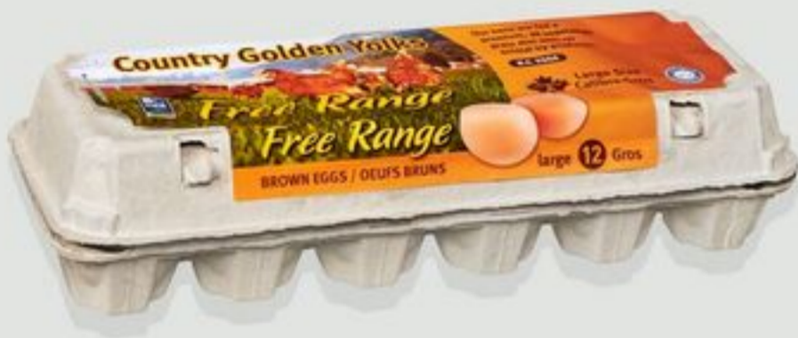
Golden Valley Eggs $6 99 Selected Varieties, Dozen