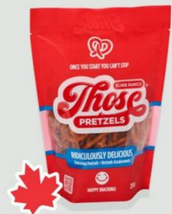
Those Pretzels $7 49 Original, 250g