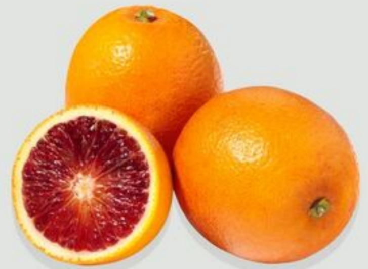
Raspberry Oranges $4 99 California, 2 lbs